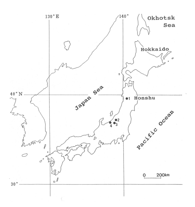
Figure 1. Localities of fossils.

Formation on the bank of the Maekawa River, 600 m south of Kiyamazawa, Nagaoka City, Niigata Prefecture (Figure 1, Loc. 2). The age of the upper part of this formation was assigned to the late Pliocene based on foraminifers by Kobayashi et al. (1991). Other than Nemocardium samarangae (Makiyama, 1934), the associated fauna consists of cold-water or extinct endemic species (Table 1). One more well-preserved specimen of Pomalulax omorii was collected from sandy siltstone of the Shitoka Formation, 550m upstream in the Shitoka River in Minami Uonuma City, Niigata Prefecture (Figure 1, Loc. 3). The age of the Shitoka Formation was assigned to the late Pliocene based on calcareous nannofossils by Amano et al. (2009). Many cold-water species and one warm-water species, Nemocardium samarangae (Makiyama, 1934), are associated with this specimen (Table 2).