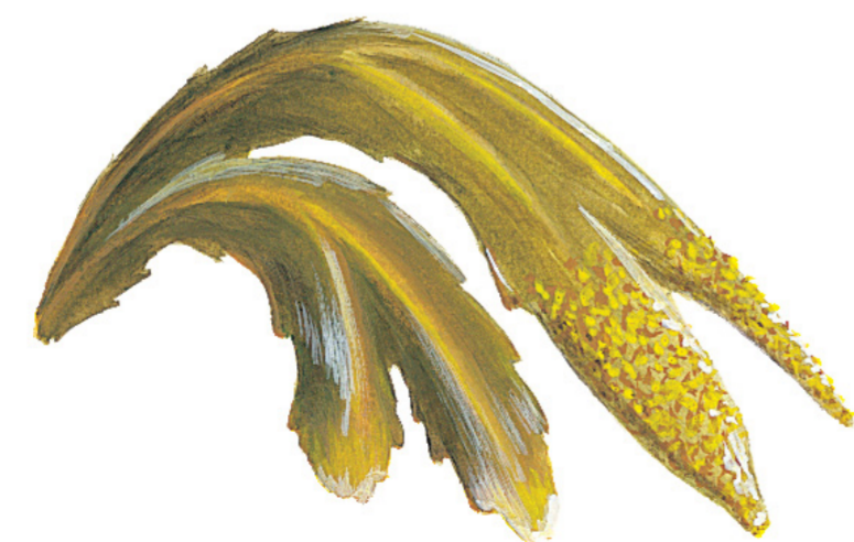
Sagþang Toothed wrack ( Fucus serratus )