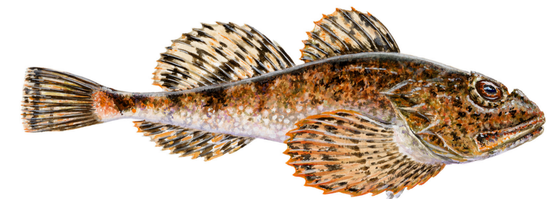
Marhnútur Short-horned sculpin / Bull-rout ( Myoxocephalus scorpius )