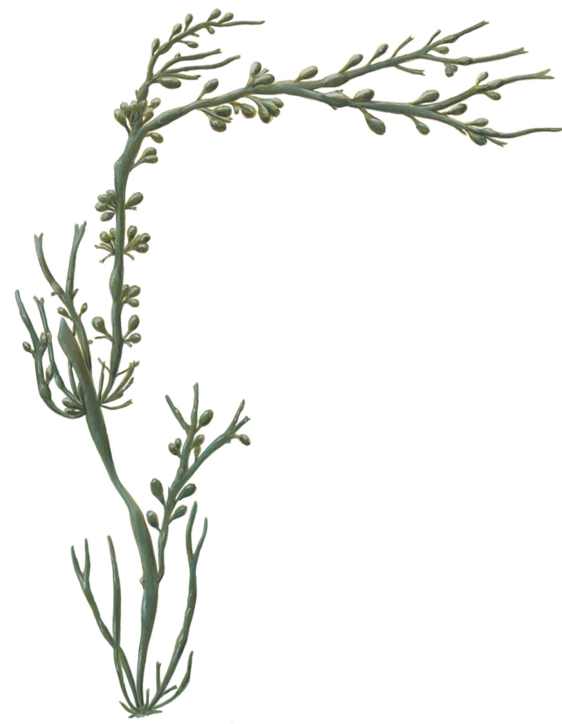
Klóþang Knotted wrack ( Ascophyllum nodosum )