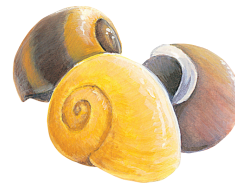
Þangdoppa Flat periwinkle ( Littorina obtusata )