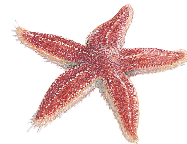
Stórkrossi Common starfish ( Asterias rubens )