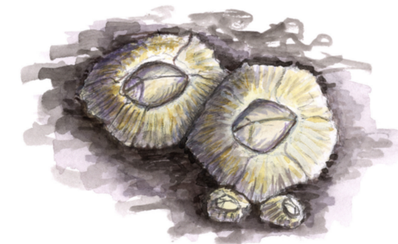
Fjörukárlar Acorn barnacles ( Semibalanus balanoides )