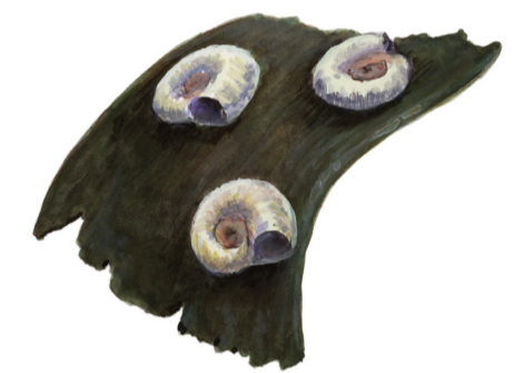
Snúðormar Spiral tubeworms ( Spirorbis spp.)