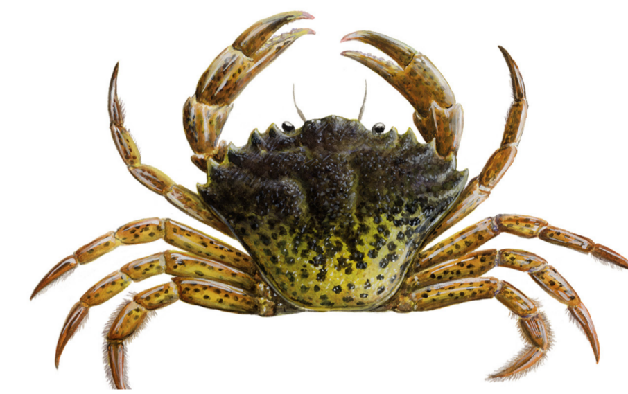
Bogkrabbi Common shore crab ( Carcinus maenas )