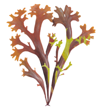
Fjörugrös Irish moss ( Chondrus crispus )