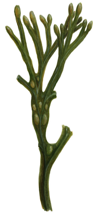
Bölupang Bladder wrack ( Fucus vesiculosus )