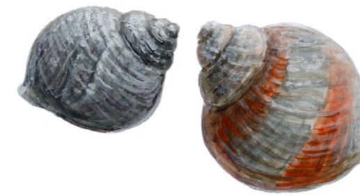
Klettadoppa Rough periwinkle ( Littorina saxatilis )

Við norðanverðan Skerjafjörð eru viðamiklar þangfjörur. Fjörurnar eru nokkuð stórgrýttar en vel aðgengilegar. Þar er mikill þörungavöxtur, einkum þangtegundir og þari en dýralíf er einnig mjög fjölskrúðugt. Á köflum er fjaran beltaskipt og vaxa ólíkar þangtegundir í hverju belti fyrir sig. Skiltið sýnir nokkrar af algengari lífverutegundum sem finnast í þangfjörunum.