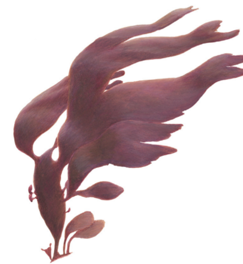
Söl Dulse ( Palmaria palmata )