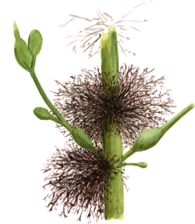
Þangskegg Tube weed ( Polysiphonia lanosa )