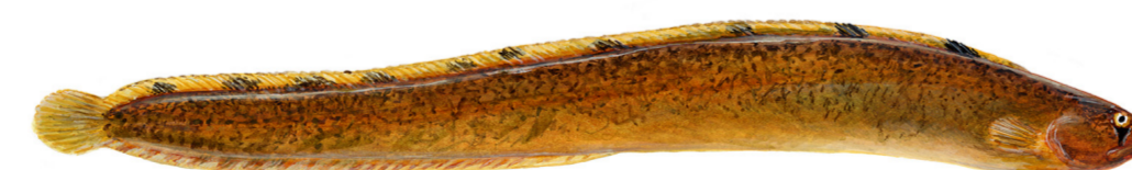
Sprettfiskur Butterfish ( Pholis gunnellus )