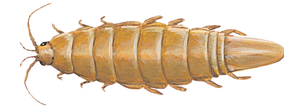
Þanglús Isopod ( Idotea granulosa )