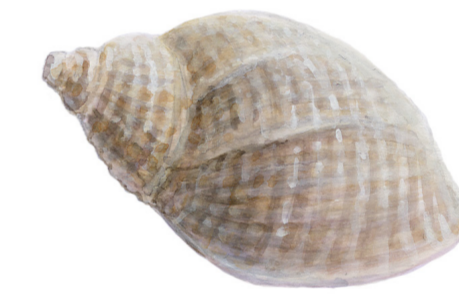
Nákuðungur Dog whelk ( Nucella lapillus )