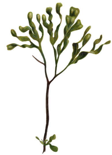
Klapparþang Spiral wrack ( Fucus spiralis )