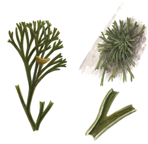
Dvergþang Channelled wrack ( Pelvetia canaliculata )