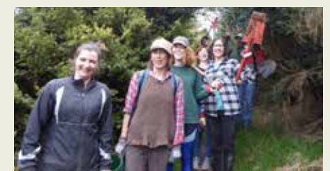
Many hands make light work.