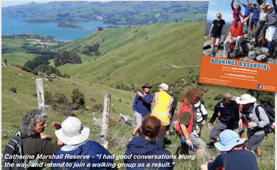
Catherine Marshall Reserve - "I had good conversations along the way, and intend to join a walking group as a result."