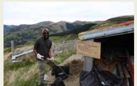
Some new fun - ‘Gravel as You Travel’ enables hut users to sprinkle a little gravel on muddy track patches as they walk out (All credit to Pete Ozich of Diamond Harbour for this clever idea and catchphrase!)