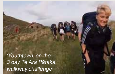
'Youthtown' on the 3 day Te Ara Pātaka walkway challenge