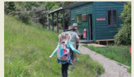
Rod Donald Hut is popular with families introducing their children to the joys of tramping.

Major projects include developing and securing public access on the Te Ara Pātaka tramping track, providing Rod Donald Hut, protection of over 450ha for biodiversity with full public