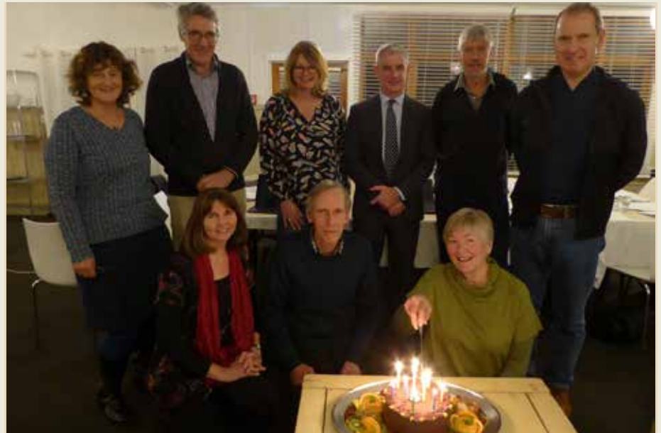
Rod Donald Trust celebrates its first 10 years.