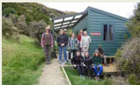
The working bee team taking a well-deserved break at the Hut.