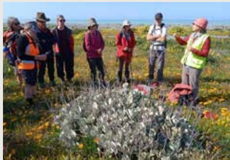
"Guides all were wonderful – inclusive, friendly, knowledgeable and well organised."