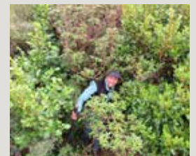
Popping out of the bush on the Mt Pearce Ridge Walk.