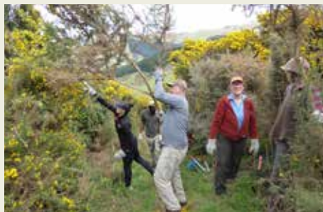
What a great show of team work by volunteers from Christchurch branch of the engineering firm ‘Jacobs’!

Book a stay with your family and friends at www.doc.govt.nz