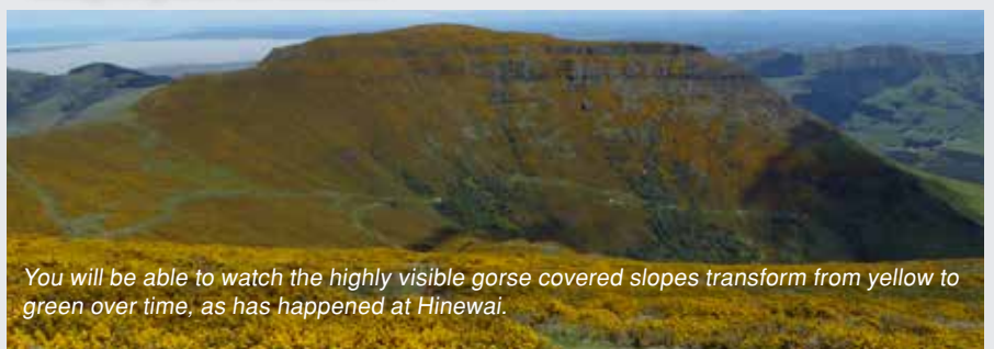
You will be able to watch the highly visible gorse covered slopes transform from yellow to green over time, as has happened at Hinewai.