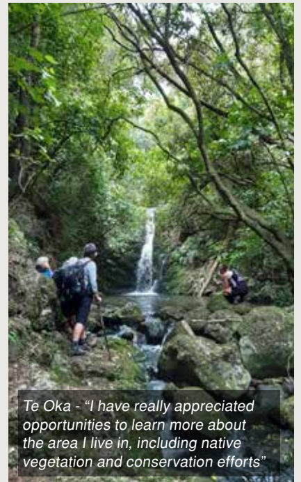
Te Oka - "I have really appreciated opportunities to learn more about the area I live in, including native vegetation and conservation efforts"