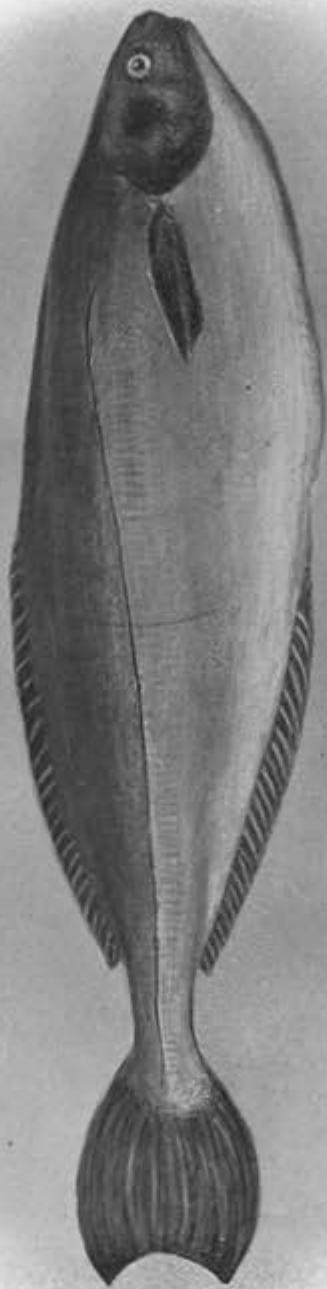
WILLOUGHBY'S RAG FISH ( Acanthopoma willoughbyi , Bean). Victoria, B.C., July, 1912. Two known specimens.