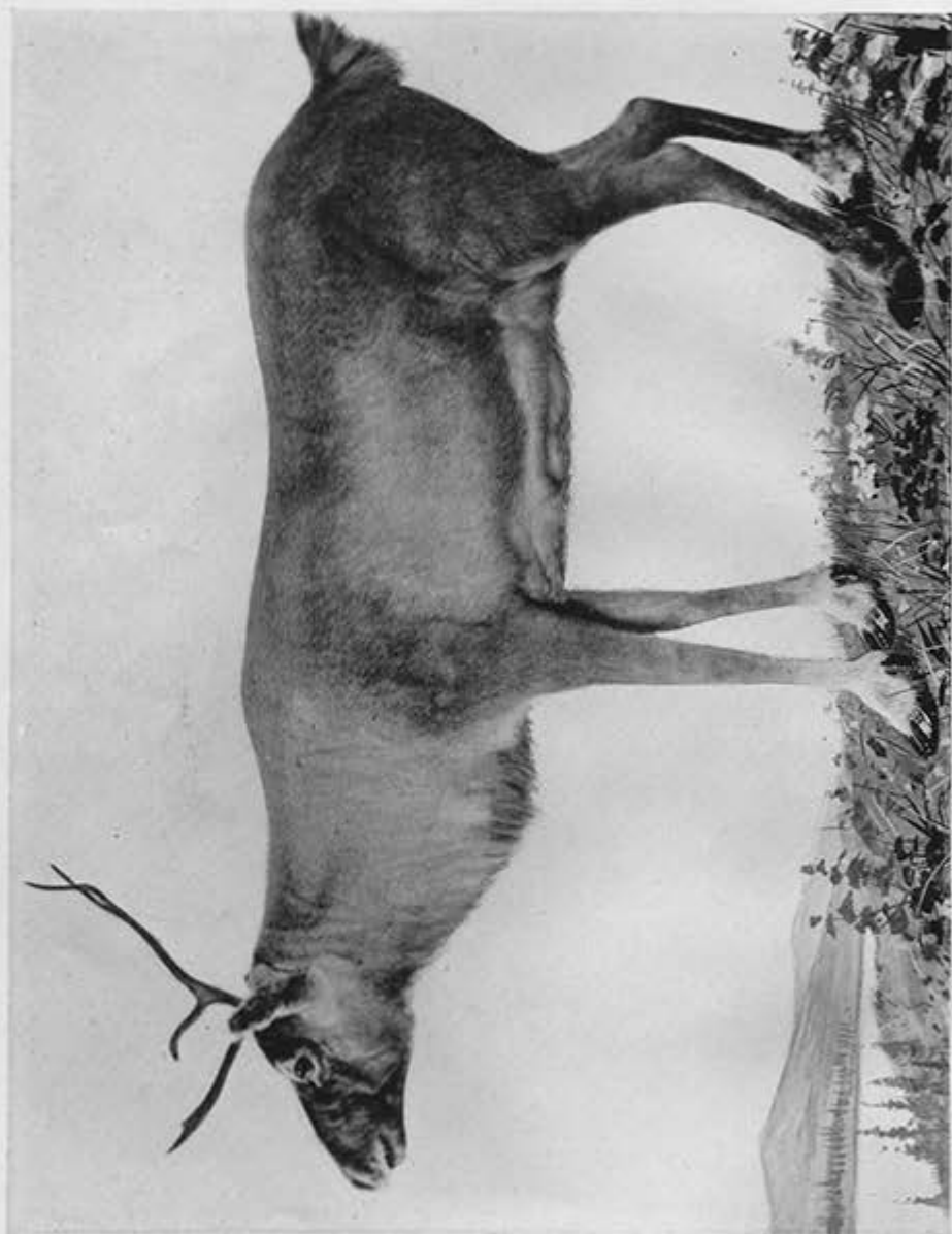
QUEEN CHARLOTTE CARIBOU ( Rangifer caribou , Seton-Thompson). Virago Sound, Queen Charlotte Island, November, 1908.