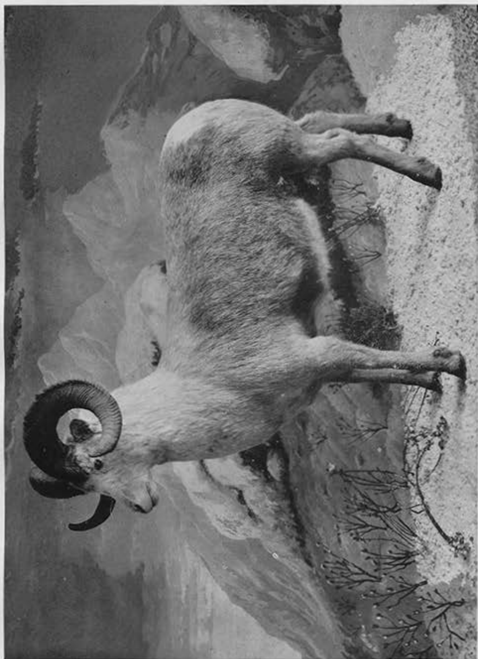
FANNIN'S MOUNTAIN SHEEP ( Ovis fanninellii , Hornaday). (Type Specimen.) Provincial Museum, Victoria, B.C.