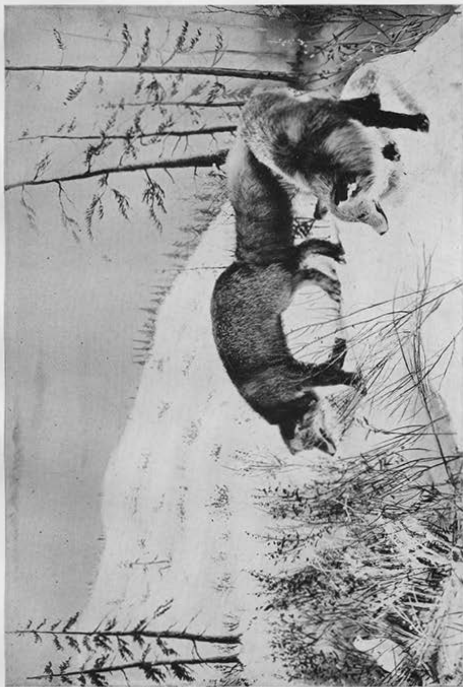
BRITISH COLUMBIA RED FOX ( Vulpes abascensis abietorum , Merriam).