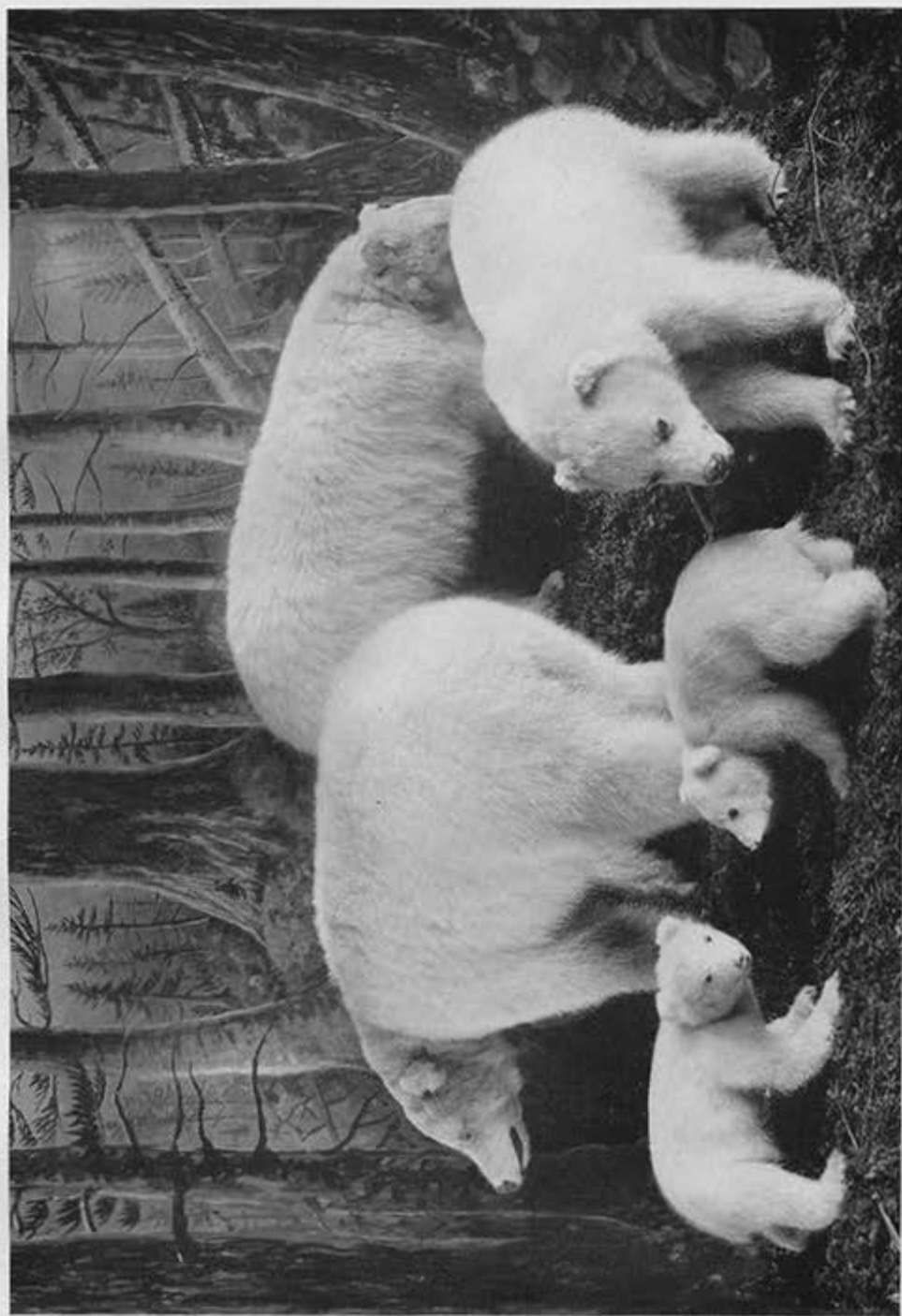
KERMODE'S WHITE BEAR ( Ursus kermodei , Hornaday). (Type Specimen.) Group in Provincial Museum, Victoria, B.C.