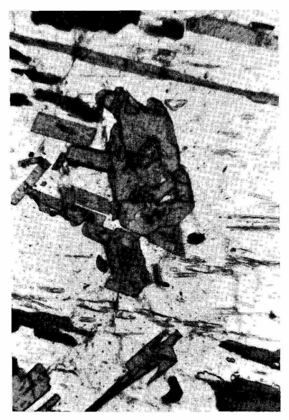
Fig. 2. Crystals of nigerite (grey) containing a core of spinel (black). Specimen HL-6, wall zone of the Rosendal pegmatite. Transmitted light, 90 X.

is uniaxial positive. A basal cleavage is weakly developed. In transmitted light nigerite shows a distinct yellowish brown colour, weak pleochroism (E pale grey-brown, O yellow-brown), high relief, and low birefringence. In reflected light in oil immersion the mineral shows a greyish colour somewhat lighter than spinel, no perceptible reflection pleochroism, a weak anisotropy, and high polishing hardness. In transmitted light the associated spinel always shows the same distinct grass-green colour, regardless of composition and Fe/Zn ratio. The unknown Fe-Al-oxide replacing nigerite shows a more greenish colour than nigerite, and a distinctly higher birefringence.