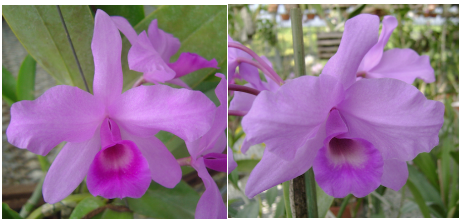
Guarianthe hennisiana (Rolfe) Van den Berg.