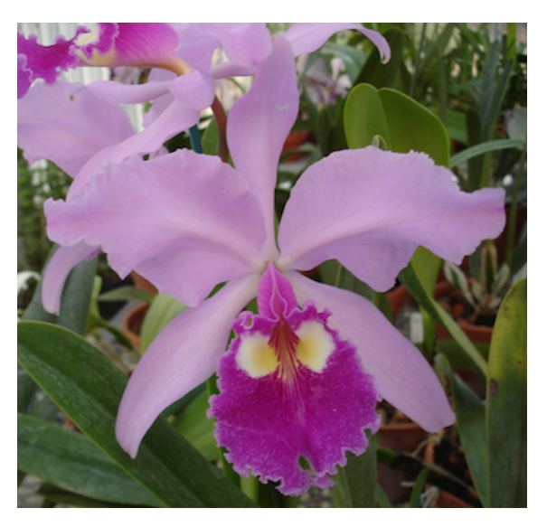
Cattleya warscewiczii Rchb. f.