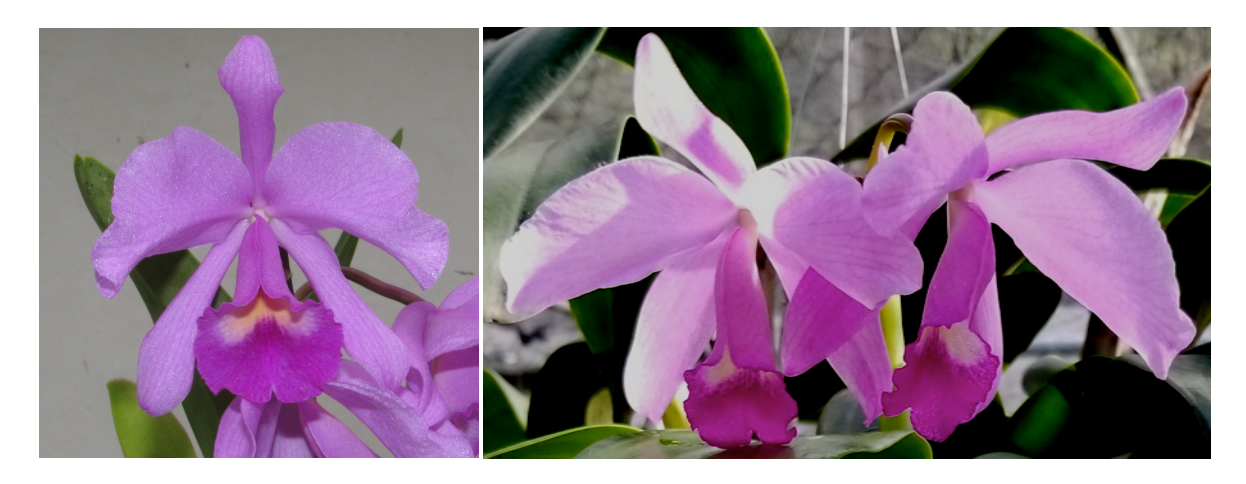
xCattlianthe dabeibaensis Sauleda, Niessen and Uribe.

Plant epiphytic, rhizomatous, to 30 cm tall; roots many, thick, canescent; primary stem or rhizome short, stout, creeping, enclosed by imbricating scarious sheaths; secondary stems modified into pseudobulbs, erect, clustered, linear oblanceolate to 28 cm long, x 4 cm thick, basally enclosed by scarious sheaths, 1 to 2 leaved at apex; leaves coriaceous, stiff, linear-lanceolate, obtuse, to 24 cm long, 5 cm wide; inflorescence terminal, to 20 cm tall, peduncles slender, erect, distantly several sheathed, to 8 flowers; flowers purple; floral sheath to 8 cm tall, 2.5 cm wide; floral bracts ovate, acute, concave, to 6 mm long, x 3 mm wide; ovary pedicellate, slender, to 6 cm long; sepals purple, elliptic, obtuse, to 4.0 cm long, 2 cm wide; petals purple obovate, obtuse, to 4.5 cm long 4.0 cm wide; labellum free from column, eliptic, to 4.5 cm long, 3.5 cm wide, basally light to dark purple, apically dark purple, with two light yellow spots in front of column; column white or flushed with light purple at edges, basally light green, elongate, to 1.8 cm long, 6 mm wide; anther yellow rarely white.