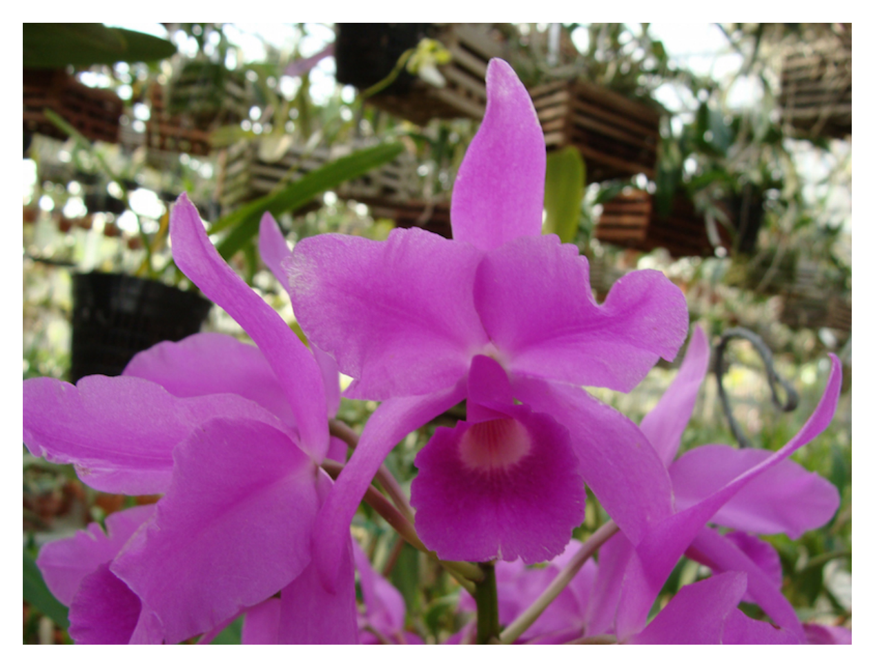
xCattlianthe dabeibaensis Sauleda, Niessen and Uribe with flower resembling Guarianthe hennisiana (Rolfe) Van den Berg.