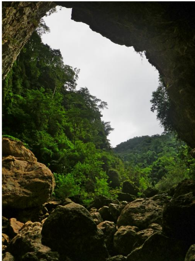
Figure 7: The light and penumbral zones of Actun Tunkul