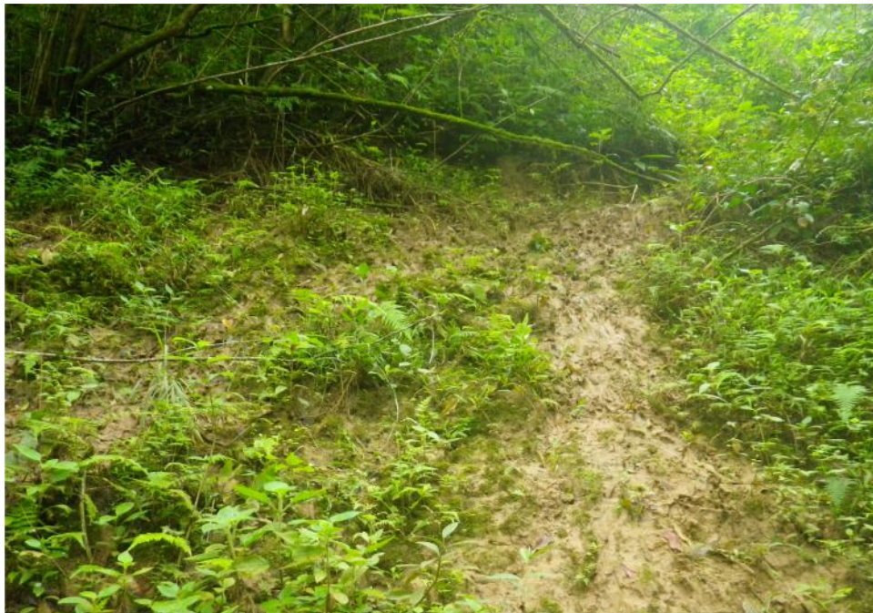
Figure 6: Frequently used Tapir and White-tailed Deer trail leading to pool, about 2 m away from the water mark (UTM coordinates: northing: 1843368; easting: 277229)