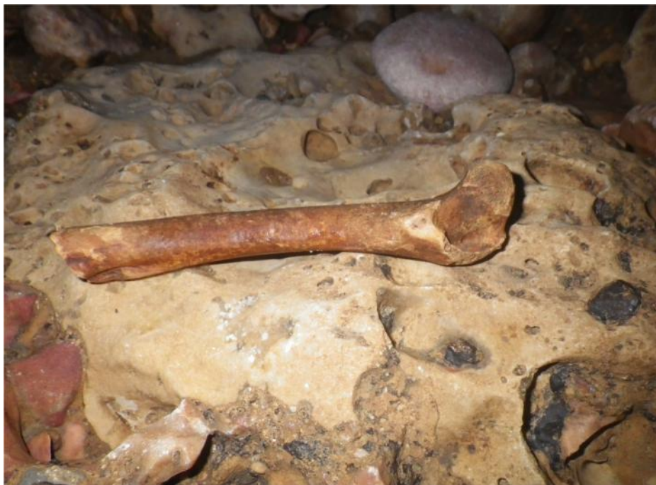
Figure 12: Bone of an unidentified species recorded inside Actun Tunkul