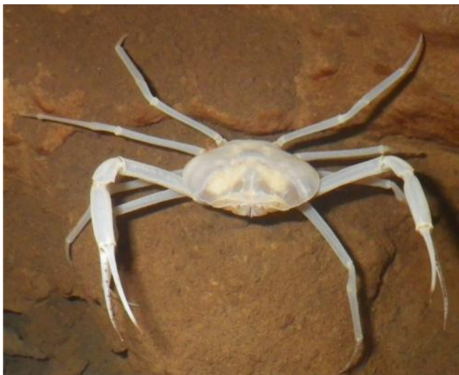
(A) Crab: Typhlopseudothelphusa acanthochela

Actun Tunkul was formed by a subterranean aquatic system that can presently be appreciated. The first permanent pool of water is about 70 m from the entrance of the cave and is about 2 m wide, 10 m in length and 1 m in depth; about 40 m further into the cave there is a second permanent pool about 3 times the length of the first. One kilometer into the cave there is a permanent stream that varies in width and depth. This aquatic system harbors a unique assemblage of aquatic fauna some of them being troglobites. During this expedition four aquatic species were recorded being: the crab Typhlopseudothelphusa acanthochela Hobbs 1986 (Figure 8 A; first collected in the CCS in 1984); the shrimp Macrobrachium cantonium Hobbs and Hobbs 1995 (Figure 8 B); an unidentified catfish Rhamdia sp. (Figure 8 C) and an unidentified eel species (Figure 8 D), which was first collected from the CCS (Tunkul) in 1998 by biologist Jean Krejca. The only recorded aquatic troglobites was T. acanthochela , which is completely pigmentless and lack vestiges of eyes. All catfishes, shrimps (even though these two species are classified as troglobites by Reddell & Veni (1996) and eel observed had well developed eyes and produced an eye-shine when light was directed at them, indicating that these species have functional eyes and were well pigmented, except for the shrimp, indicating that these are able to migrate to stream areas under direct sunlight; categorizing them as trogliphiles.