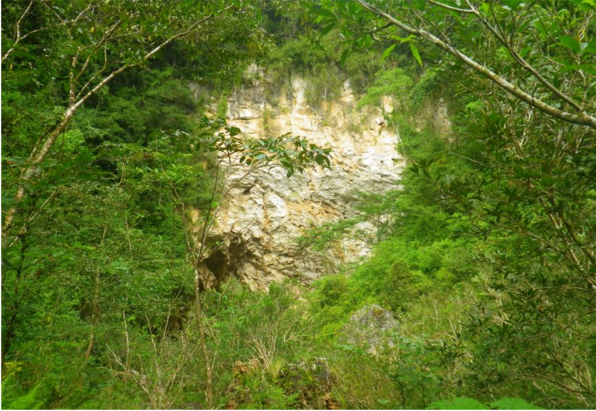
Figure 3: Broadleaved forest found around the entrance of Actun Tunkul (UTM coordinates: northing: 1843369; easting: 277174).