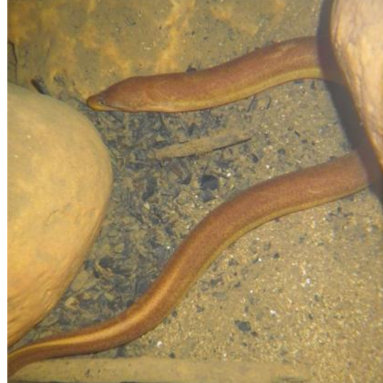
(D) Unidentified eel