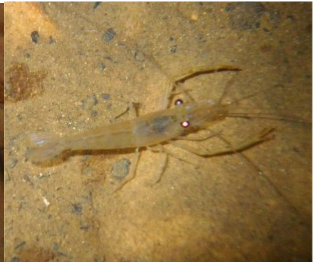
(B) Shrimp: Macrobrachium cantonium