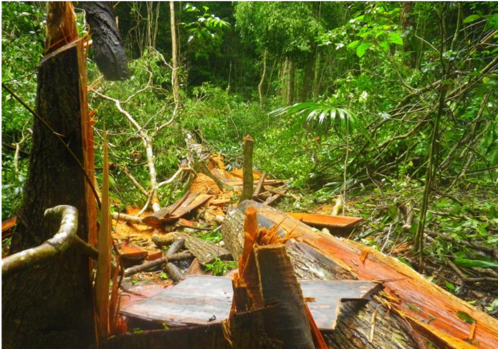
Figure 9: A freshly illegally logged cedar tree about 400 m east of Actun Tunkul (UTM coordinates: northing: 1843810; easting: 277746).

biodiversity and ecosystem functions around Tunkul. Identified threats include illegal logging (Figure 9), Xaté extraction (Figure 10) and hunting/ poaching. Illegal loggers have been primarily targeting two highly valuable hardwood species being mahogany and cedar. This activity is causing severe impact on targeted population densities and is contributing to deforestation and forest degradation. Extraction of a chamaedorean palm known as xate is believed to be leading to target species population decline and forest degradation. Both illegal loggers and xateros (people engaged in cutting xaté ) while conducting their activities are engaged in illegal hunting of game species and poaching of parrot species nests and other wildlife for the illegal pet trade. All these illegal activities are evident around Actun Tunkul.