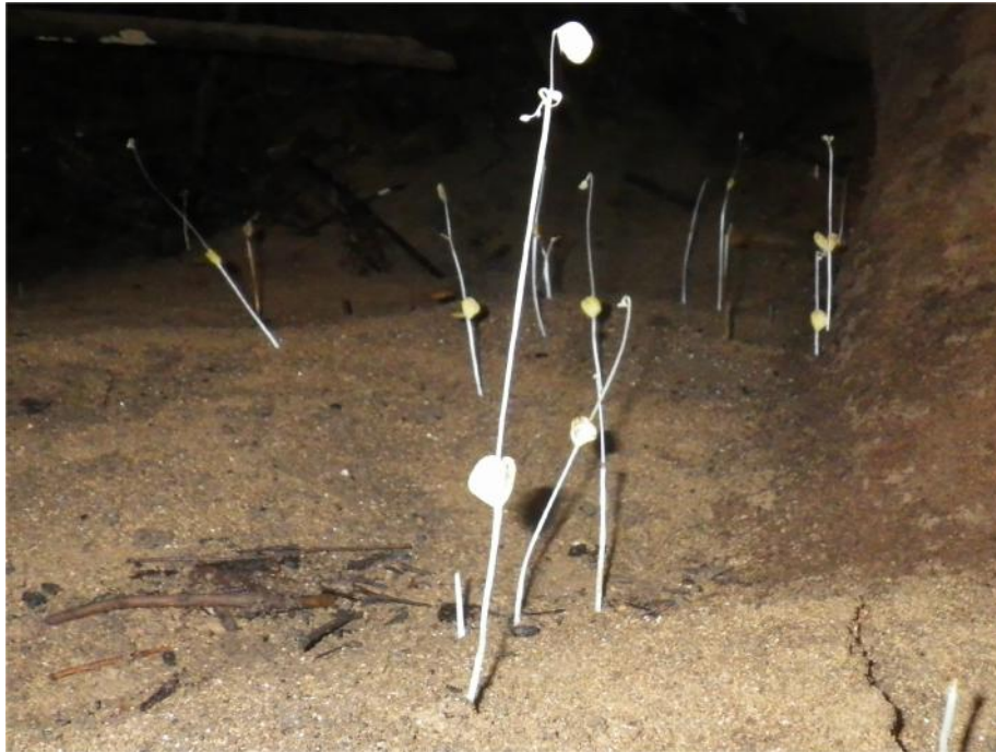
Figure 11: Seedlings of unidentified species found 1 km inside Actun Tunkul