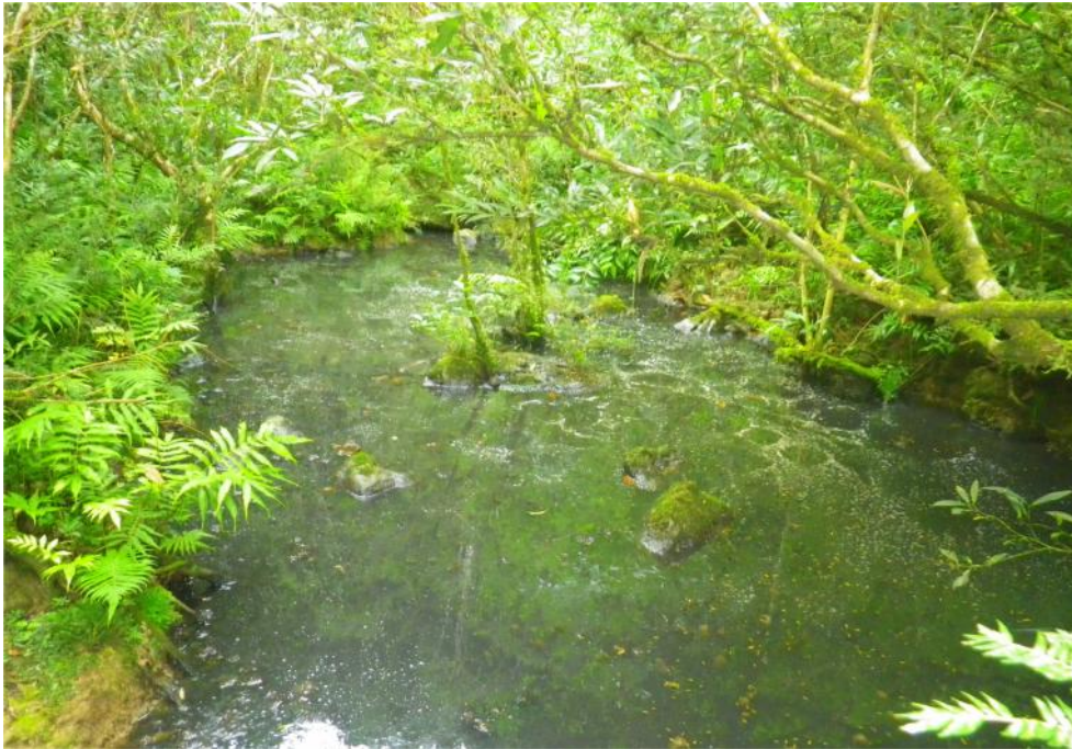
Figure 5: Pool of water found about 70 m away from Tunkul entrance (UTM coordinates: northing:1843368; easting: 277229)