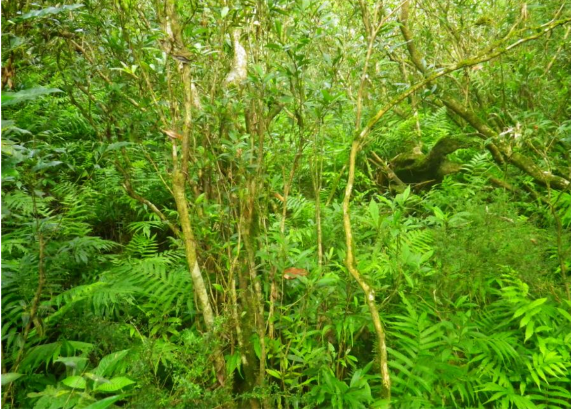
Figure 4: Riparian shrubland found on and along the dry riverbed leading to Tunkul. Note small diameter size and height of trees covered with mosses and an understory of ferns (UTM coordinates: northing: 1843368; easting: 277229)

The only presence of water observed on this river bed was a stagnant pool about 4 m wide, 10 m in length with an average depth of 0.5m (Figure 5) located about 70 meters from the entrance of Tunkul. This pool serves as a major source of water for a wide diversity of terrestrial mammals, especially for the tapir, white-tailed and red-brocket deer; as evidenced by the frequently used network of animal trails leading to the pool (Figure 6).