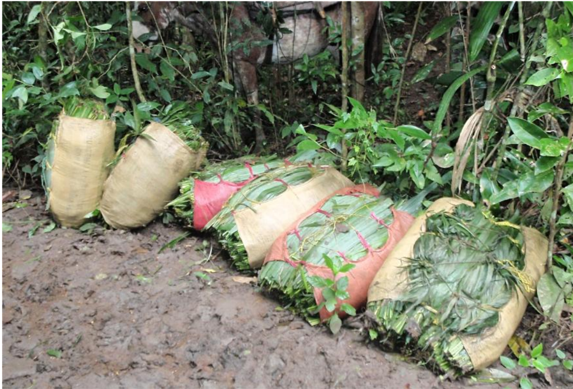
Figure 10: Xaté bundles containing some of the 12,000 Xaté leaves confiscated by Chiquibul Forest Joint Enforcement Unit on November 18, 2011 around Actun Tunkul area (UTM coordinates: northing: 1844767; easting: 279335).

Of special note was the recording of seedlings of unidentified species about 30 cm in height located 1 km inside the cave. All seedlings had a slender, pigmentless and succulent stem with attached cotyledons, in addition to two undeveloped apical leaves (Figure 11). A slightly fossilized bone measuring about 20 cm in length and 4 cm in diameter was recorded located among cobbles on the banks of the cave stream (Figure 12)