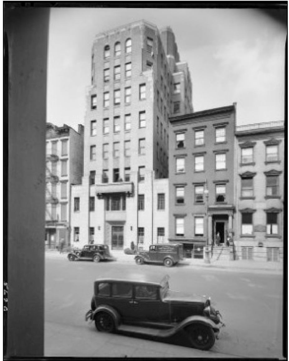
Bialystoker Center and Home for the Aged