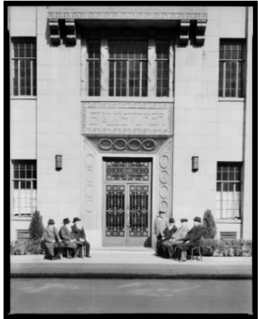
Bialystoker Center and Home for the Aged