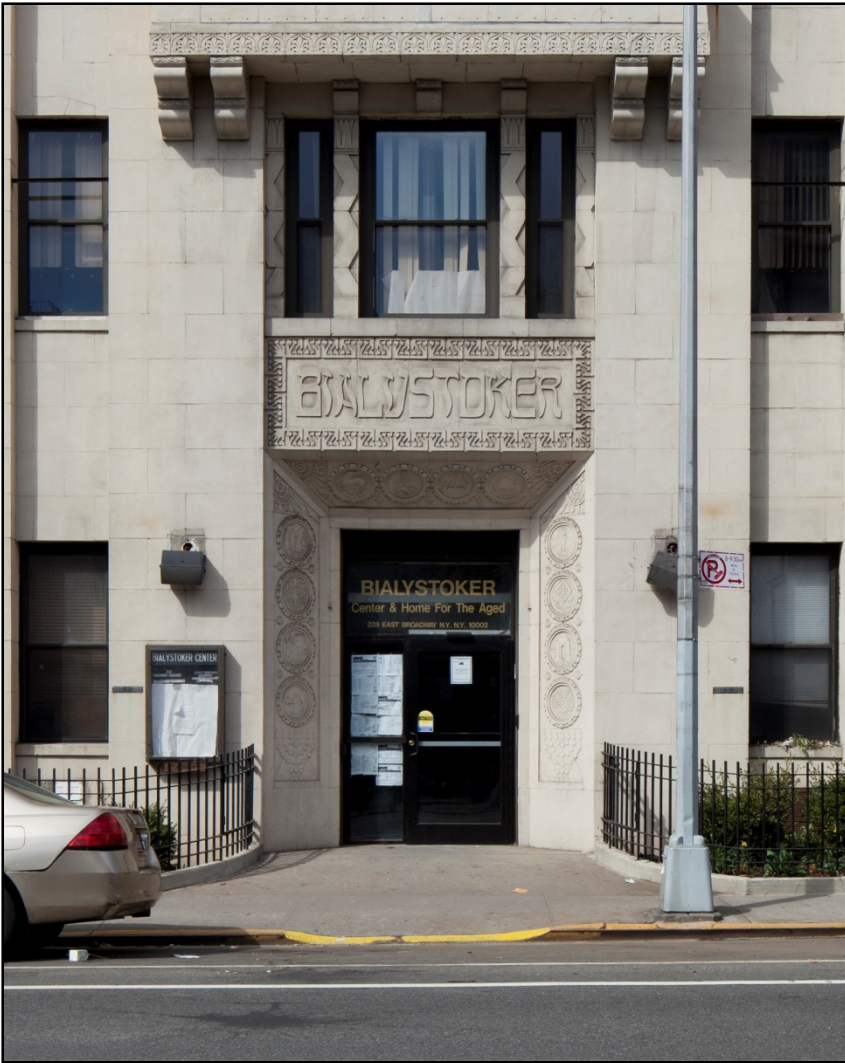
Bialystoker Center and Home for the Aged