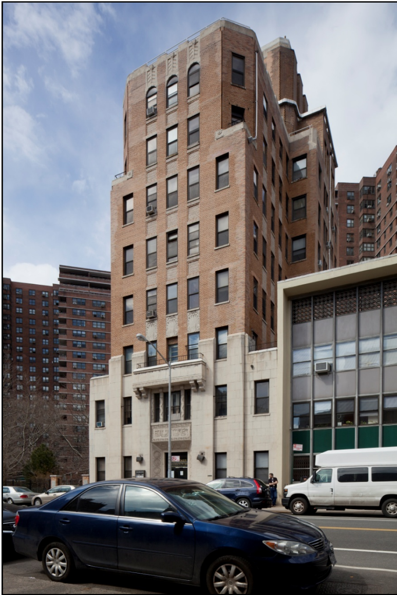
Bialystoker Center and Home for the Aged