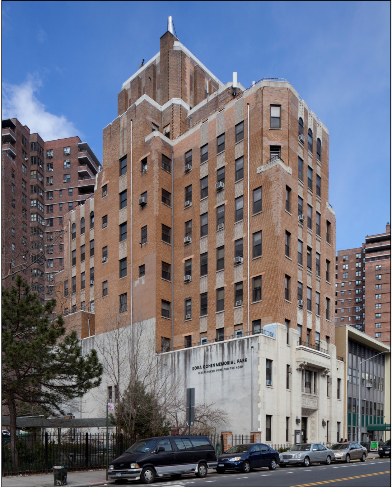
Bialystoker Center and Home for the Aged 228 East Broadway (aka 228-230 East Broadway) Borough of Manhattan Tax Map Block 315 Lot 45 Built: 1929-31; Architect Harry Hurwit