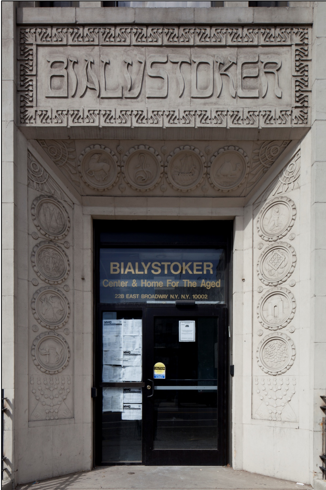
Bialystoker Center and Home for the Aged Entrance enframingent