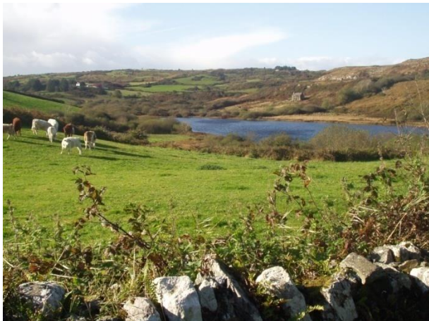
Lake View from Garden