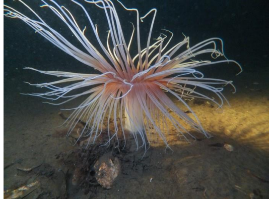
A Loch Fyne fireworks anemone (Owen Paisley)

Snorkelers played a prominent part in Seasearch West Scotland surveys (Owen Paisley)