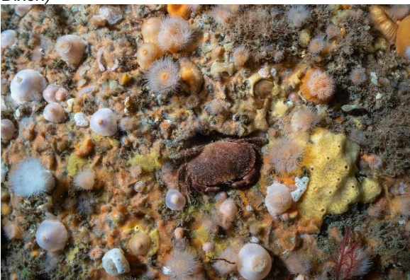
Cave wall community with sponge and cnidarian turf (lain Dixon)