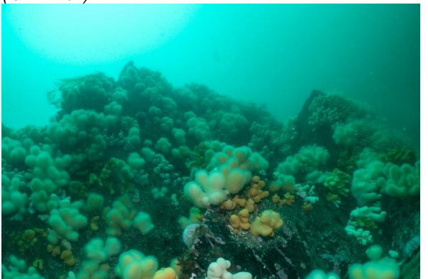
Classic St Abbs area reef scene with dead men's fingers Alcyonium digitatum dominating (lain Dixon)