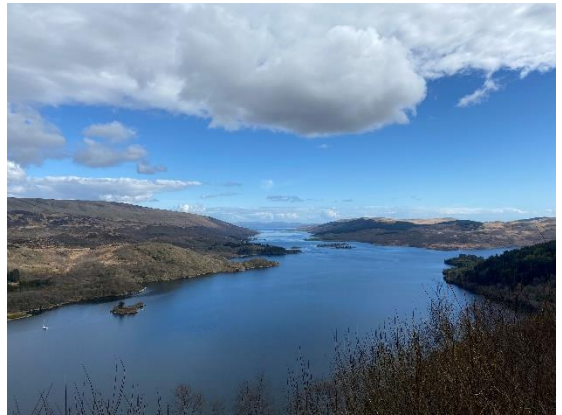
Loch Ruel and Kyles of Bute (lain Dixon)

The diving activities started in Loch Goil, where five very sheltered sites were visited and coffee and cake was consumed at the wonderful Boat Shed café. The forecast was kinder for day 2, and Jason took the Starfish Enterprise around to Tighnabruaich in the Kyles of Bute whilst we drove around to meet him there; here, we dived at two sites, one in Loch Riddon (also known as Loch Ruel) and the other at the Maids of Bute near the gloriously named Buttock Point. Although the weather was good, the visibility was not great. This theme continued on day 3 in the Firth of Clyde, where we dived amongst the pier piles at Inverkip pier and also at the Gantocks reef. Finally, on the fourth day and worsening forecast, Jason took us to the excellent site in Loch Long known as Anemone Gardens, after which the second dive of the day took place at the CD wreck in the Holy Loch (the wreck of a converted fishing trawler named after some of the items that were found there on a recurring basis when first dived. The final day was cancelled due to weather. All in all though, despite the weather and chilly conditions, we all had a great time which culminated in a noisy meal out for the group on the final evening.