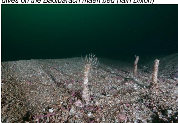
Sediment waves of shelly gravel and maerl with tubes of the polychaete Lanice conchilega, Ardross Rock (lain Dixon)