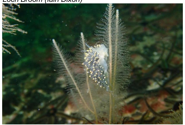
The hydroid Nemertesia antennina with nudibranch Antiopella cristata, Ardross Rock