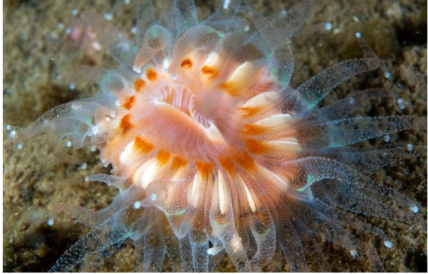
Devonshire cup coral Caryophyllia smithii, Kyles of Bute (lain Dixon)