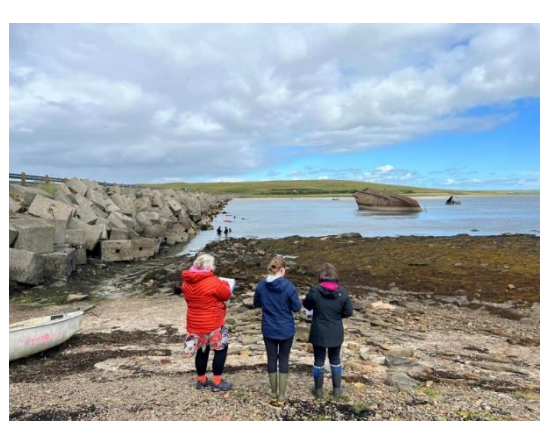
Shore walk survey training, Orkney (Karen Boswarva)