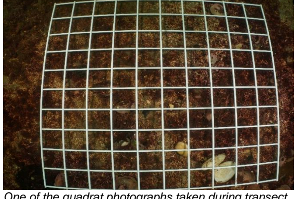
One of the quadrat photographs taken during transect dives on the Badluarach maerl bed (lain Dixon)