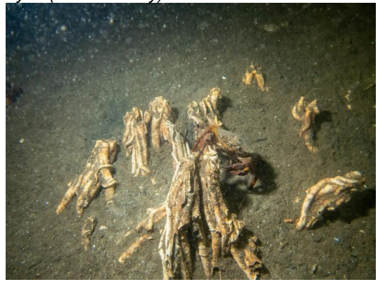
Evidence of past serpulid reefs in West Loch Tarbert (Owen Paisley)

Some of the very large native oysters found in Loch Fyne (Owen Paisley)