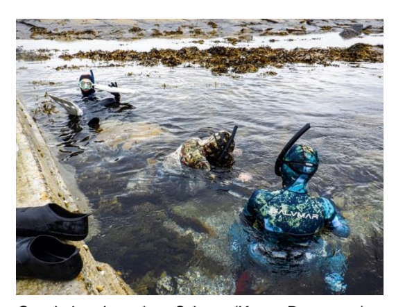
Snorkelers in action, Orkney