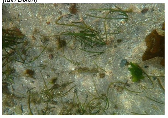
Seagrass plants Zostera marina, by Badluarach Pier (lain Dixon)