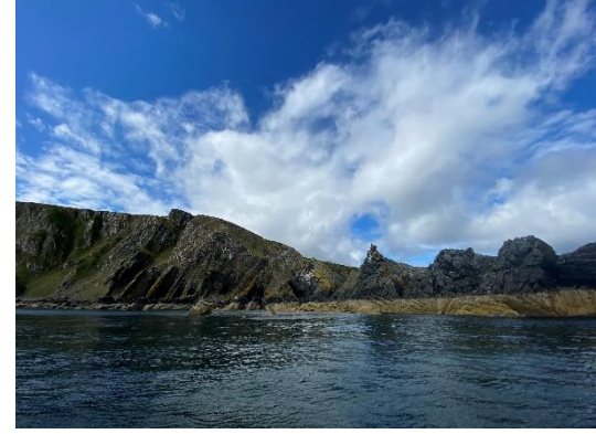
Off Lumsdaine Hurker, north of St Abbs Head