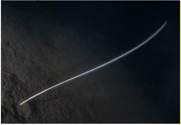
Tall sea-pen Funiculina quadrangularis, inner basin (lain Dixon)