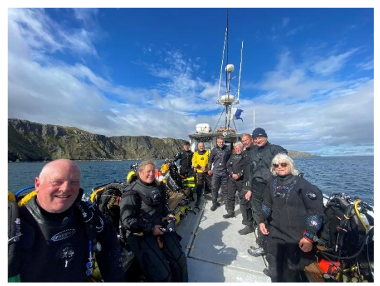
The survey team on Marine Quest Sea Skye, St Abbs

Eight Seasearchers assembled at the Holy Loch marina for diving, fun and recording over the weekend of October 15<sup>th</sup> – 16<sup>th</sup>. Unusually this was at times a little limited by weather - Borne away on Wreckspedition's Starfish Enterprise, the first day's diving was within the Holy Loch, diving on the three landing craft and the wreck of a fishing vessel. On the Sunday, the weather had improved slightly, allowing us to visit the Anemone Gardens site in Loch Long and at the Gantocks reef in the Firth of Clyde.