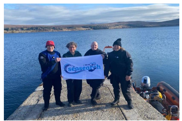
Some of the survey team enjoying the sunshine in Little Loch Broom (lain Dixon)