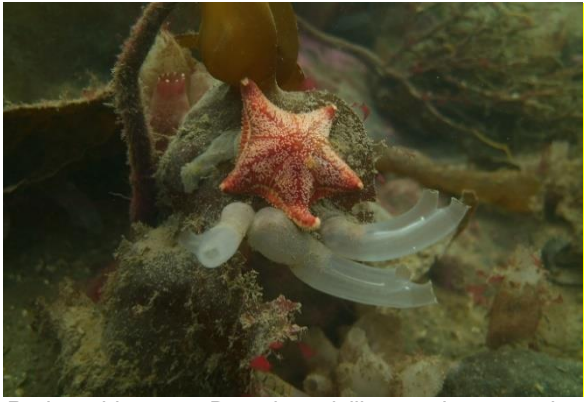
Red cushion star Porania pulvillus and sea squirts Ciona intestinalis, Conger Stack (Sally Walsh)