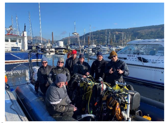
Survey team, Wreckspeditions base, Holy Loch (lain Dixon)