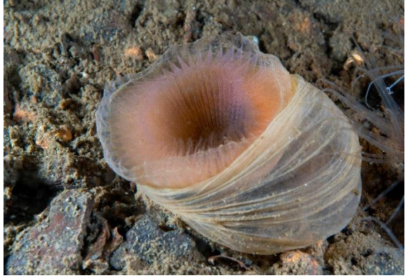
Tube-dwelling polychaete Myxicola sp, Loch Long