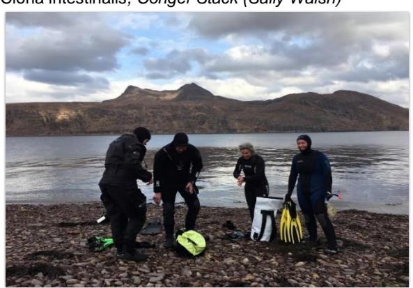
Snorkelers at Durnamuck Garden site (Angeles Fernandez Pena)