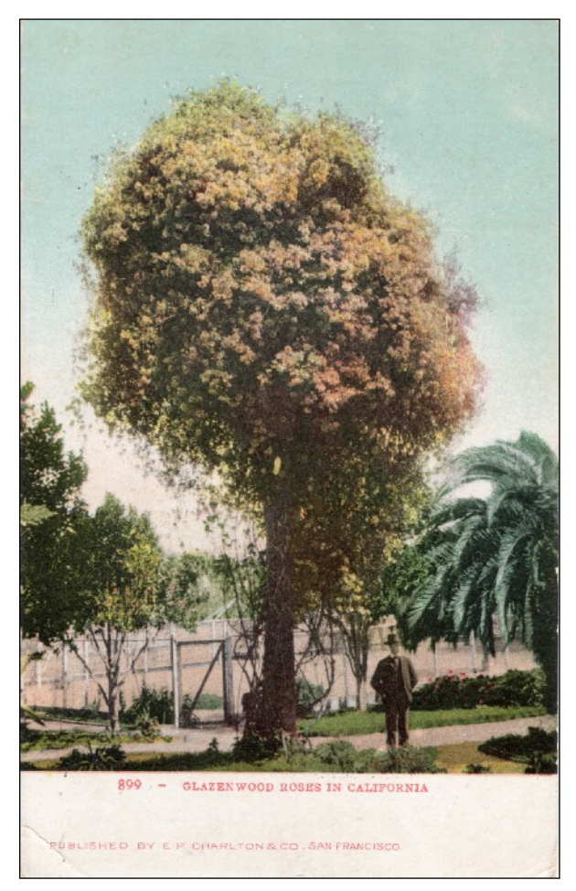
Postcard titled "Glazenwood Roses in California." Published E. P. Charlton & Co, San Francisco, circa 1906.

the Hihn rose tree posed a challenge, even for the expert German printers. Should the overall color be yellow, orange, or pink? As seen in the examples here, all three were used.