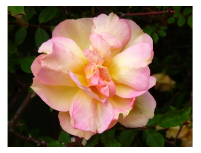
Fortune's Double Yellow (aka Beauty of Glazenwood) growing in the authors' garden in Santa Cruz, April, 2020. The young blossoms are pale yellow with orange towards the center. The petals develop pink edges as they mature. This is why old postcards show varying colors.

In 1875, a Mr. Woodthorpe introduced Beauty of Glazenwood from the Glazenwood Gardens in Essex.<sup>10</sup> It was said to be slightly different from