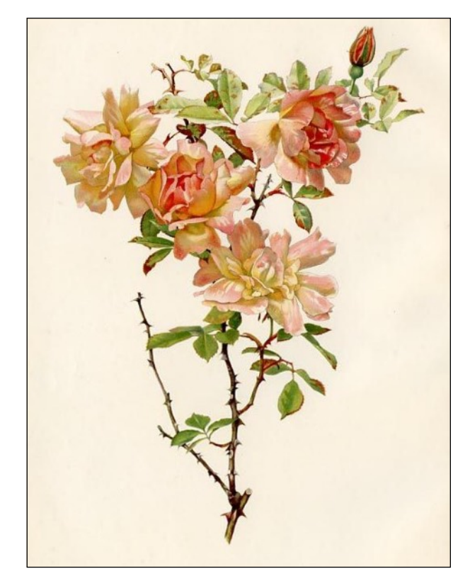
Painting of Fortune's Double Yellow by Alfred Parsons. From The Genus Rosa by Ellen Willmott, 1911.

Note: Readers wishing to see a living example of Fortune's Double Yellow can see one growing on the fence at Santa Clara University (Rose No. SC-33-4). The rose is part of the San Jose Heritage Rose Garden collection. http:// www.heritageroses.us/SCU.php There is also one in Sacramento at the old city cemetery. For a list of nurseries that sell the rose, visit https://www.helpmefind.com/roses/.