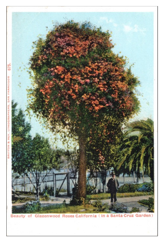
Postcard titled "Beauty of Glazenwood Roses California (in a Santa Cruz Garden)." Britton & Rey, Lithographers, San Francisco, circa 1906.

It can be pruned into a bush, but usually is grown as a climber. Given the opportunity, it can reach heights of at least 50 to 60 feet. It is hardy and fast-growing, covered with blossoms each spring. In Santa Cruz, peak blooming occurs in April. An account from 1905 described it as having "large golden blooms, washed with pink and apricot."<sup>6</sup> While extolled for its beauty, it is beauty with a price. "It is without exception the most cruelly prickly, thorny rose I know—every dainty twig, every shiny leaf being armed with ferocious