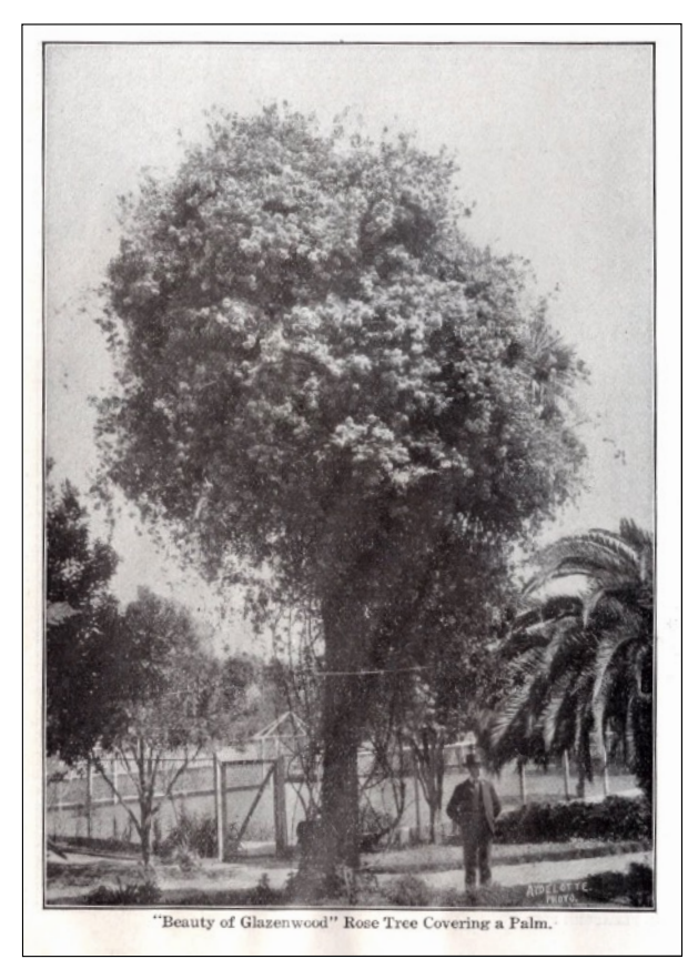
This page from a 1908 promotional booklet is unusual in that it shows the famous photo with the name of the photographer in the lower right.: Aydelotte. Several of Charles L. Aydelotte's Santa Cruz photographs were made into postcards. The postcard lithographers began with his black and white photographs and added colors during the printing process. From, The City of Santa Cruz and Vicinity, California , published by the Santa Cruz Board of Trade, 1908.

The same 1891 Surf article appears to be the first to mention the rose in Santa Cruz: "On Church Street a magnificent sight is the 'Beauty of Glazenwood' rose vine at A. M. Peterson's. The glorious sunset colors of this blossom are absolutely unequalled."