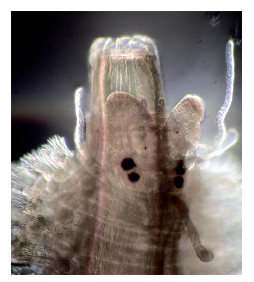
Pionosyllis sp SD2 Anterior dorsal view showing everted proboscis ITP I-7 rep2 2Jan2001 165 ft. RCR - 30May2001

NOTE: Your editor is playing catch up again, so for the next several newsletters the meeting information will be correct, regardless of the labeled date of the newsletter.