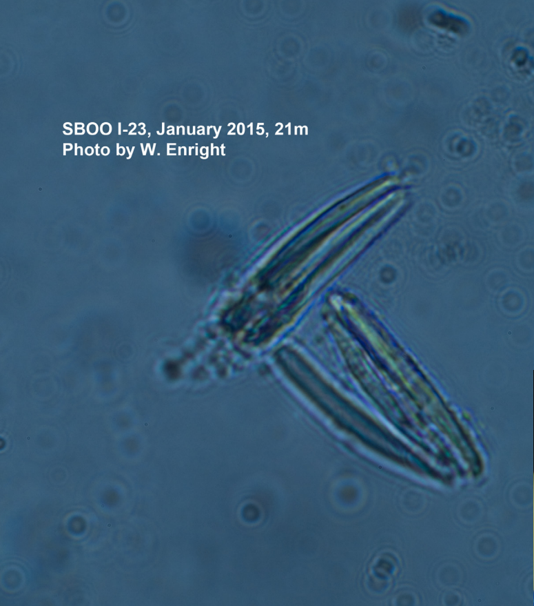
SBOO I-23, January 2015, 21m