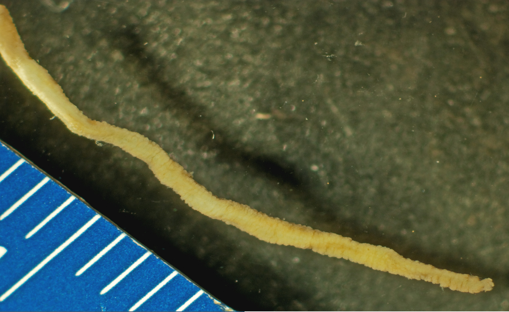
FID Edwardsiidae from station SBOO I-23, January 2015, 21m