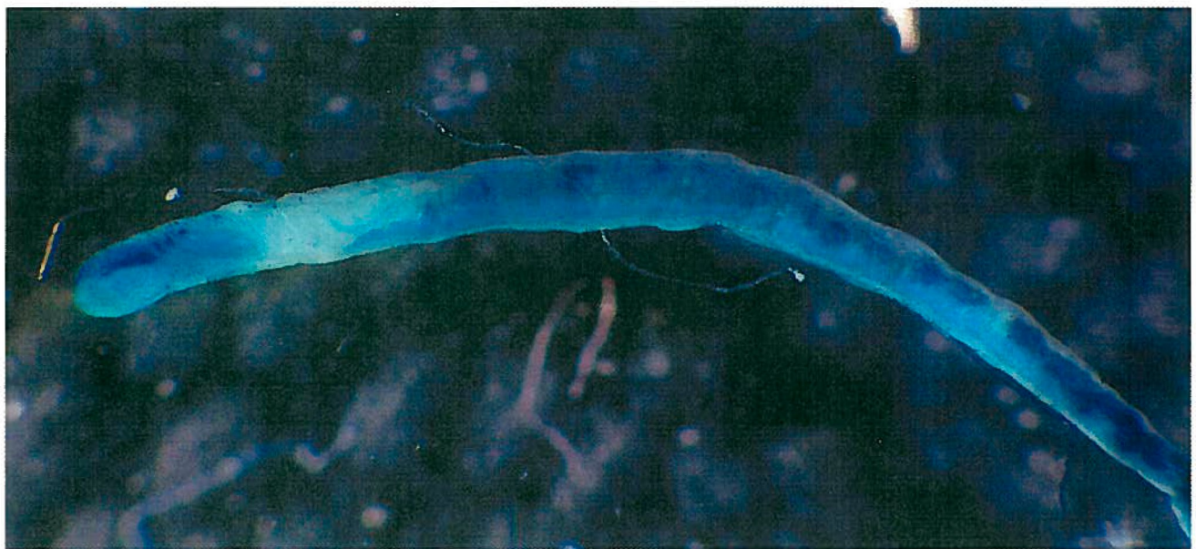
Fig. 11 Myriochele gracilis anterior end, lateral view, stained with methyl green. Sta E9(1), 4/4/2002, 381 ft.