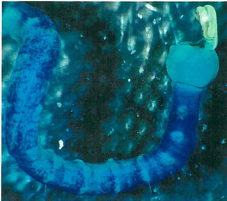
Fig. 7 Myriowenia californiensis , lateral view, stained with methyl green Station data unknown.