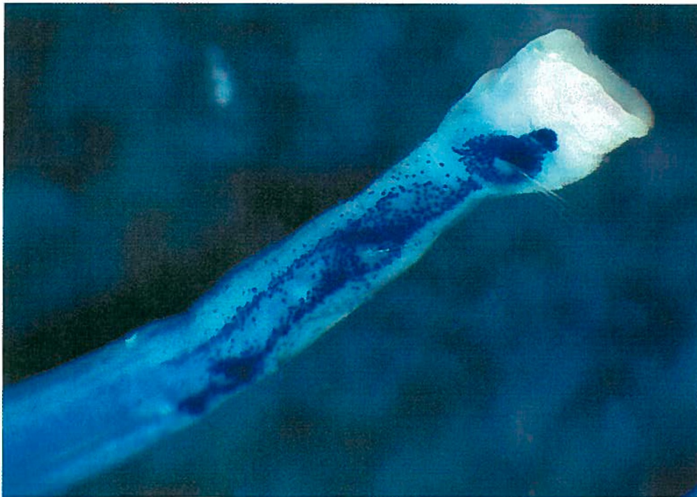
Fig. 9 Galathowenia pygidialis anterior end, lateral view, stained with methyl green. Sta 2691(2), 7/25/2000, 210 ft.