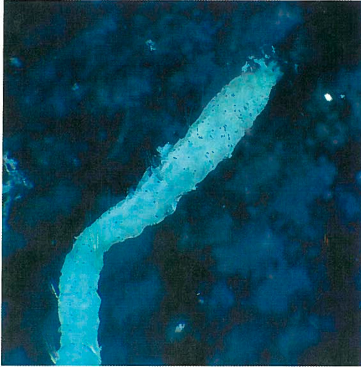
Fig. 8 Galathowenia pygidialis posterior end, stained with methyl green. Sta 2691(2), 7/25/2000, 210 ft.