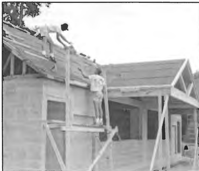
CONCESSION COMPLEX - Workers from the maintenance department at Ouachita are busy building a new concession and restroom complex at A.U. Williams Field this summer. The new facility will complement a new entrance portal to the stadium. Funding for the project was provided by the University and the Tiger Gridiron Club.