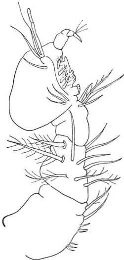
FIG. 3. Danielsenia stefanssoni , Male: Antennule (same scale as Fig. 1G).