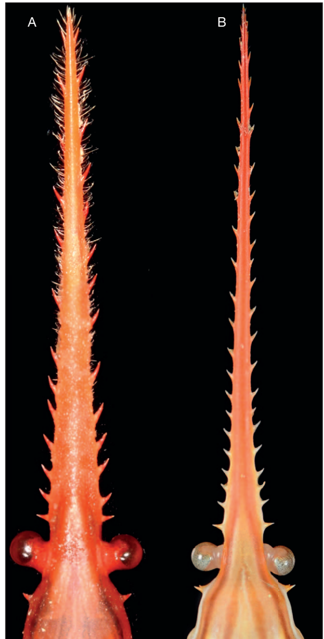
FIG. 4. — Comparison of rostrum in Stenorhynchus Lamarck, 1818 species: A, Stenorhynchus seticornis (Herbst, 1788), rostrum with setae, specimen from Martinique, coll. R. Ferry XI.2015, 10–20 m (University of Fort de France); B, Stenorhynchus yangi Goeke, 1989, rostrum without setae, 1 specimen from Guadeloupe KARUBENTHOS 2012, lot JL314 (no MNHN, photo only), st. GN11, 140 m.

Cancer hispidus Herbst, 1790 (1782–1804): 245 (type locality: not indicated).