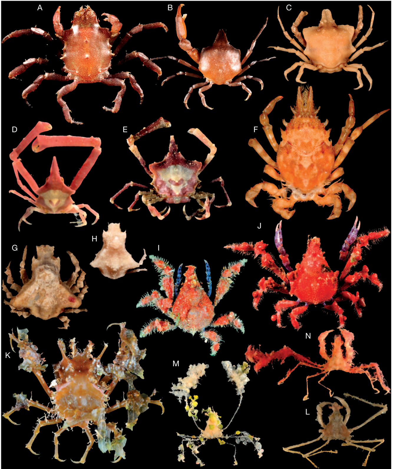
FIG. 2. — Epialtinae MacLeay, 1838: A , Acanthonyx petiverii H. Milne Edwards, 1834, 1 ♂ MNHN-IU-2013-5911, st. GM07, 1 m; B , Epialtus bituberculatus H. Milne Edwards, 1834, 1 ♂ MNHN-IU-2013-5924, st. GM09, 1 m; C , Epialtus dilatatus A. Milne-Edwards, 1878, 1 ♀ with Sacculina 15.0 × 12.4 mm MNHN-IU-2013-6615, st. GM11, 1 m; D , Epialtus longirostris Stimpson, 1860, 1 sp. MNHN-IU-2013-5967, st. GR12, 21 m; E , Epialtus portoricensis Rathbun, 1923, 1 ♀ MNHN-IU-2013-4207, st. GR14, 27 m. Pisinae Dana, 1851: F , Chorinus heros (Herbst, 1790), 1 ♂ MNHN-IU-2013-6783, st. GM22, 1 m; G , Microliassa bicarinata (Aurivillius, 1889), 1 ♂, MNHN-IU-2013-4446 (lot JL1425-5), st. GB32, 4 m; H , Microliassa brasiliensis (Rathbun, 1924), 1 ♀ MNHN-IU-2013-13093, st. GD69, 60 m; I , Pelia mutica (Gibbes, 1850), 1 ♀ ov. MNHN-IU-2013-5663, st. GB36, 16 m; J , Pelia rotunda A. Milne-Edwards, 1875, 1 ♂ MNHN-IU-2013-4876, st. GR11, 13 m. Tychinae Dana, 1851: K , Tyche emarginata White, 1847, 1 ♂ MNHN-IU-2013-4614, st. GS39, 16 m. Inachidae MacLeay, 1838. L , Coryrhynchus algicola Stebbing, 1914, 1 ♂ MNHN-IU-2013-4066, st. GR27, 8 m; M , Coryrhynchus riisei (Stimpson, 1860), 1 ♀ juv. MNHN-IU-2013-5917, st. GR29, 20 m; N , Coryrhynchus sidneyi (Rathbun, 1924) 1 ♂ MNHN-IU-2013-5968, st. GR12, 21 m.