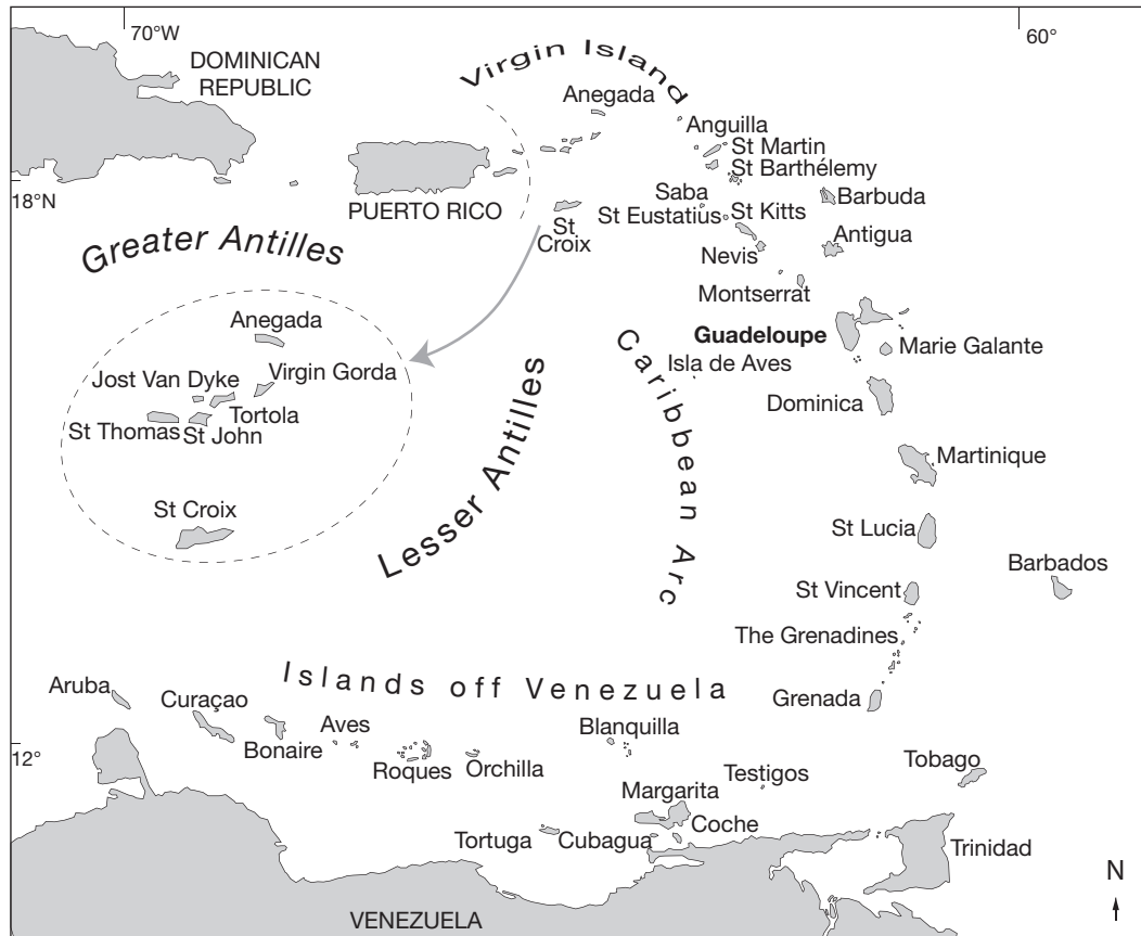
FIG. 1. — Lesser Antilles region with situation of Guadeloupe Island. Three main archipelagoes are distinguished: Virgin Islands (VI, from St Thomas to Anegada), Islands of the Caribbean Arc (ICA, from Anguilla, Saba to Tobago, Trinidad) and Islands off Venezuela (IOV, from Testigos to Aruba).