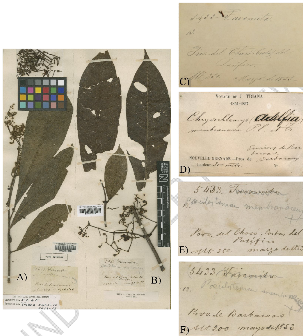
FIGURE 1. Chrysochlamys membranacea original material. A) Triana , 5433-12 (Lectotype) and B) Triana , 5433-13 in BM herbarium. C) Labels notes with Triana calligraphy in Triana , 5433-13 COL herbarium. D) Labels notes with Triana calligraphy in Triana , 5433-12 P herbarium. E) Labels notes with Triana calligraphy in Triana , 5433-13 BM herbarium. F) Labels notes with Triana calligraphy in Triana , 5433-13 BM herbarium (Lectotype).

locality cited in the protologue ( Triana 5433-12 ), is designated as a lectotype in accordance with ICN Art. 9.3, Art. 9.6, Art. 9.14 and following the 9A recommendation [21].