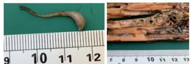
Fig. 5 Bactronophorus sp. (left image: body morphology; right image: Tunnel in log) [15]

The body of Bactronophorus sp. tubular, its body length reaches 4 cm, pale white. The body can be elongated or shortened. The wider anterior end is closed, has a rounded end. From there, the tube tapers to the open posterior end, by the central septum. The siphon projects through this end to feed and breathe. They can be pulled into the tube and ends can be sealed with a set of pallets. The mollusk's two tiny valves are inside the tube along with the mantle, intestines, and other soft organs. Inside this mollusk wood also forms a circular tunnel in its cross-section and is coated with calcareous material produced by the mollusk (Figure 5). The larger species of sea woodwork, which also lives in dead mangrove trunks, is often called "Tembelo" by the people of Eastern Indonesia and can be consumed.