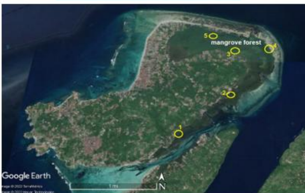
Fig. 1 Maps (Google Earth) showing sampling stations at five locations in the mangrove forest at Nusa Lembongan