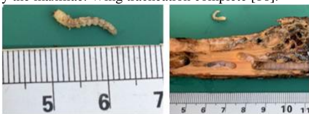
Fig. 3 Cenoloba sp. (larvae phase) [15]

Larvae: Larvae eruciform, peripneustic, frequently with 8 pairs of limbs. All larvae of moths and butterflies (Lepidoptera) have proles on their abdomen. These legs are tipped with hooks, the crochet (Figure 3). Pupae usually adecticous and more or less object, and generally enclosed in a cocoon or an earthen cell; a few primitive forms are decticous and exarate. Adult: Insects with 2 pairs of membranous wings; cross-veins few. The body, wings and appendages were clothed with broad scales. Mandibles are almost always vestigial or absent, and the principal mouth parts generally represented by a suctorial proboscis formed by the maxillae. Wing tracheation complete [16].