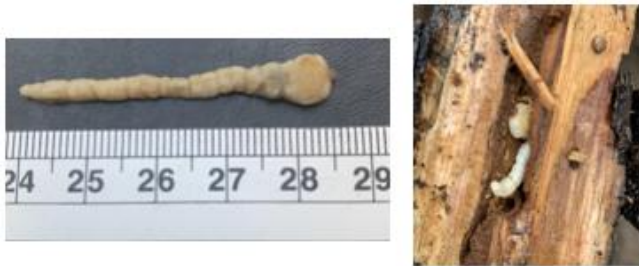
Fig. 2 Phaenops sp. (larvae phase); image on the left: larval morphology; on the right: larvae in the wood core hole [15]

larvae will continue to consume wood, which is the brand's only food source. Inside the wood, the larvae become safe, continue to dig for food for several years. Adult: the adult phase is a flat-headed wood-borer, a distinctive oval body shape, small antennae. Its body size is relatively small to relatively large, which is between 6–64 mm. Adult Buprestidae are called metallic wood-borers because they are iridescent or metallic looking underneath and sometimes on top. Adult beetles will lay their eggs in cracks in wooden objects, floorboards and timbers [29-31].