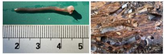
Fig. 4 Bankia sp. (left image: body morphology; right image: circular tunnel in dead wood) [15]

the mollusk's wood it forms a circular tunnel in cross-section and is lined with a calcareous material extruded by the mollusk (Figure 4).