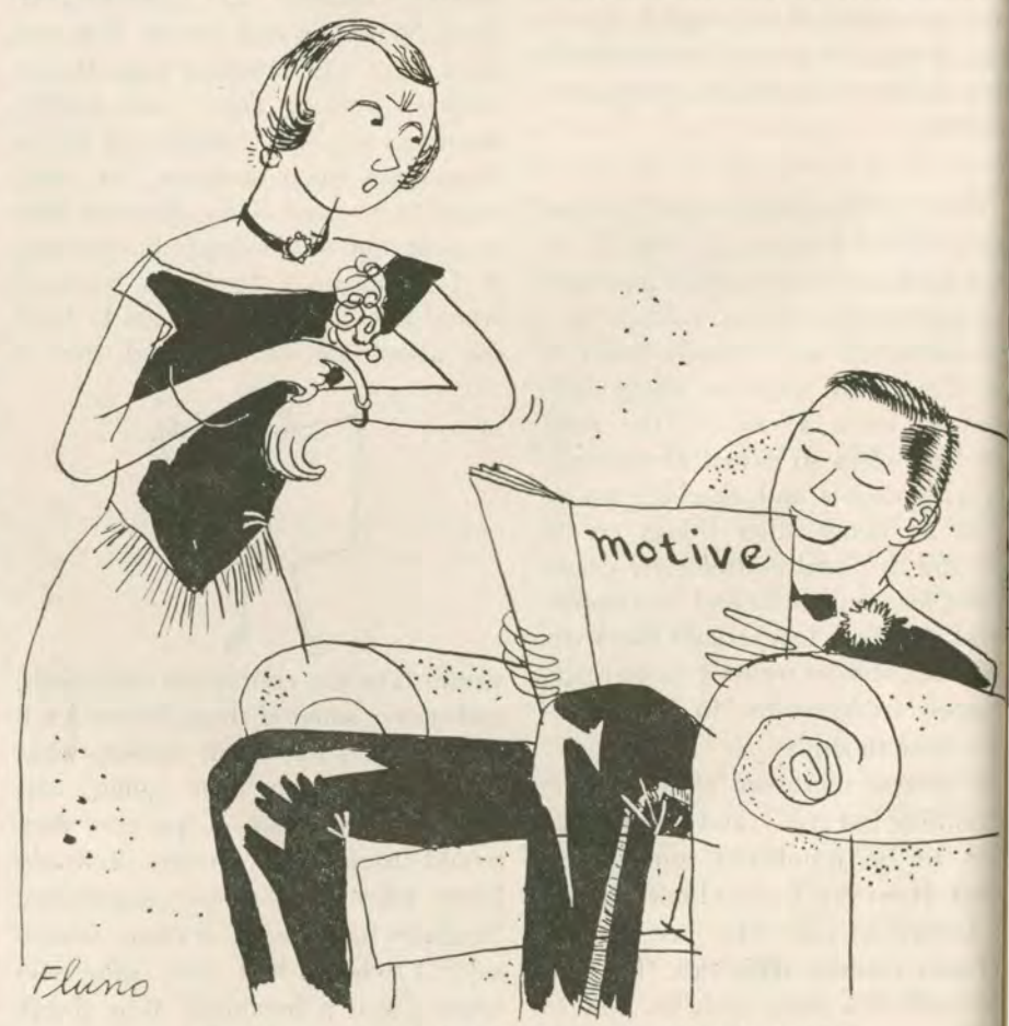
"Just a minute, honey, while I finish reading this motive article."

Deception, wild parties, snobbis ness, and the like, so often linked