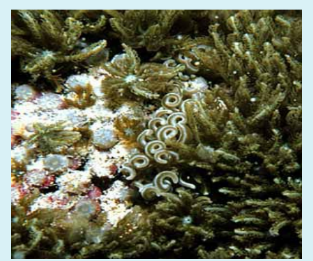
Fig.3 Two P.colemani on their food source