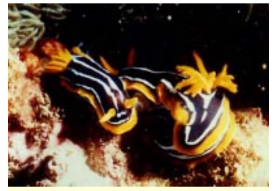
Chromodoris kuiteri Rudman, 1982 This species is known from northern NSW, Queensland and Western Australia. It possibly extends into the tropical western Pacific. I have photos of it from the Great Barrier Reef. It is common on the Sunshine Coast's offshore reefs and is easy to spot with the black and yellow body and four usually unbroken narrow, blue longitudinal lines.

Maximum size appears to be 70mm with the average being 40-60mm. This species is predominately sub-tidal, rarely found intertidally. The average depth is 8-20m with 30m the deepest limit.