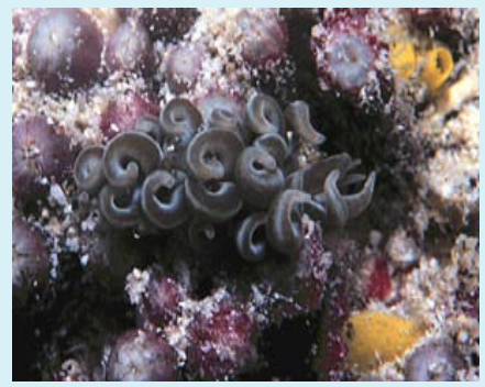
Fig.4 P.colemani on algae