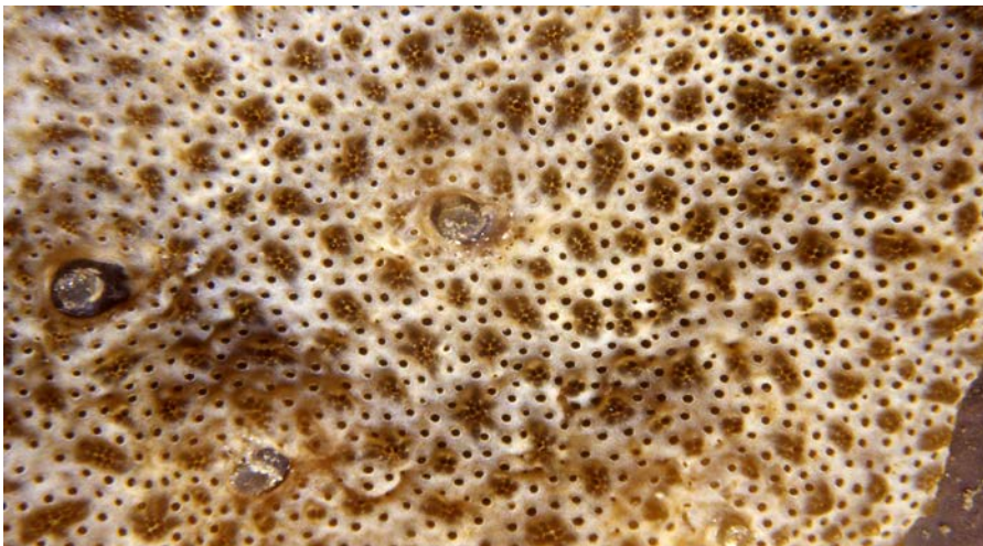
Eudistoma maculosum - close up of colony (Southern NSW)