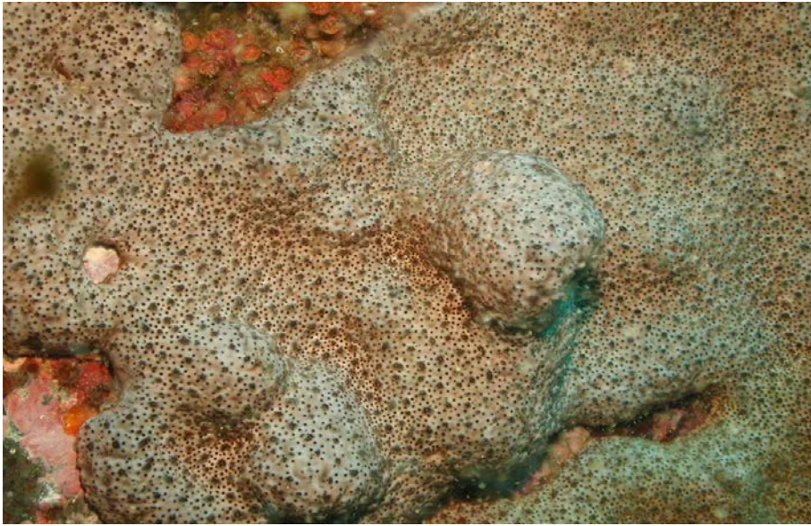
Eudistoma maculosum (Southern NSW)