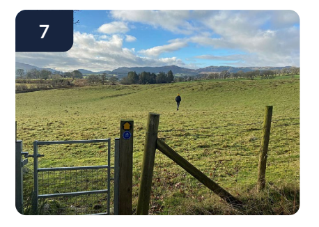
When you reach the southern tip of the young woodland, follow the public footpath to the right. The path will take you past the northern side of the site of an old Roman fort, Caer Gai, and then along a track towards Weirglodd Wen farm. The track will fork near Weirglodd Wen – follow the track to the right past the front of the farm.