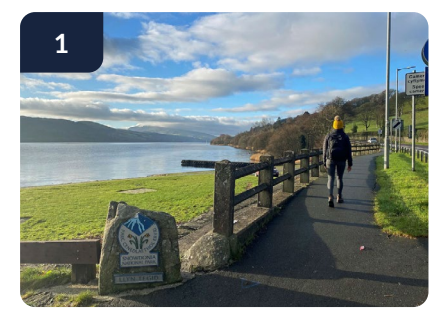
Go to the left from the Llyn Tegid foreshore car park and walk along the pavement, past Fron Feuno car park in Llanycil, until you see the driveway to Fron Feuno farm on the opposite side of the road.