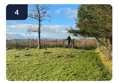
Cross the open heathland, aiming toward the left of the trees. After passing the trees, follow the path along the edge of the field until you reach a country road.

Follow the path across the field, and straight through Plas Moel y Garnedd Caravan Park, until you reach a stile. Go over the stile and across the field, heading for Moel y Garnedd Uchaf farm. The public footpath leads to the right and around the farm. Once you have gone past the farm, follow the public footpath signs that lead you towards Ty'n y Rhos. From Ty'n y Rhos, follow the signs that direct you over the Gwastadros open country.