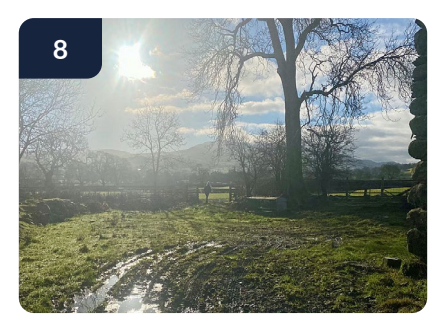
From Weirglodd Wen, follow the path until you join a country road on a sharp corner. Follow the road to the right and past Weirglodd Ddu.