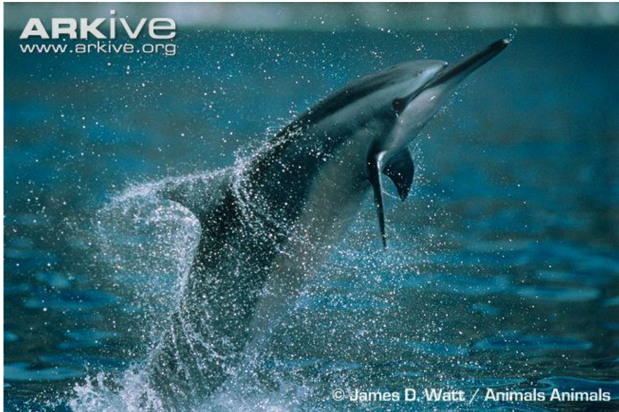
Fig. 1. Spinner dolphin, Stenella longirostris .