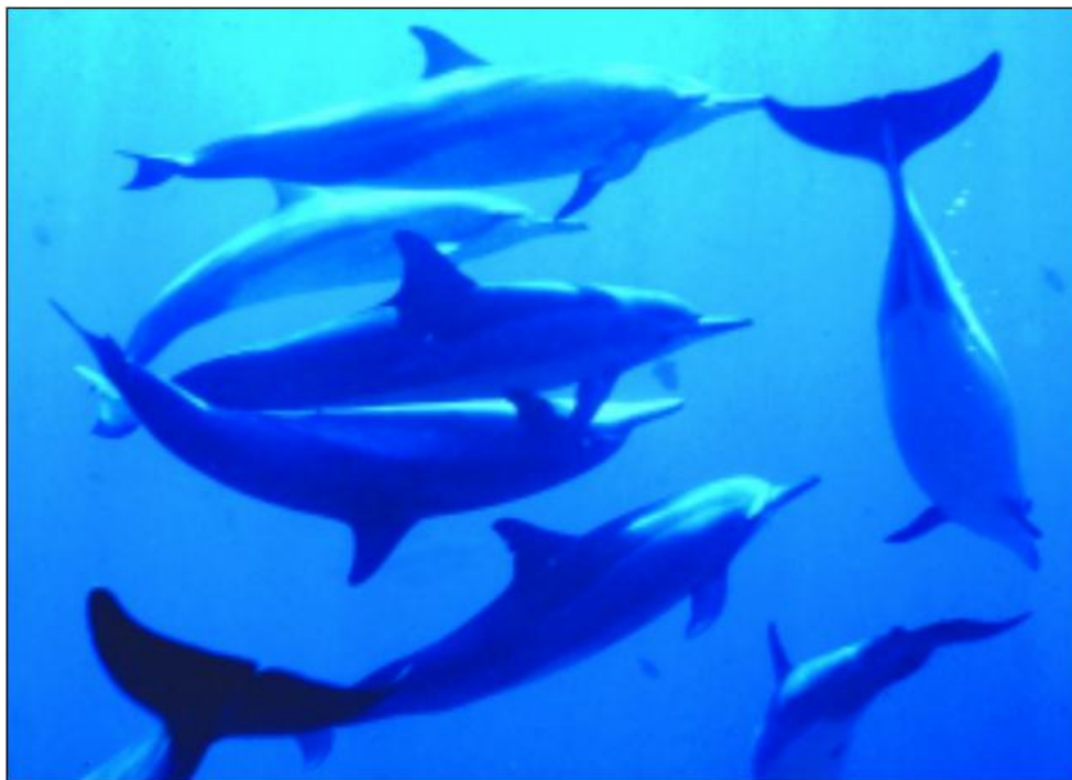
Fig. 5. Mating group of spinner dolphins. Several males surround a copulating female and male (upside down). [From Silva et al., 2005]