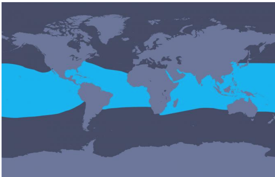
Fig. 3. Distribution of Stenella longirostris (blue) across the four subspecies.

[ http://namu-the-orca.deviantart.com/art/The-spinner-dolphins-259047360 downloaded 2 October 2015]