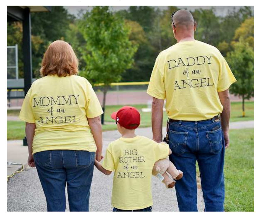
Families share their grief, and their joy.

Meanwhile, take a look at the photos from last year below.