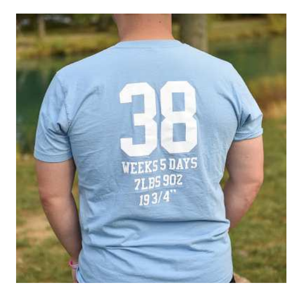
The families make their own T-shirts, honoring their babies.