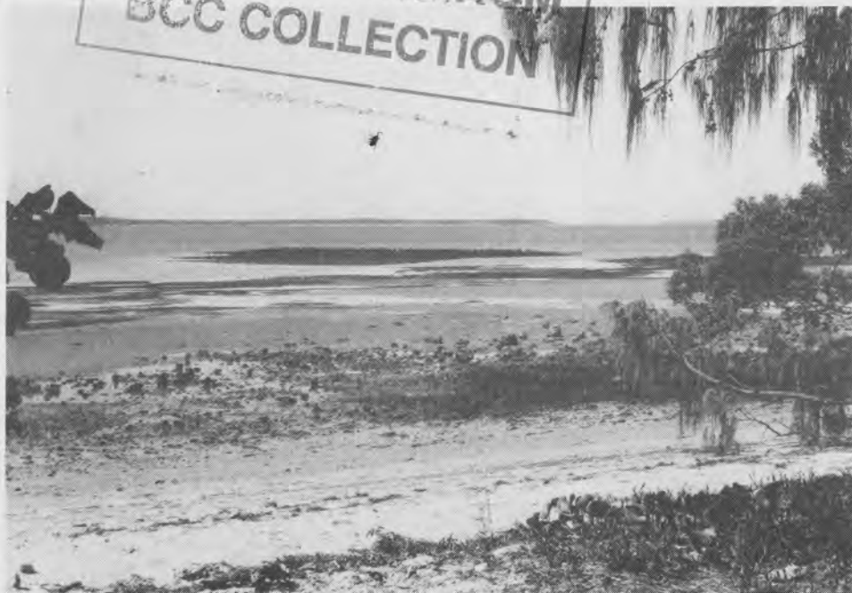
The Zones of Life: The view from Morwong Beach on Coochiemudlo Island, looking north to Peel Island, on the horizon.

This low-tide vista shows the well-marked zonation which characterizes the estuarine islands of Moreton Bay. In the foreground are the grasses, 'Portulacca' and succulent vines ('Ipomoea pes-caprae') which bind and stabilize the sand.