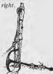
January 1993.

Below that are the broad exposed sandbanks, their surface broken twice daily by the regiments of soldier crabs which loyally plough and harrow the surface. A small 'island' of beachrock, a marker of the inter-tidal zone from former millennia, is at centre in the middle distance. A Sheoak ('Casuarina') frames the picture at right, with the leaves of a Cottontree ('Hibiscus tiliaceus') at left.