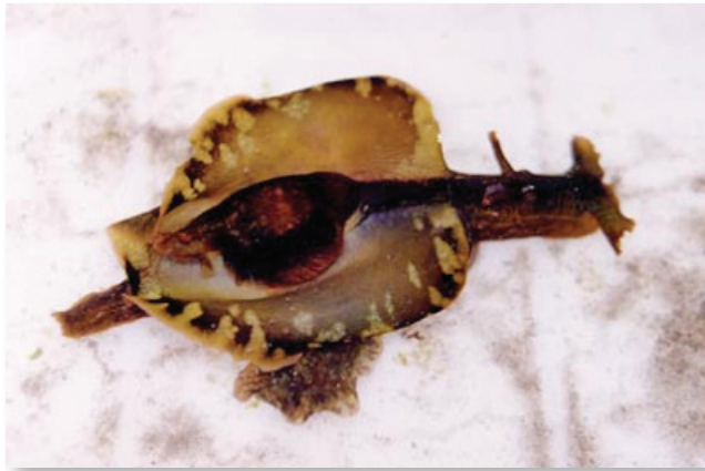
Fig. 7: Seaslug Aplysia dactylomela of Santa Catarina State.