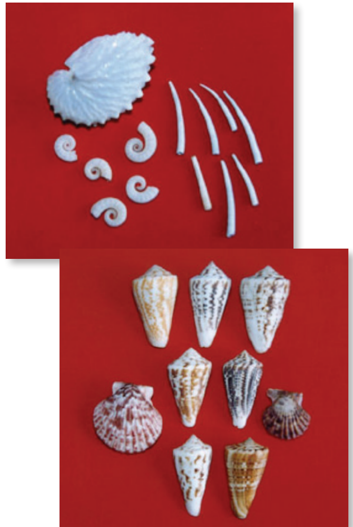
Fig. 1: Some native marine shells of Santa Catarina State.

Based in our technical reports already published or in editorial process (Agudo & Saalfeld 2003, 2004; Agudo & Bleicker 2005 a-d, 2006 a-b, 2008 a-d; Agudo-Padrón et al 2007), a comprehensive synthesis of the general revision on the recent marine mollusks that happen in the geographical territory of Santa Catarina's State, SC (Fig. 1) is presented to proceed, product of twelve year-old exhaustive regional researches (between 1996 and 2008), understanding checklist of 608 known and reported species and subspecies, among them 10 POLYPLACOPHORA, 356 GASTROPODA, 223 BIVALVIA, 10 SCAPHOPODA, and 9 CEPHALOPODA, systematically distributed in 308 genus, 137 families and 5 classes, established until the month of March 2008, with base in wide bibliographical revision starting from the historical contributions of MORRETES (1949), GOFFERJÉ in BIGARELLA (1949) and MORRETES (1953), and the exam of copies deposited in Brazilian institutional and private collections, as well as of specimens obtained during field collections and/or for the road of sporadic donations.