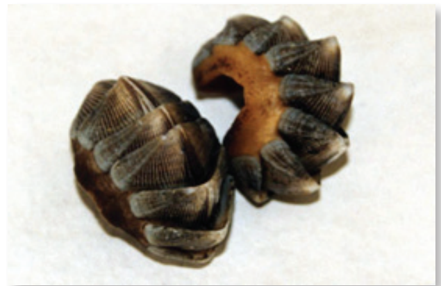
Fig. 3: Common chiton Chaetopleura angulata (Splengler, 1797) of Santa Catarina State.