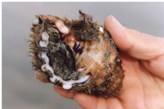
Fig. 4: Cymatium cingulatum (Gmelin, 1791), severe maricultural pest in Santa Catarina State.

Cymatium parthenopeum parthenopeum (von Salis, 1793) Linatella (= Cymatium ) caudata (= cingulatum ) (Gmelin, 1791) (Fig. 4)