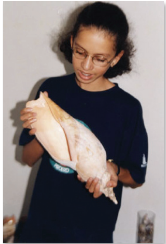
Fig. 5: Adelomelon beckii (Broderip, 1836) of Santa Catarina State, one of the largest gastropods of South America.

Zidona dufresnei (Donovan, 1823) Zidona dufresneyi distincta (Lahille, 1895) Adelomelon ancilla (Lightfoot, 1786) Adelomelon beckii (Broderip, 1836) (Fig. 5)