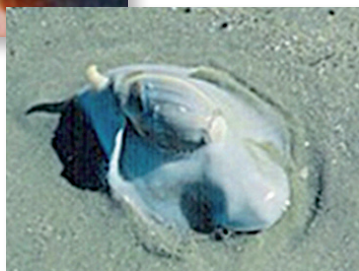
Fig. 6: Olivancillaria vesica auricularia (Lamarck, 1810), common species in sandy beaches of Santa Catarina State.

Ancilla dimidiata (Sowerby, 1850) Olivella nivea (Gmelin, 1791) Olivella petiolita (Duclos, 1835) Olivella defiorei Klappenbach, 1964 Olivella minuta (Link, 1807) Olivella orejasmirandai Klappenbach, 1986 Olivella puelcha (Duclos, 1840) Olivella formicacorsii Klappenbach, 1962 Olivella sp. Agaronia travassosi Morretes, 1938 Amalda josecarlosi Pastorino, 2003