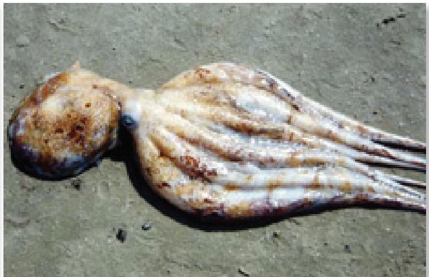
Fig. 11: Common octopus, Octopus vulgaris Cuvier, 1797, of Santa Catarina State.