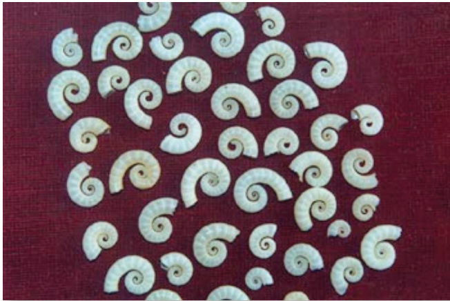
Fig. 10: Internal shells of Spirula spirula Lamarck, 1801 collected in beaches of Santa Catarina State.