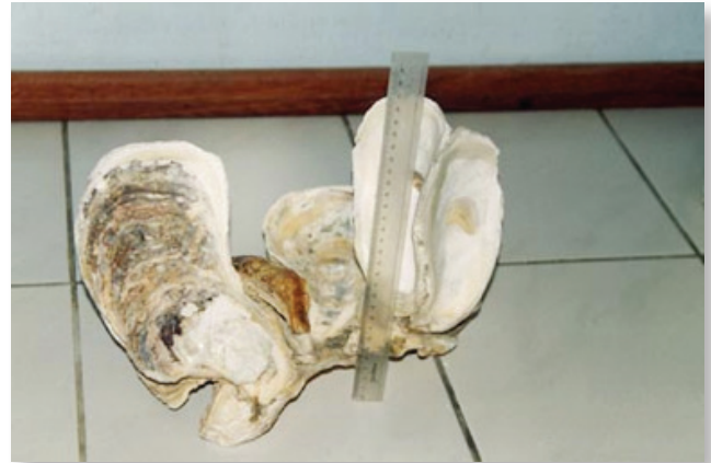
Fig. 8: Shells of giant estuarine native oysters Crassostrea cf. brasiliiana Lamarck, 1819 of Santa Catarina State.

Ostrea cristata Born, 1778 Ostreola (= Ostrea) equestris (Say, 1834) Ostrea puelchana d'Orbigny, 1841 Crassostrea gigas (Thunberg, 1795) Crassostrea rhizophorae (Guilding, 1828) Crassostrea brasiliiana Lamarck, 1819 (Fig. 8)