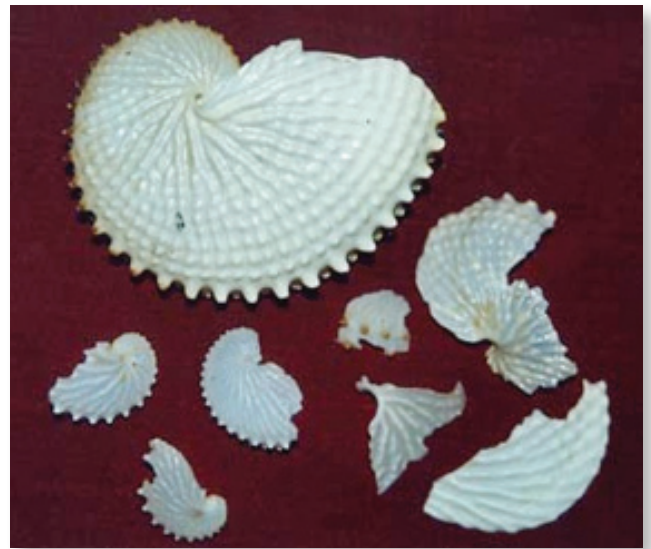
Fig. 12: Shells of Argonauta nodosa Lightfoot, 1786 collected in beaches of Santa Catarina State (Photo: Agudo-Padrón).

Argonauta nodosa Lightfoot, 1786 (Fig. 12)