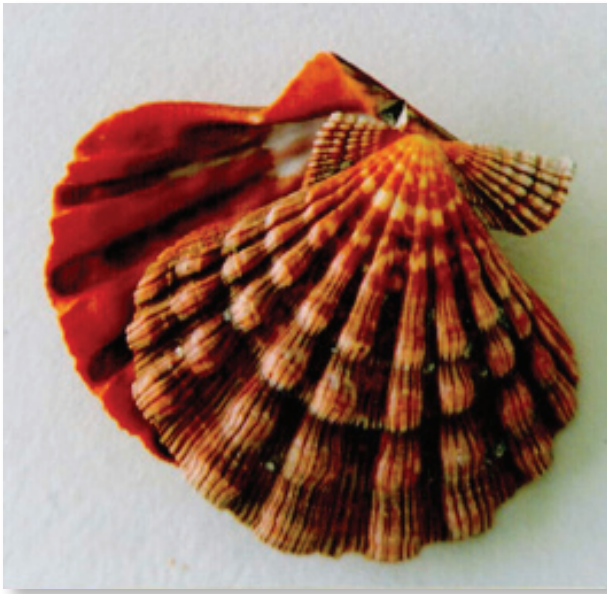
Fig. 9: Native scallop Nodipecten nodosus (Linnaeus, 1758) of Santa Catarina State.

Euvola (= Pecten ) ziczac (Linnaeus, 1758)