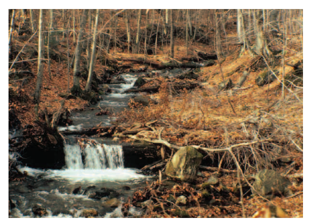
The health of downstream reaches is only as good as the protection afforded to headwater streams.

Headwater streams, beginning as spring seeps and first-order stream channels in a steam and river network, have an immediate and intimate connection with the terrestrial environment, forming an extensive terrestrial/aquatic mosaic. However, the very attributes of headwaters that make them critical to the health of stream networks also make them exceedingly vulnerable to degradation when landscapes are altered. Because small streams are so integrated into landscapes, they are most at risk as landscapes are urbanized, and because of their small size, the impacts of the degradation of a single headwater stream on larger downstream reaches are difficult to observe or quantify. The small size of watersheds that can support both permanent and intermittent headwater streams, referenced above, contrasts sharply with the waiver in Pennsylvania for the