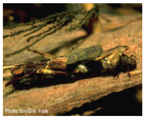
Aquatic insects like this larval Pynopsyche (caddisfly), an important member of the food web, are far more abundant in streams than commonly realized. A stream reach one meter wide and 100 meters long may have 1.5 million macroinvertebrates.

Aquatic macroinvertebrates (primarily aquatic insects) are the dominant animals in temperate streams and rivers, including headwater streams and their adjoining wetlands. White Clay Creek supports a diversity and abundance of aquatic insect species that typifies the assemblages of the highest-quality streams in the region. The first study of White Clay Creek at the Stroud Water Research Center demonstrated that aquatic insects clearly play a major role in the structure and function of headwater streams. They consume algae and leaves in streams, thus converting plant matter to animal tissue that is available to predators such as fish or riparian birds. Their importance to energy flow is illustrated by the fact that, although the small headwater streams contained hundreds of species, the annual biomass production of just a few species is enough to support, in theory, the annual production of all the fish in the stream. Moreover, the organic byproducts from insects feeding, growing, and dying are washed