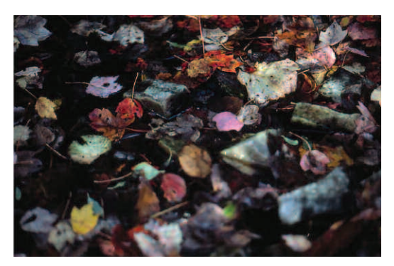
Headwaters supply organic matter, like this leaf litter, that contributes to the growth and productivity of higher organisms — including insects and fish.

including trees, understory shrubs, and herbaceous vegetation. Measurements of the production of organic energy (algal photosynthesis) and its consumption (algal and bacterial respiration) in first-order streams complement our findings that headwaters have high levels of organic inputs (Bott et al. 1976, Appendix, Table 1) and further substantiate the importance of small 0- to first-order streams to the flow of energy within a drainage network. Respiration of the streambed community is driven by a combination of energy derived from primary production by algae as well as a subsidy of organic matter entering from the terrestrial environment, such as leaf litter (Bott et al. 1985). In fact, estimates of litter inputs to the first-order stream are approximately eightfold greater than rates of