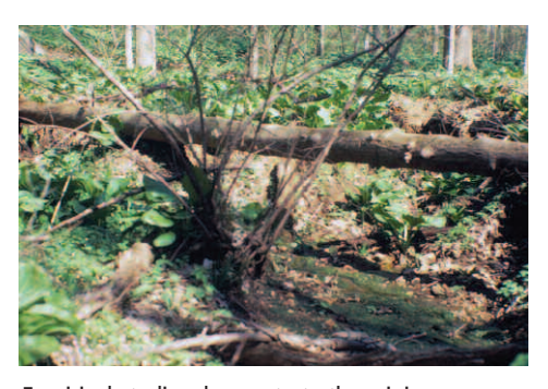
Empirical studies demonstrate the minimum drainage area (watershed) that can support a headwater stream ranges from 5.5 acres - 37 acres. Twelve acres is the drainage area likely to support a perennial stream.

A more general theoretical approach to identify the drainage basin size that would support a flow large enough for a perennial stream uses a calculation based on regional estimates of groundwater yield. The average annual baseflow yield in the upper East Branch of the White Clay is 12.5 inches (0.318 m) per year or 0.1 L / s / hectare. For Chester County, the average annual baseflow runoff is similar at 13.5 inches per year. Flows in small perennial streams vary seasonally but average annual baseflows are in the range of 1.0 L / s. Thus we