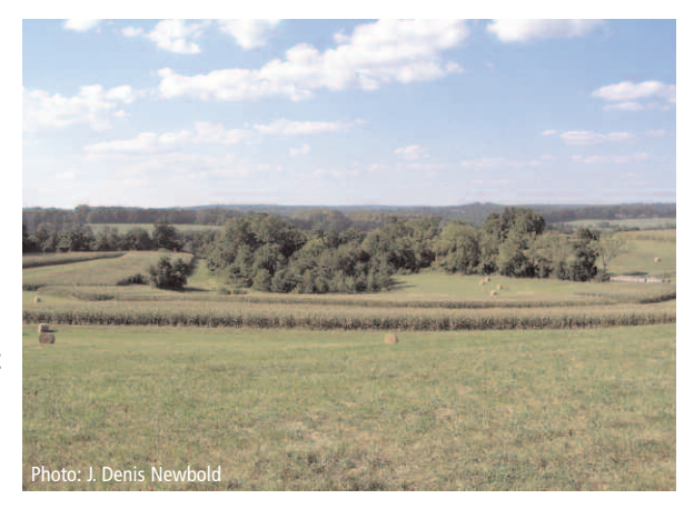
A streamside forest like this protects headwaters from adjacent land use.

It has been known for some time that some of the excess sediment, nutrients, and other pollutants associated with human land use can be kept out of small streams by the presence of a riparian forest or "buffer" zone along its length (see earlier reviews by Newbold et al. 1980, Lowrance et al. 1984, Peterjohn and Correll 1984). The magnitude of the in-stream benefits provided by streamside trees extends beyond pollutant control. These benefits include maintaining temperature control, providing food resources and habitat for aquatic organisms, promoting broad, shallow streams that possess a greater total area of aquatic habitat and a broader diversity of habitats, and assisting in bank stabilization. Unfortunately, a focus on the importance of the riparian area to intercepting pollutants, combined with existing political, social, and even aesthetic ideas, gradually led