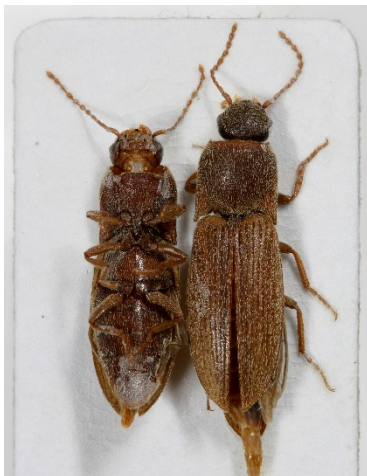
Figure 2. Close up of adult A. obscurus beetle.

Wireworms, the larvae stage of the click beetle, are soil dwelling and feed on underground plant parts. The larvae can range in size from 13 to 37 mm (Jones & Jones, 1984). They have an elongated cylindrical body and have a yellow to yellow-brownish coloured exoskeleton. The head capsule of the wire worm has large dark coloured jaws and the last body segment is shaped like tongs or a cone (Jones & Jones 1984, Nilsson 1972).