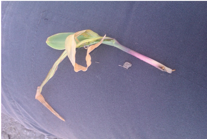
Figure 4. Maize plant damage by wireworm.

Wireworm damage can be seen from germination until eight-leaf stage (Taupin 2007, referred in Saussure et.al. 2015). Larvae attack germinating seeds, stem base and young roots of maize (Figure 4). Damage made by wireworms can lead to growth reduction of plants, abnormal tillering and discolouration of leaves. In severe attacks damage can cause death of maize plant which lead to total yield loss (Chaton et al. 2003, Larroudé unpublished data, referred in Sausseure et.al. 2015). In fields, damage can be seen in patches (Erichsen 1944, refered in Sausseure et.al 2015) which can be explained by the population distribution of wire worms in the landscape which also appears in patches (Blackshaw & Vernon 2008, Benefer et al. 2010, Burgio et al. 2012). Crop loss due to wireworms can be severe. In North America 100% crop loss has been reported (La Gasa et al. 2006) and in Germany up to 90% in fields with severe infestation (Hurle 2005, referred in Andersson 2008).