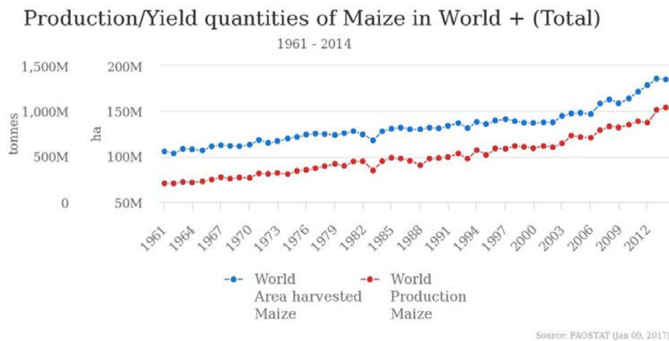
Figure 1. World maize production from 1961 to 2014.

Maize is one of the most cultivated crops in the world and since 1992 production has doubled, in 2014 total harvested area of maize was 185 million hectare and total production was of 1,038 million tonnes in the world (Figure 1) (FAO 2016). In Sweden, maize is a relatively new crop with specific records of maize from the Swedish board of agriculture dating back to 2007. Its production has also been increasing from 10850 hectares in 2007 to 16977 hectares in 2015, almost 60 % (SCB 2016). With this increasing cultivation of maize, where the crop appears more continuously in the crop rotation, there is also the possibility of yield reductions due to increase of pests (Fogelfors 2015).