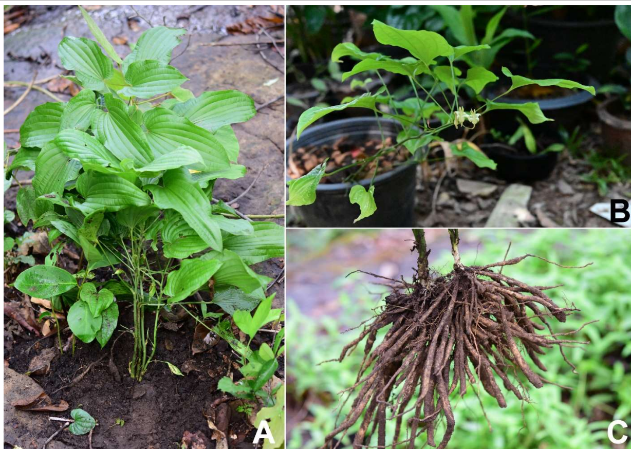
Fig 1. Stemona namkhunensis Chatan & Promprom sp. nov. A. Habits and Habit in the field, B. Habit in the author's home garden, C. Roots. Photos by: Wilawan Promprom.

including erect and glabrous herb, alternate leaves, long tepal (more than 15 mm long), inner tepals larger than outer tepals, and the absence of thecal appendage.