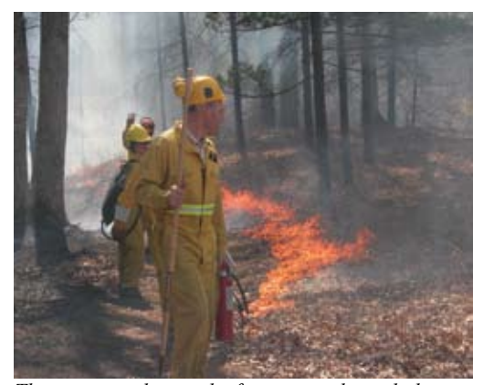
The crew watches as the fire creeps through the understory of the White Oak Woodland. Lowintensity oak woodland fires consume only leaves and small plants, while leaving the larger trees unharmed.