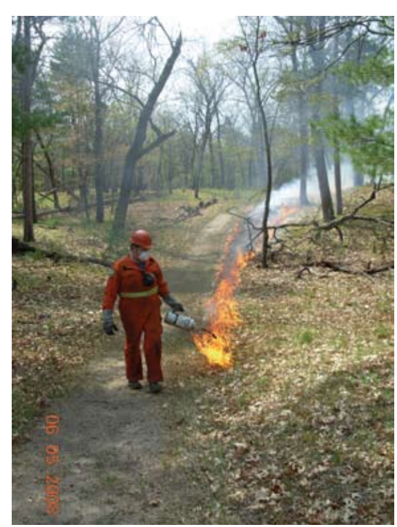
Ignition at Pinery Provincial Park