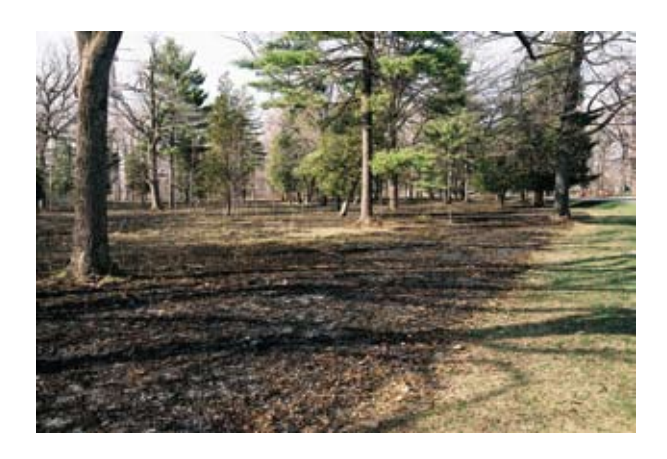
The 2008 PB on the Chinquapin Oak Savannah one hour after the burn.