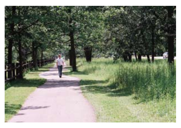
Visitor enjoying the Chinquapin Oak Savannah along the Niagara River Recreational Trail

With project partners Pheasants Forever, Land Care Niagara and the Rural Lambton Stewardship Network, we decided that our next step for ridding the naturalized prairie of invasives would be to plant a cover crop of soybeans this summer which would