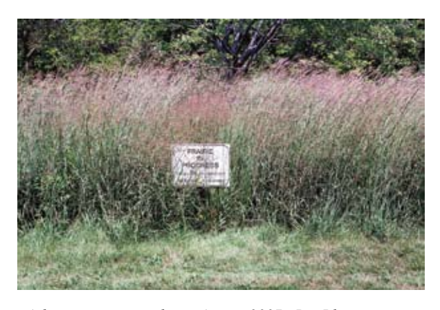
Arboretum prairie plot in August. 2007. Big Bluestem grew to heights over 8 feet.