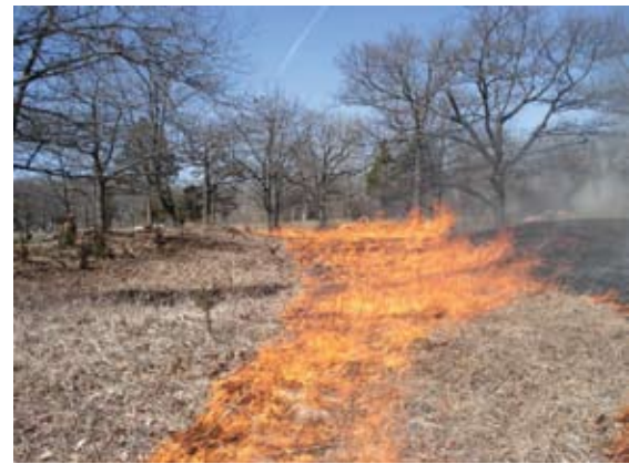
Prescribed Burn in the campground at Pinery Provincial Park