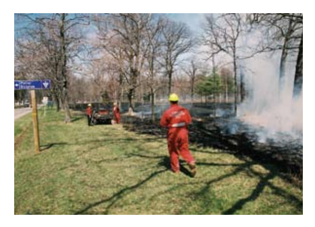
Paradise Grove Black Oak Savannah PB on 17.April.2008. Average age of the oaks is 200-250 years, with several individual trees estimated to be about 400 years old