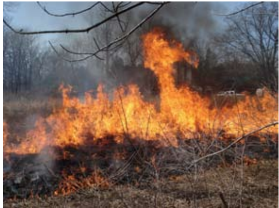
Prescribed Burn at Rondeau Provincial Park