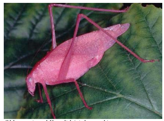
Oblong-winged Katydid (pink morph) Amblycorypha oblongifolia