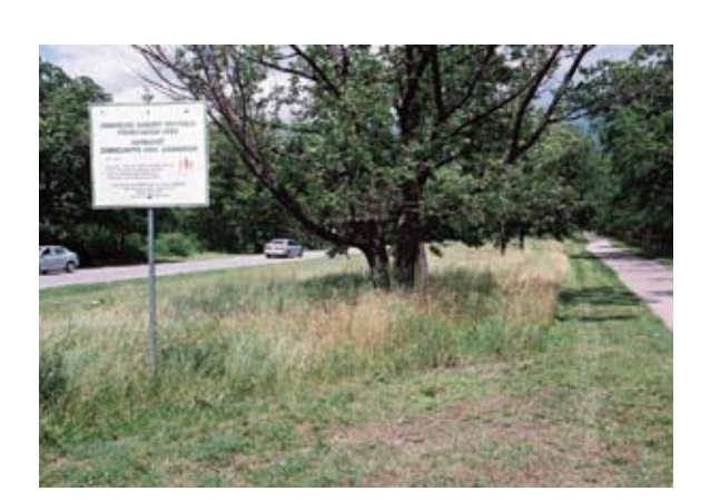
Part of the Chinquapin Oak Savannah burn site about three months post-burn. This site will be spectacular with asters and goldenrod through late summer and autumn 2008.