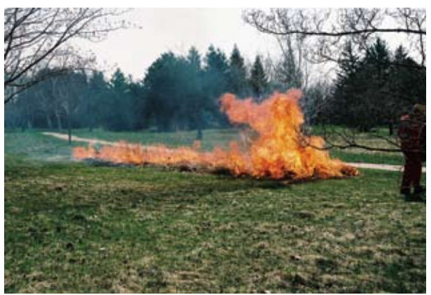
Arboretum prairie plot on burn day 17.April.2008. Fuel load from 2007 plant residue created a "flash-in-the-pan" burn that lasted less than 10 minutes.