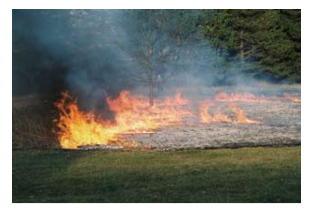
The 2008 PB near the Centennial Lilac Garden site. The Red Oak surrounded by flames is about 15 years old and survived the burn with only a few of the lower branches affected detrimentally

The care we took of our little prairie garden really started it all. Niagara Parks has a prairie plot – about 900 square feet – situated in our Arboretum at the Niagara Parks Botanical Gardens and School of Horticulture. Started as a student project in 1995, we became interested in seeing what would happen if we could enhance it through a Prescribed Burn (PB). Thus,