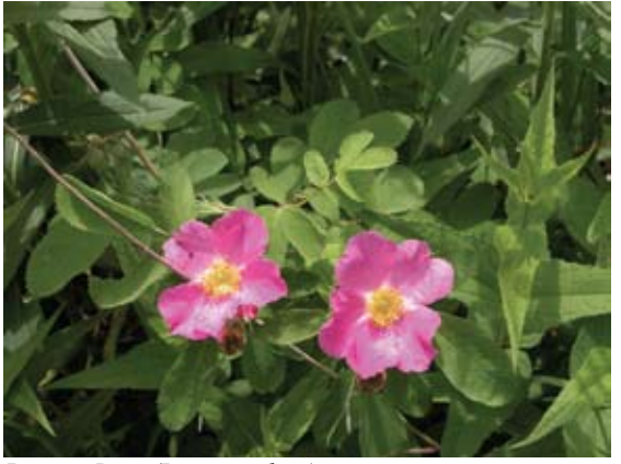
Pasture Rose (Rosa carolina)

Pasture Rose is found in most municipalities adjacent to lower Lake Huron, the north shore of Lake Erie, western Lake Ontario as well as Prince Edward County and slightly downstream in the first stretch of the St. Lawrence River. It is typically found in prairies and pastures as well as dry sandy roadsides and along the forest edge. Pasture Rose is easily identified as a low