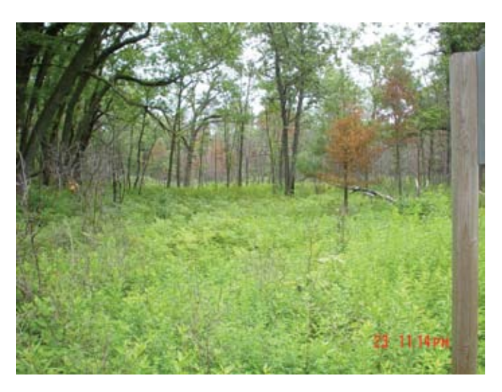
Top: Turkey Point Provincial park right after prescribed burn and during following summer (bottom)