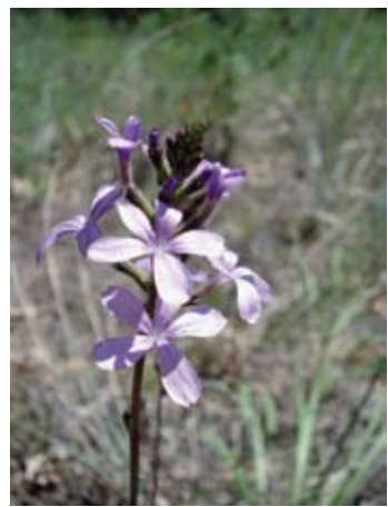
Bluehearts flowering at Pinery