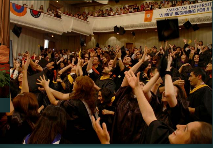
Graduates throwing their caps in the air

The Commencement ceremony started with the ceremonial procession of the class of 2012, the President of AUA, the Deans of the Colleges and the faculty, followed by the anthems of the Republic of Armenia and the United States of America.