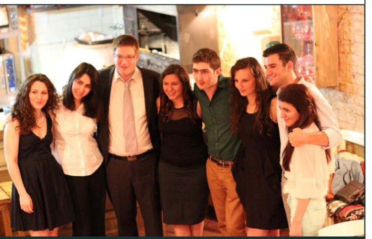
Participants of the 2012 AGBU Moscow Summer Internship Program

The program also includes sightseeing trips, visits to museums and an unforgettable trip to St. Petersburg, the cultural capital of the Russian Federation.