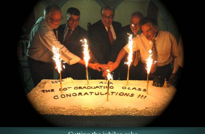
Cutting the jubilee cake

by throwing their caps in the air. Warm words of congratulations were exchanged during an open reception that followed. The graduation ceremony was followed by the traditional Alumni Dinner, which brought together 300 graduates, faculty and staff to celebrate American University of Armenia's Class of 2012.