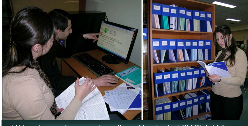
AUA graduate students accessing online and in print the ACM Digital Library, which is sponsored annually by the AGBU Young Professionals

Advancing the educational and research efforts of AUA graduate students and faculty, the ACM Digital Library is the ultimate resource to the computing industry, providing a vast collection