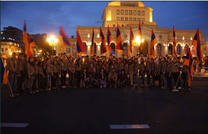
Scouts participated in the RA National Symbols Day

For the second year in a row members of the AGBU Yerevan Scout movement headed by the Scout Council also participated in the jubilee events. Respect and honor towards the state symbols is part of the scout ideology and is instilled in them from early childhood. As Armenians and as scouts the members of the AGBU scout movement acknowledge the importance of state symbols and are honored to be part of the celebrations of the Day.