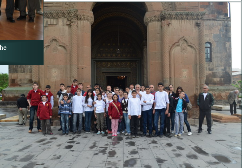
Chess tournament participants in Etchmiadzin

Since it began in 2008, the Interschool Tournament, which is an initiative of the Armenian Chess Federation, under the auspices of the Republic of Armenia's Ministry of Education and Science, has produced many players who graduate to the professional level and take home prestigious awards from Armenia's Youth Chess Championship, the Republic of Armenia Chess Championship and the international Vladimir Dvorkovich Cup in Moscow. For now, the recent winners of the AGBU-sponsored competition will enjoy prizes such as chess sets, chess clocks and projectors for their schools, as well as souvenirs from the Chess Academy and their local municipality. Those tools will keep them engaged while they continue to hone their expertise and skills, and prepare for the fifth tournament set to begin in October.