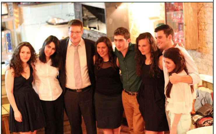
Participants of the 2012 AGBU Moscow Summer Internship Program

The program also includes sightseeing trips, visits to museums and an unforgettable trip to St. Petersburg, the cultural capital of the Russian Federation.