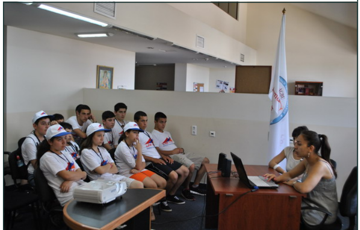
AGBU Armenian Virtual College hosts "Ari Tun" participants

At the end of the contest prizes were awarded to the winning group. It must also be noted that many of the participants showed interest in the Armenian Virtual College and its online courses of Armenian Language, History and Culture.