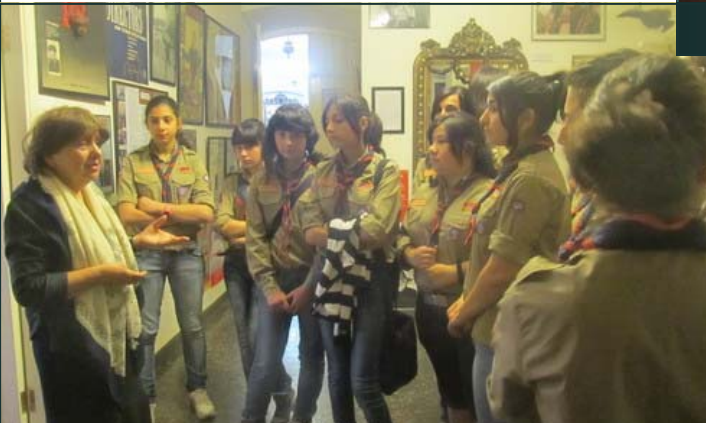
At Sergey Paradjanov Museum