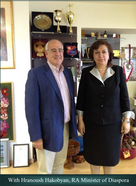
With Hranoush Hakobyan, RA Minister of Diaspora