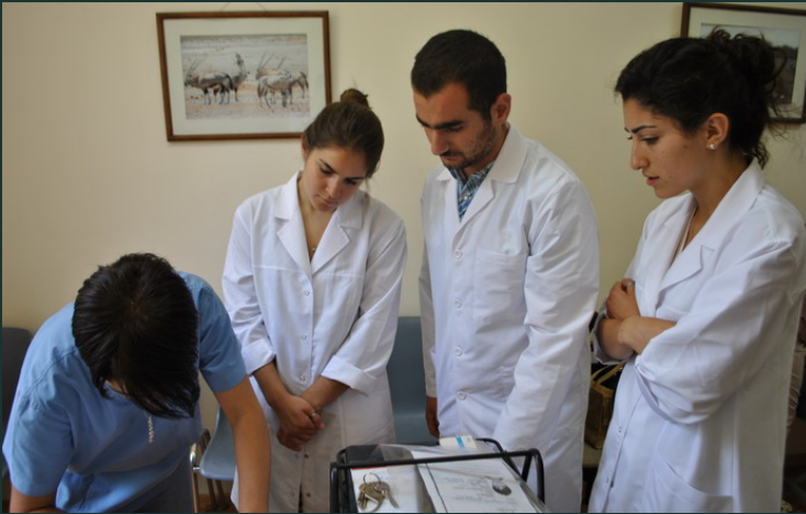
Three of YSIP participants work at Arabkir Children's Medical Center

The 6th AGBU Yerevan Summer Intern Program began on June 25. 28 participants from 5 countries, Germany, Great Britain, Lebanon, Syria and USA, will spend six weeks in Armenia, living under the same roof, working in different organizations and sharing their experience and knowledge. These are just some