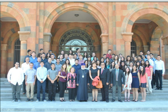
Students of AGBU schools with His Holiness Karekin II in Etchmiadzin

Every year the senior students of the AGBU worldwide schools pay visits to Armenia. These trips give the students a unique opportunity to step foot on the land of their ancestors, get acquainted with its historical and cultural monuments, meet their peers living in Armenia, as well as other public and cultural figures, go to sightseeing trips and have a better understanding of homeland. As part of these visits, a group of 65 students and their teachers from two US-based AGBU schools, "Vatche and Tamar Manoukian" and "Manoogian-Demirdjian", were in Armenia from June 4-19.