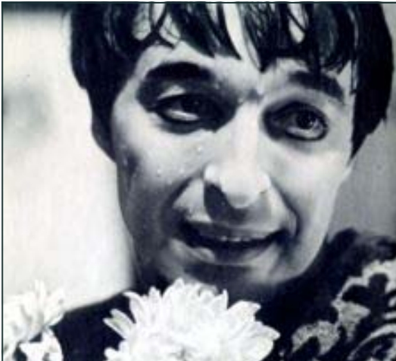
Well-known Armenian clown Leonid Yengibaryan

An interesting online cultural event "Armenians and Pantomime" was organized by the AGBU Armenian Virtual College in late May 2012. Students rated the activity as one of the most successful online social events implemented by AVC. For many of them this was the first ever experience of getting acquainted with the history of Armenian Pantomime and especially with the art of the king of clowns, Leonid Yengibaryan.