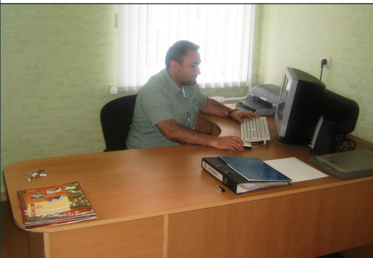
The Artsakh office coordinates the NKR projects of AGBU

Feeling the need to expand its activities in Nagorno-Karabakh and acknowledging the importance of coordinating them locally, in 2004 AGBU opened an office in Stepanakert. In the past seven years the AGBU office in Stepanakert was situated in the NK Foreign Ministry building successfully coordinating all the AGBU projects in