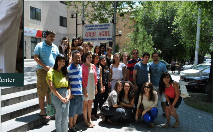
YSIP 2012 at AGBU Armenian Representation

of the organizations where the interns will work for the next six weeks: RA Diaspora Ministry, UNDP, Grand Thornton, American University of Armenia, Armenian national gallery, Deem Communications, Center for Innovative Experimental Art (NPAK), TUMO Center for Creative Technologies, Women Resource Center, "Future is Yours" NGO, "Arabkir" children's medical center, "Vitamax" pharmaceutical company, #1 hospital of Yerevan, etc. The program pursues several goals: first and most importantly, Armenian youth from different educational institutions are provided with a unique opportunity to gain professional experience and practical knowledge, have a better understanding of their homeland and involve themselves actively in its development, as well as interact with their peers both from Armenia and different communities of the Diaspora. Weekly Armenian language and folk dance classes are also an important component of the program, which includes sightseeing trips, visits to historical monuments and museums in Armenia and Artsakh, and meetings with different famous political and social figures. The group will also visit the AGBU Yerevan office, the Armenian Virtual College and AGBU's "Antranik" scout camp in Lori region of Armenia.