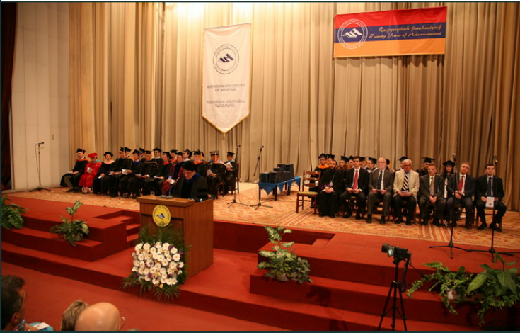
20th jubilee graduation and commencement ceremony at AUA

The 20th jubilee graduation and commencement ceremony took place at the large auditorium of the American University of Armenia (AUA) on June 23, 2012, with more than 1000 officials, faculty members, students, alumni, parents and guests in attendance, who had come to congratulate and honor this year's graduates.