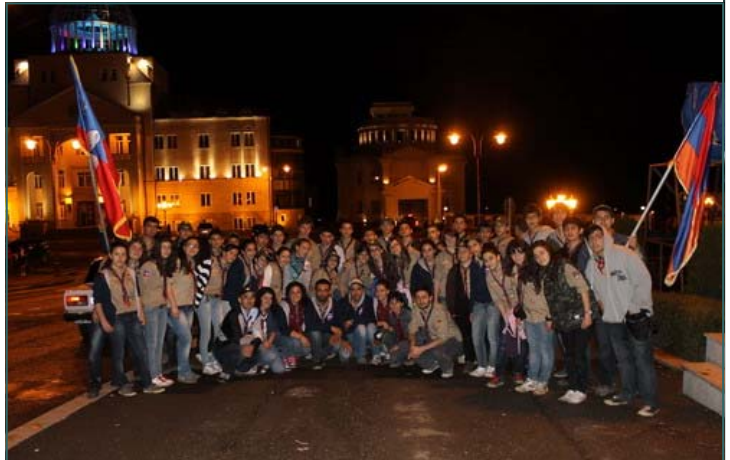
AGBU Yerevan Scouts in Stepanakert

On May 7th, members of the AGBU Yerevan Scout movement left for Artsakh to participate in the 20th anniversary events of the Shoushi liberation. They arrived in Stepanakert early in the morning. On the historical land of Artsakh AGBU scouts were met by the members of the local scout movement. After a short rest the group headed to Shoushi, where the famous Shoushi Castle had hosted the jubilee celebrations of the city’s liberation. The events continued the next day in Stepanakert and again the AGBU Yerevan Scouts were among the participants. The scouts returned to Yerevan with a proud feeling of being an Armenian, having an independent country and liberated Artsakh.