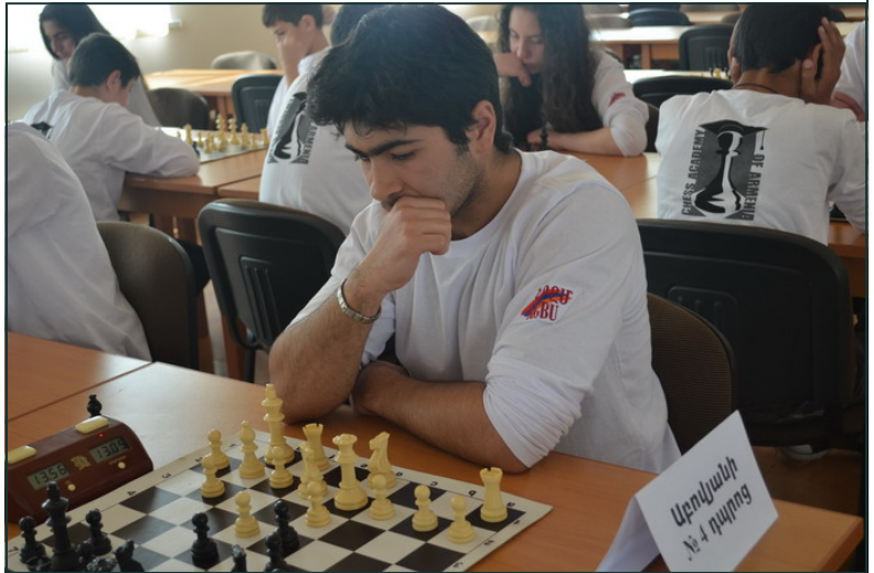
6th Republican Interschool Chess Tournament finals at the Chess Academy