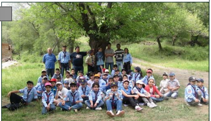
AGBU little scouts on a one-day camping trip

The elder participants of the camping visited the nearby military unit, got acquainted with different types of armament and attended an interesting lecture. After a late dinner prepared by their own hands, the scouts returned to Yerevan.