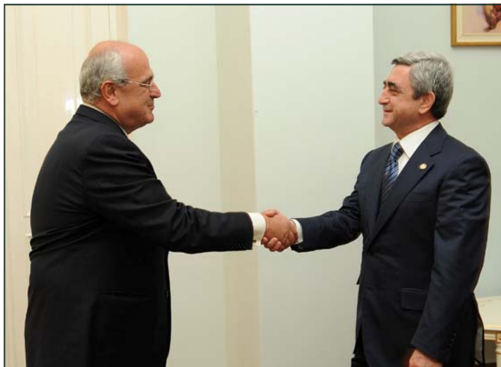
AGBU President paid a courtesy visit to RA President Serge Sargsyan