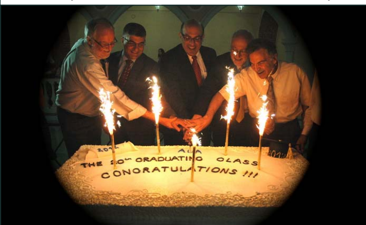
Cutting the jubilee cake