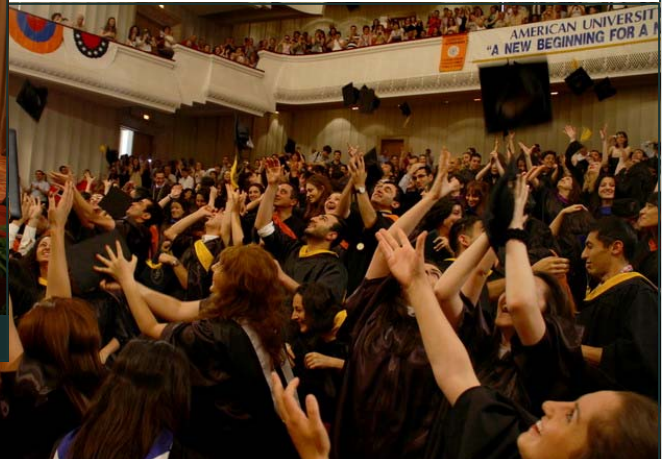
Graduates throwing their caps in the air

The Commencement ceremony started with the ceremonial procession of the class of 2012, the President of AUA, the Deans of the Colleges and the faculty, followed by the anthems of the Republic of Armenia and the United States of America.