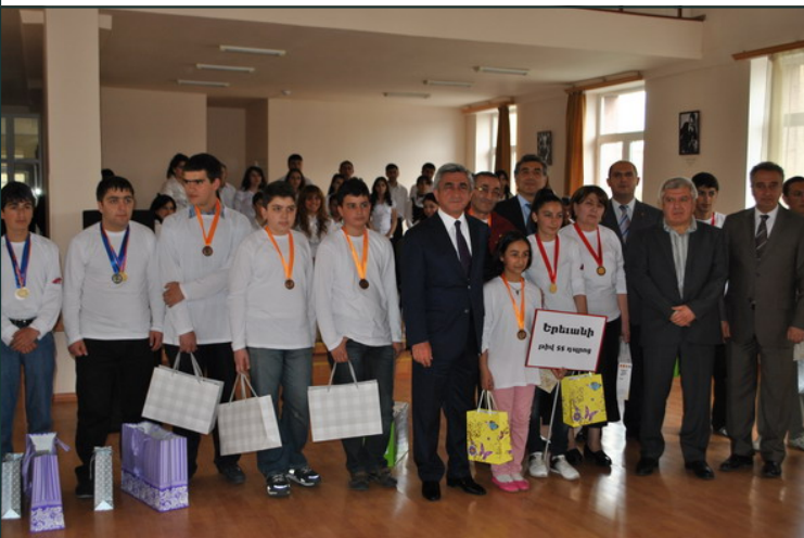
RA President Serge Sargsyan with the winners of the AGBU-funded tournament