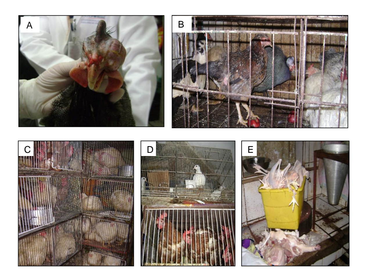
Figure 3 Conditions of birds maintained in an illegal store closed by official public health professionals. A – Guineafowl ( Numida meleagris ) seropositive for Mycoplasma gallisepticum , with swollen infraorbital sinus. B, C - Several species of birds maintained together in high densities under unsanitary conditions. D –Pigeons infected with C. psittaci intended for the trade of pets kept together with poultry intended for consumption. E – Illegal poultry meat processed in unhealthy environments intended for commerce