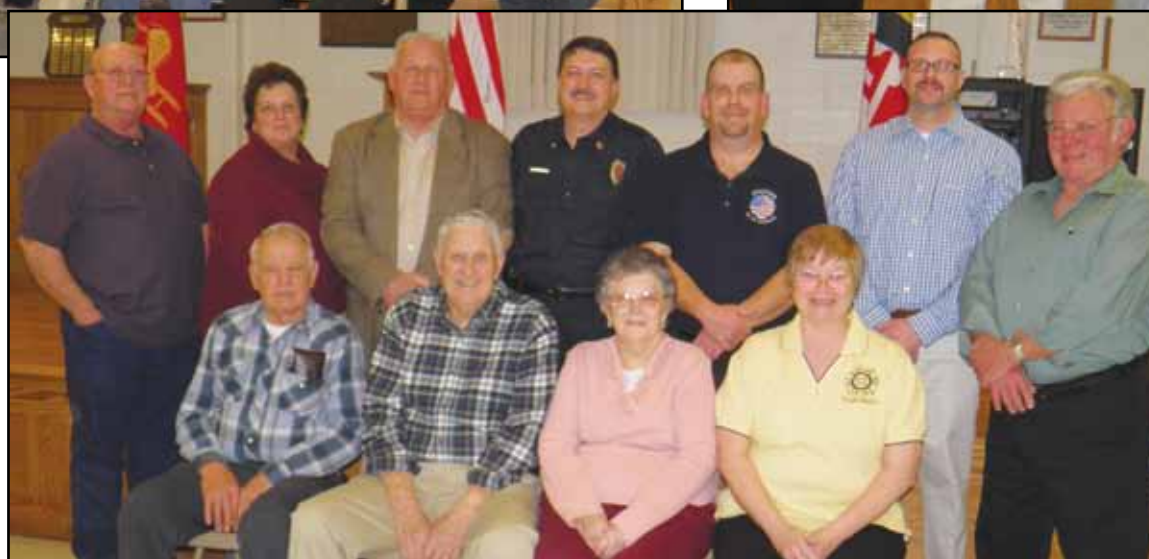
Line Officers (pictured above):