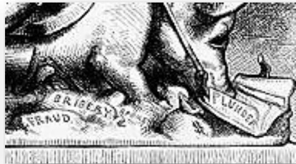
Thomas Nast, "In Memoriam – our civil service as it was", Harper's Weekly , 1877