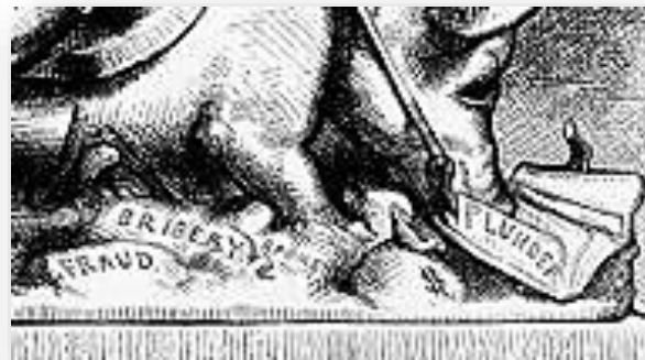
Thomas Nast, "In Memoriam – our civil service as it was", Harper's Weekly , 1877