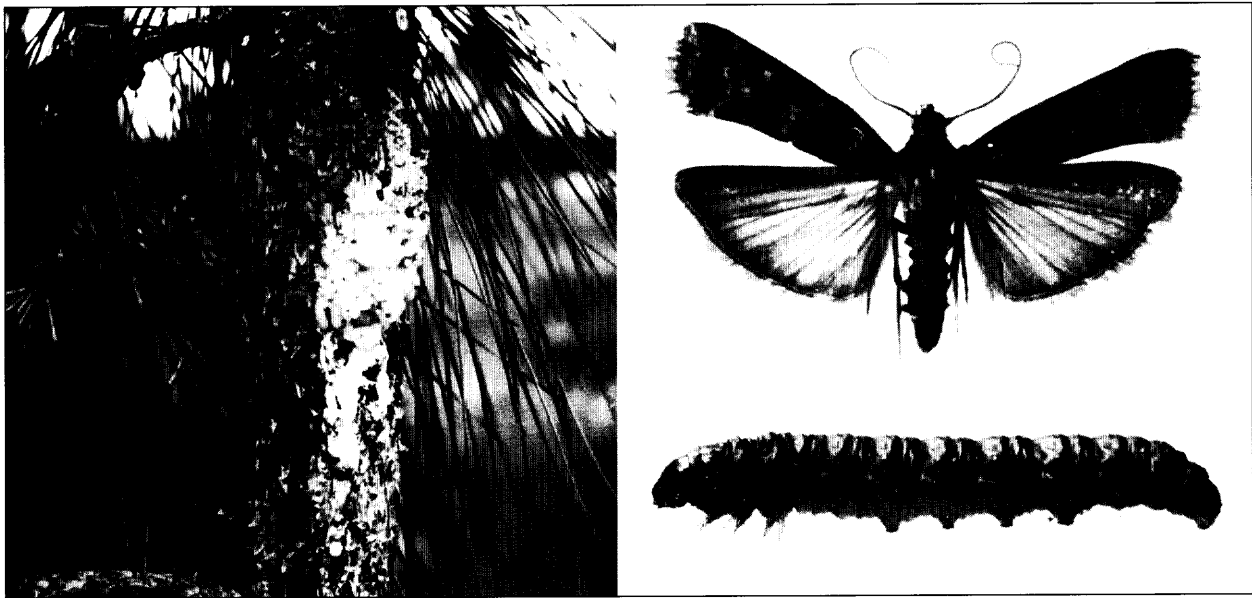
Figs. 1-3. 1) Pitch mass symptomatic of D. amatella stem and branch infestations, 2) Adult D. amatella , 3) Late-instar larva of D. amatella .