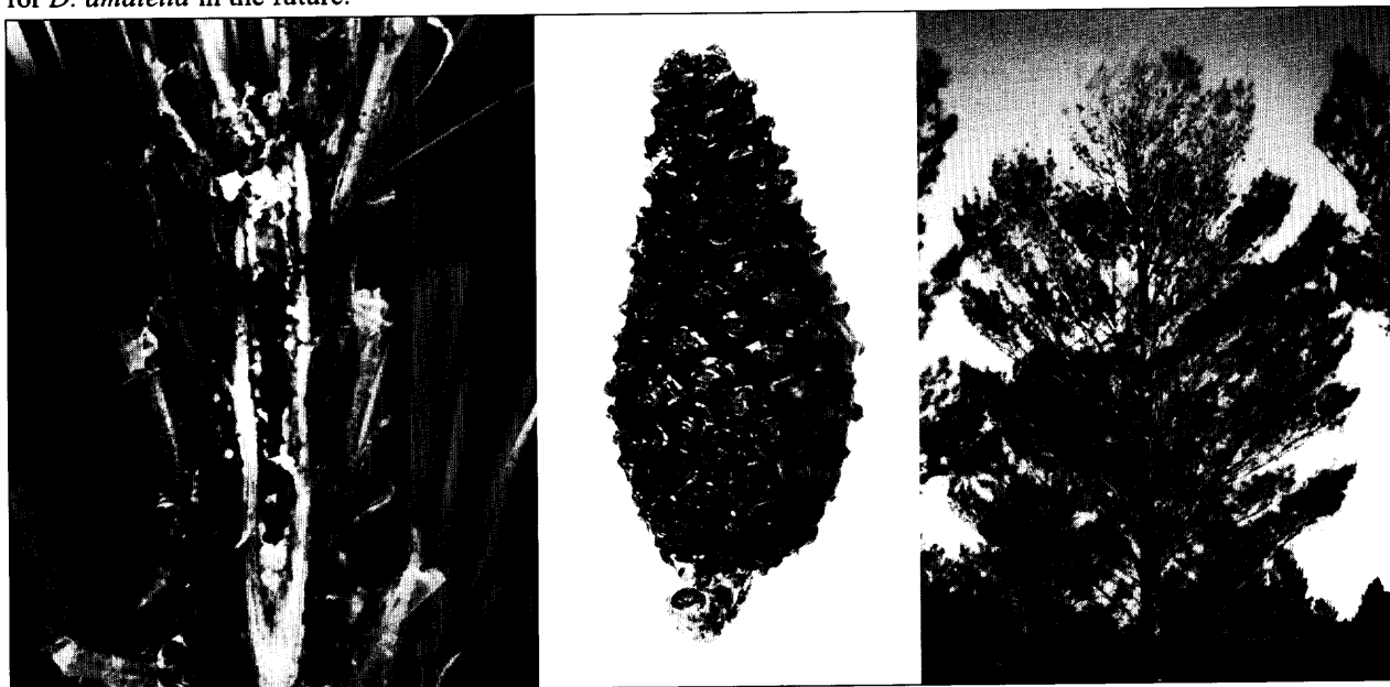
Figs. 5-7. 5) D. amatella larva causing terminal (shoot) dieback on young longleaf pine; 6) second-year slash pine cone infested by D. amatella , note resin and frass mixture evident on upper-third of cone; and 7) Top-dieback of sand pine caused by multiple stem infestations of D. amatella .