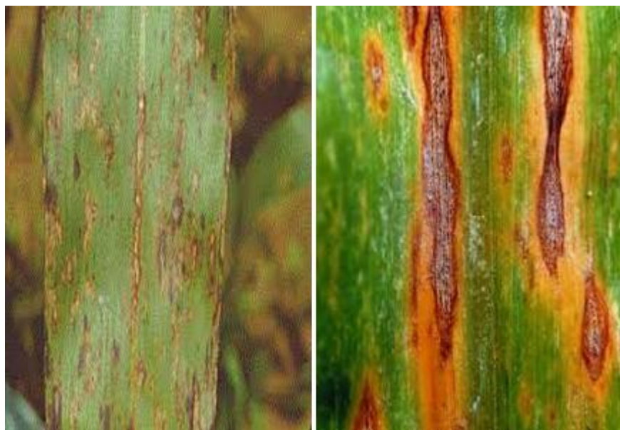
Figure 3: Foliar symptoms of sorghum anthracnose.

Although current information on yield losses due to anthracnose in most countries is lacking, it has been reported to be more than 50% (Ngugi et al. , 2000) in most tropical African countries. A study by Mengistu et al. (2019) reported losses of up to 70% in sorghum in Ethiopia, and the incidence of 100% is common in the country (Tsedaley et al. , 2016), the comparable incidence of 100% has also been reported in Uganda (Sserumaga et al. , 2013). They also noted it as an important disease in all sorghum-growing areas of the country. In Kenya, no recent information on the losses, but it has been estimated at higher than 50% with an incidence of 65% (Ngugi et al. , 2000; 2002). Old studies in West and Central Africa report anthracnose as a threat to sorghum production (Marley et al. , 2005). Losses of up to 67% were reported in Mali and other West African countries (Thomas et al. , 1996). Data on the disease's current status for most countries has not been captured, thus not presented in this section. Therefore, assessing the current situation of the disease in tropical Africa is vital.