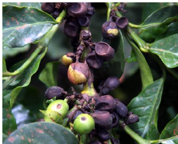
Figure 5: Coffeeberry disease symptoms.

reported to occur to immature fruits in the field, though symptoms of the disease appear at a ripening stage after germination of the fungal appressoria forming infection hyphae. Symptoms of the disease include black and sunken lesions with spore masses on the fruit (Chillet et al. , 2005).