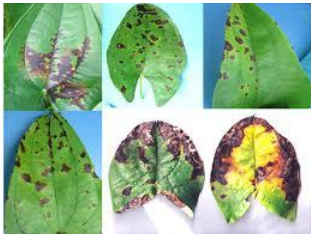
Figure 4: Leaf symptoms of yam anthracnose.

The disease has been reported in most West African countries, including Nigeria, Cameroon, Benin, Ghana, Togo, and Cote d'Ivoire. It is destructive, capable of causing yield reduction of up to 80% in high quality in West Africa (Akem, 1999). This considerable loss contributes to food insecurity in countries that heavily depend on the crop as their staple food, for instance, Nigeria.