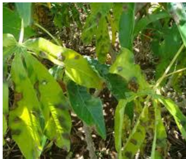
Figure 7: Leaf symptoms of CAD.

There is limited current information on the progress for disease management and yield losses caused by the disease in the African tropics. However, ancient studies reported severe infection and total crop failure when infected stems were used as cuttings in propagation (Ikotun and Hahn, 1991).