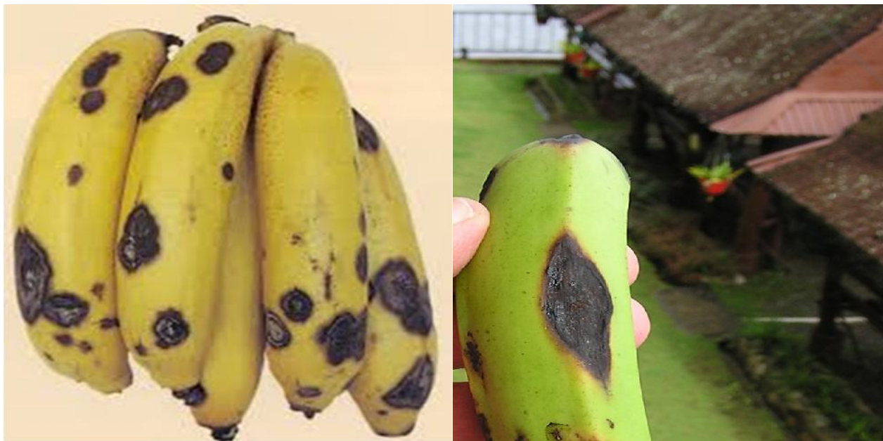
Figure 6: Banana anthracnose symptoms.

In tropical Africa, the disease has been reported in Kenya, Ethiopia, Tanzania, Uganda, Cote d'Ivoire, Zambia, Nigeria, Malawi, and Mozambique (CABI, 2001). Little information is available on estimated losses due to the disease in these countries. The fact that the ripe banana business is practised locally and subsistent in most of these countries compared to cooking banana which is the main food for many societies may be one of the reasons for little research efforts devoted by researchers to the disease in the region.