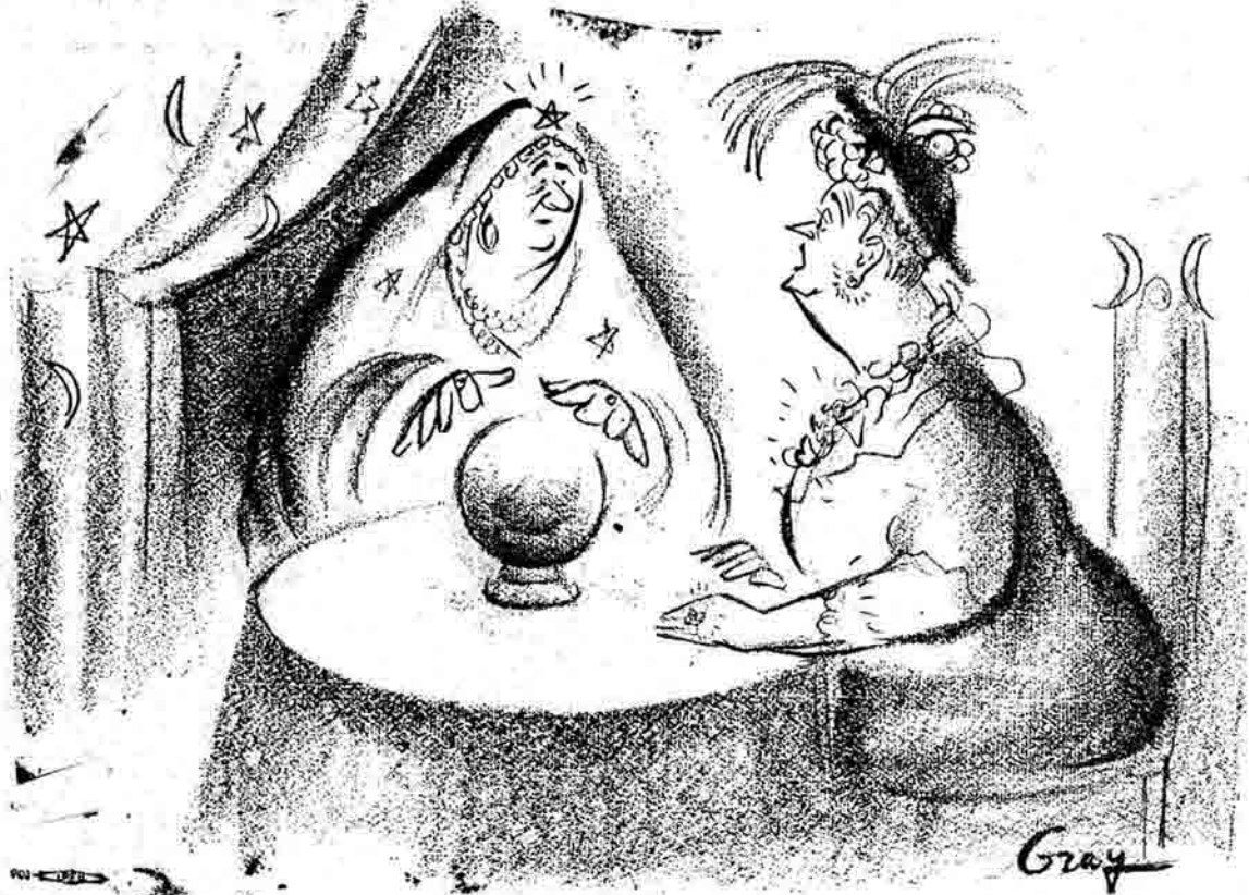
"Should I Unload My Oil Shares and Invest In Flying Saucers?"

And the National Association of Manufacturers ran advertisements that same month, predicting that if controls were lifted, "Supply will quickly catch up with demand. Prices will be fair and reasonable to all."