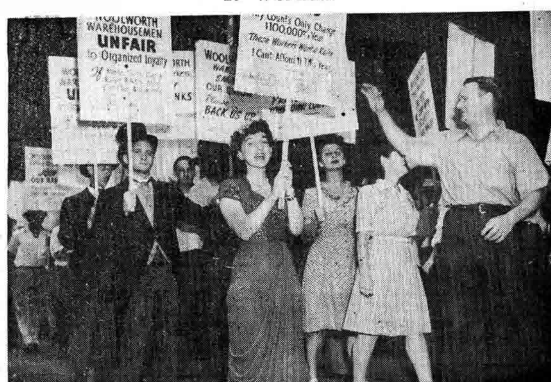
Impersonating Barbara Hutton, Woolworth heiress, and a couple of her cousins, members of Local 65, CIO Wholesale & Warehouse Workers, "picket" their union's pickline with signs reading: "My Counts Only Get $100,000 A Year, I Can't Afford A Raise For These Workers." The demonstration took place after the company had refused to offer any wage boosts and demanded abolition of the closed shop. Right after the protest, Woolworth offered a $2 weekly wage increase.