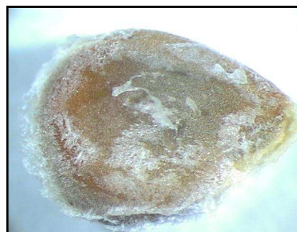
Fig. 1: Tomato seed treated and covered with an outside layer containing strains of Bacillus subtilis microcapsules.

Seedling production and inoculation of plant pathogens: Seeds inoculated with B. subtilis MIC were planted in polystyrene trays with 200 cells; peat-moss and perlite were used as substrate (50:50 p/p). Once seedling reached a height of 10 cm were transplanted in plastic pots of 10L of capacity, which contained 5Kg of soil, which previously was infested with 400,000 propagules \text{mL}^{-1} of R. solani and the same amount of spores for F. oxysporum . Pots were placed under greenhouse conditions for 90 days, diurnal temperature inside the greenhouse averaged 24-26°C; pots were distributed under a complete randomized design with twelve replications. In total, six treatments were tested, each bacterial strain was evaluated individually (B1, J1, M2) and a mixture (B1J1M2) of these bacterial strains was also evaluated. Two control treatments were included; (1) a chemical treatment (TQ) tiabendazol, using the concentration recommended by the manufacturer and (2) an absolute control (TA) (without addition of microcapsules). Inoculation of B. subtilis MIC to pots was performed before transplanting by adding 10 mg ( 1 \times 10^9 spores \text{mL}^{-1} approximately) in a small hole done previously in the center of the pot which previous was inoculated with R. solani and F. oxysporum fungi.