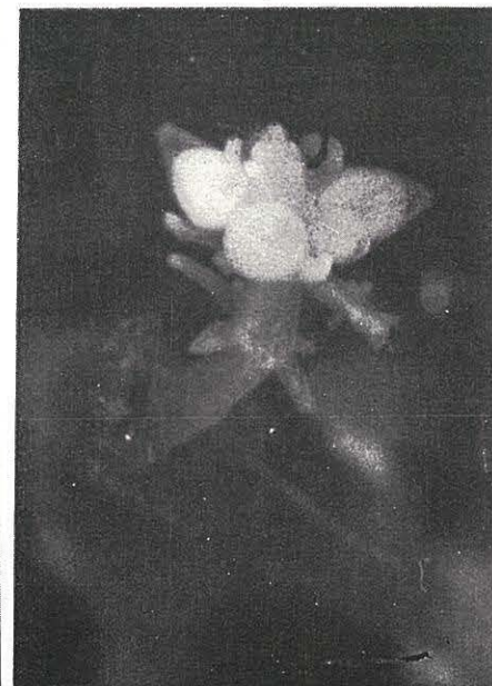
Fig. 4. A living younger polyp. Sex indetermined. Fig. 5. A living female polyp with gonophores and a new polyp bud attached on Dictyota spathulata . Distal part of polyp bent behind.

length and 0.5 mm in width. Each polyp bears male or female gonophores in different state of development.