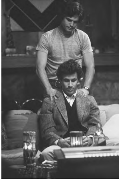
Making Love (1982) was a rare Hollywood attempt to tell a gay love story to a mainstream audience; many straight audiences of the era couldn't handle it.

established a marriagelike commitment, a move that allegedly makes homosexual relationships more acceptable to the mainstream by showing that they are just like heterosexual ones. Bart returns to the twilight world of gay bars and one-night stands, a choice that the film represents as a sort of ethereal netherworld via the use of hazy, out-of-focus city lights that symbolically seem to swallow up Bart's very identity.