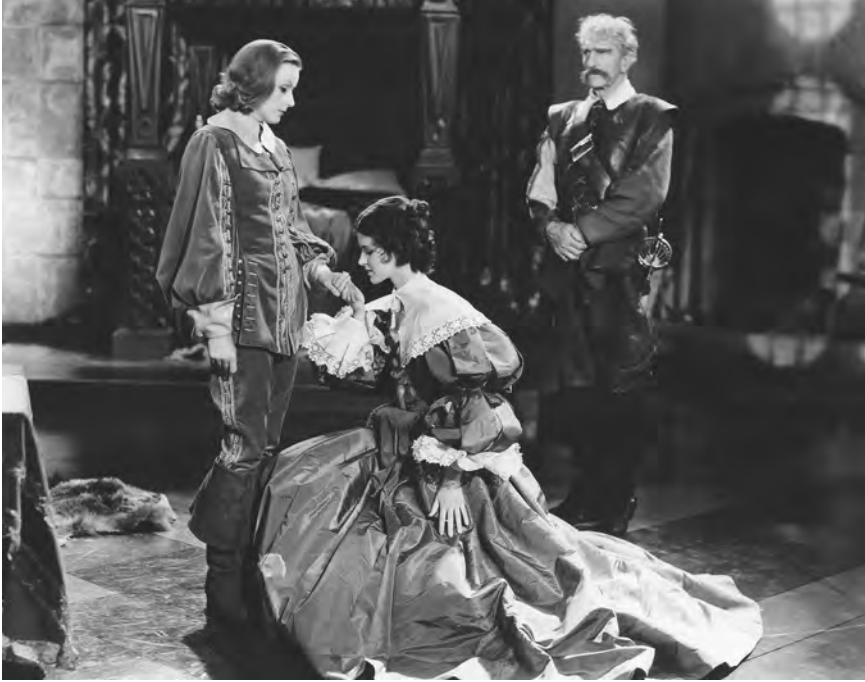
Greta Garbo in Queen Christina (1933) wears men's clothing and has intimate relations with both men and women. Is she meant to be heterosexual, homosexual, or transgendered?

movies. Along with films about underworld violence and prostitutes, pannies and their lesbian counterparts were called upon to titillate customers. The Sign of the Cross , like most of DeMille's biblical epics, also hid its exploitative sexuality behind a mask of Christian piety—such “evil” things had to be shown so that they could be condemned (or so the argument went). Morocco , Queen Christina , and The Sign of the Cross were all major box-office hits, and studios were poised to feature more and more representations of queer sexualities. In the musical Wonder Bar (1934), for example, a man interrupts a “heterosexual” couple on the dance floor, asks if he can cut in, and then dances off with the man. Female couples in various stages of intimacy are also seen in the background of various nightclub scenes in films such as Grand Hotel (1932), Cavalcade (1933), and Going Hollywood (1933). Importantly, such scenes no longer relied on gender inversion to hint at their characters' homosexuality; instead, they were beginning to show actual representations of same-sex desire and intimacy.