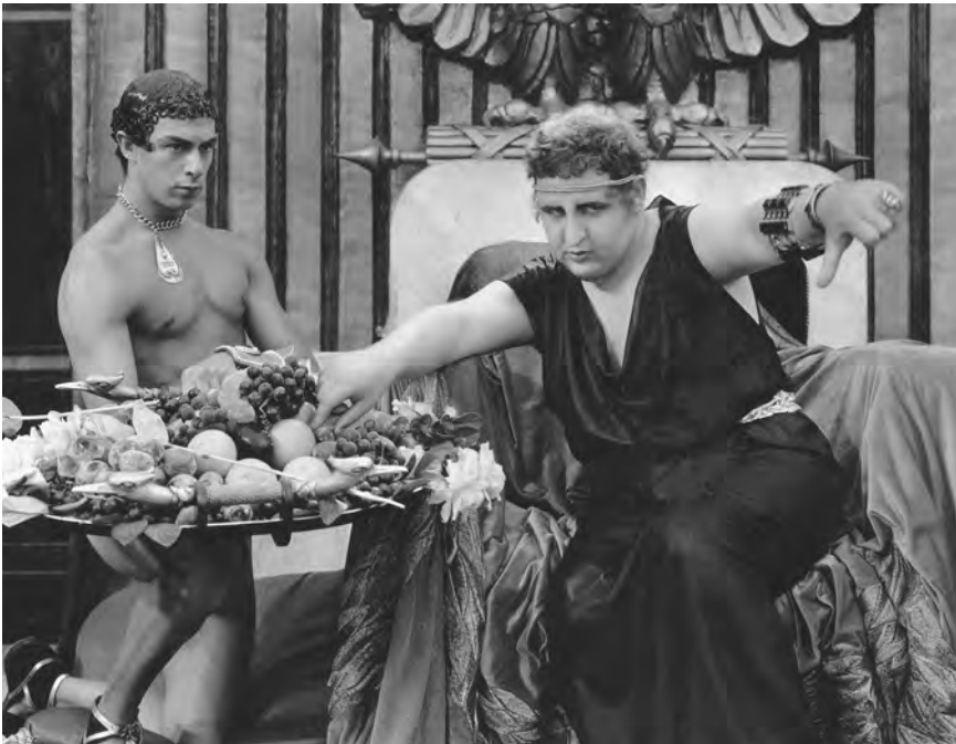
Charles Laughton as Emperor Nero is served by his beefy slave boy in The Sign of the Cross (1932), a good example of how homosexuality could be implied rather than made explicit in pre-Code Hollywood cinema.