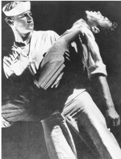
Kenneth Anger's experimental film Fireworks (1947) explores the borders between male homosexual desire and violent homosocial masculinity.