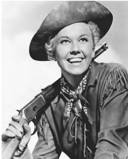
Doris Day, seen here in butch garb for her role as Calamity Jane (1953), was one Hollywood star who had a large lesbian fan following.