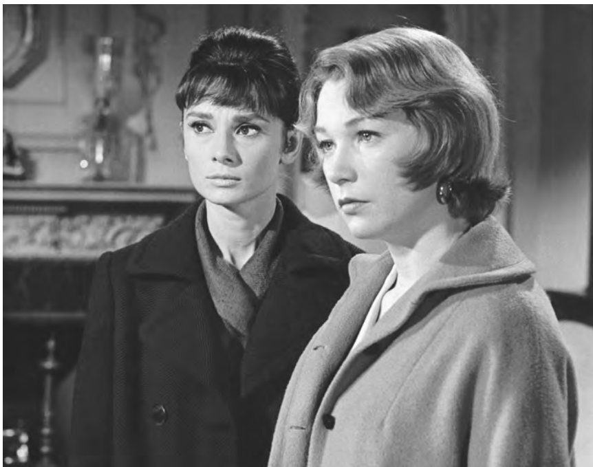
Audrey Hepburn and Shirley MacLaine starred in The Children's Hour (1961), one of the first Hollywood films to deal openly with homosexuality. Unfortunately, it all ends tragically.