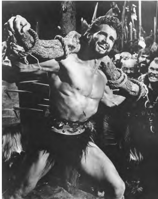
Foreign-made “sword and sandal” epics, such as Goliath and the Barbarians (1959) starring Steve Reeves, were perennial favorites among gay male filmgoers of the postwar era.

era or the Technicolor adventure films of Maria Montez. Their historical or biblical settings also called for spectacularly mannered dialogue and acting. Often such “bad” acting was due to the fact that producers cast actors who looked better than they emoted, and the less-than-natural acting of Charlton Heston or Steve Reeves helped create their camp appeal (as well as undermine their alleged “natural” masculinity). The Ten Commandments is a veritable treasure trove of camp moments, such as when Nefretiri (Anne Baxter) lustfully declaims to a mud-caked Charlton Heston, “Oh Moses, Moses, you stubborn, splendid, adorable fool!” A bit later Vincent Price as Baka, “The Master-Builder,” prissily whips a chained but scantily clad hunk (John Derek): “You’ve seen me drive my chariot—I can flick a fly from my horse’s ear without breaking the rhythm of his stride.” In this way, even the most pious and traditional of Hollywood films were queered by the era’s homosexual spectators.