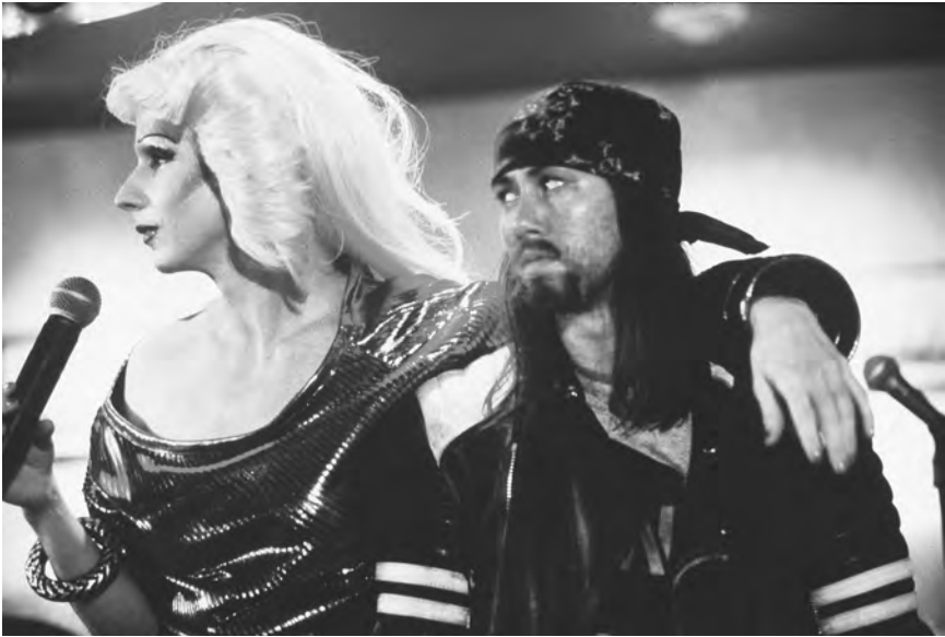
Hedwig (John Cameron Mitchell) and Yitzhak (Miriam Shor) form a very queer couple in Hedwig and the Angry Inch (2001).