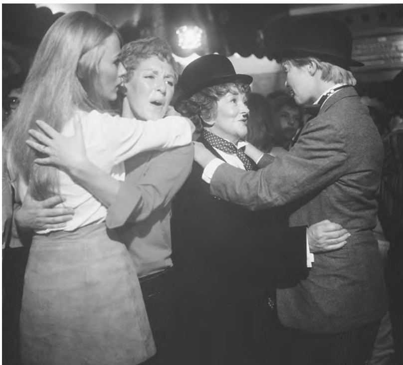
In The Killing of Sister George (1968), Beryl Reid and Susannah York play lesbian lovers; in this scene, shot on location at a lesbian nightclub, they attend a costume ball dressed as Laurel and Hardy.