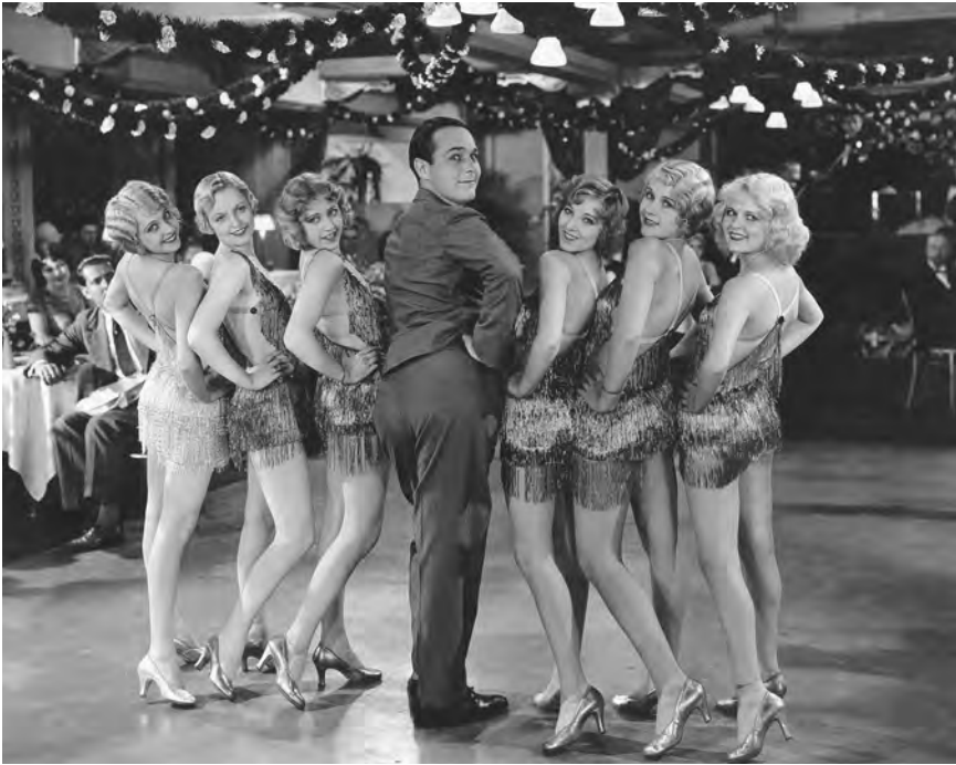
Hollywood star William Haines, seen here camping it up on the set of Alias Jimmy Valentine (1928), was forced out of the industry because he refused to stay in the closet.