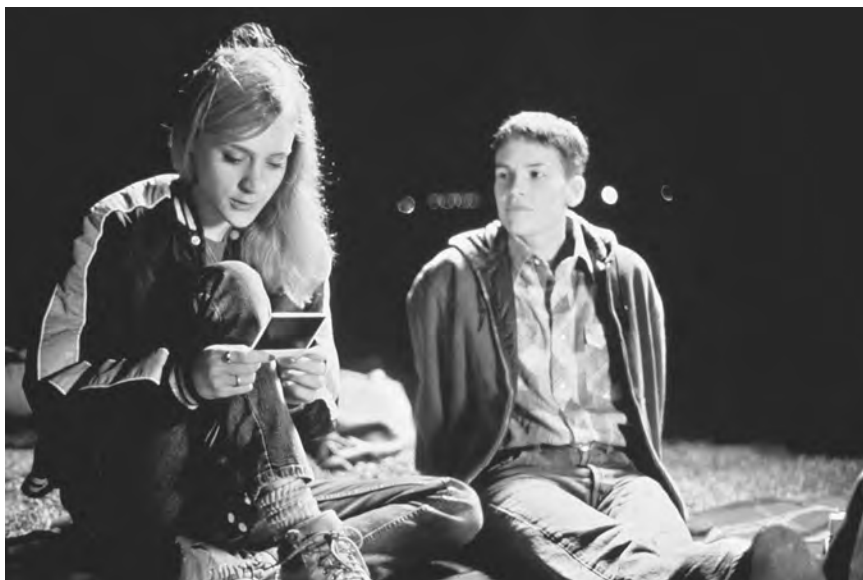
Chloe Sevigny and Hilary Swank in Boys Don't Cry (1999), an Oscar-winning independent film based on the real-life murder of transgendered youth Brandon Teena.