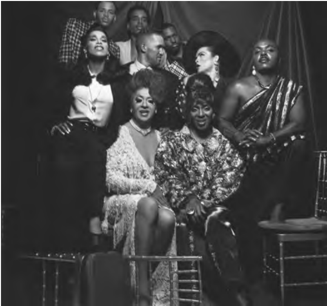
Jennie Livingston's documentary Paris Is Burning (1990) explored the unique subcultures created by some of the era's urban queers of color.