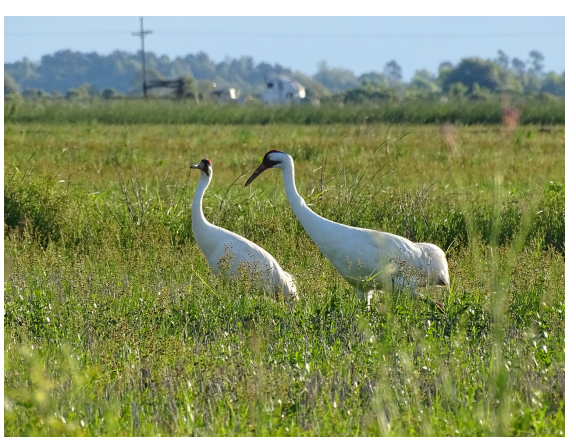
Whooping Crane