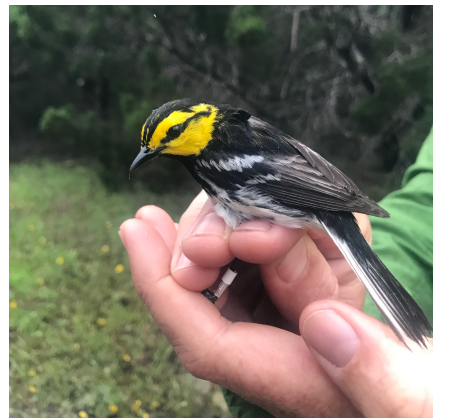
Golden-cheeked Warbler