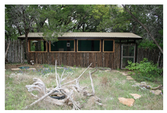
Windows on Nature: Photo taken by Rafael Ruiz

Guests enjoyed the hill country smells of fresh spring as they strolled through the trails of Chaetura Canyon, catching glimpses of flittering friends in the trees. One of the most popular areas of the canyon was the Windows on Nature view: a covered sitting area where guests could enjoy a variety of birds flitting to and fro.