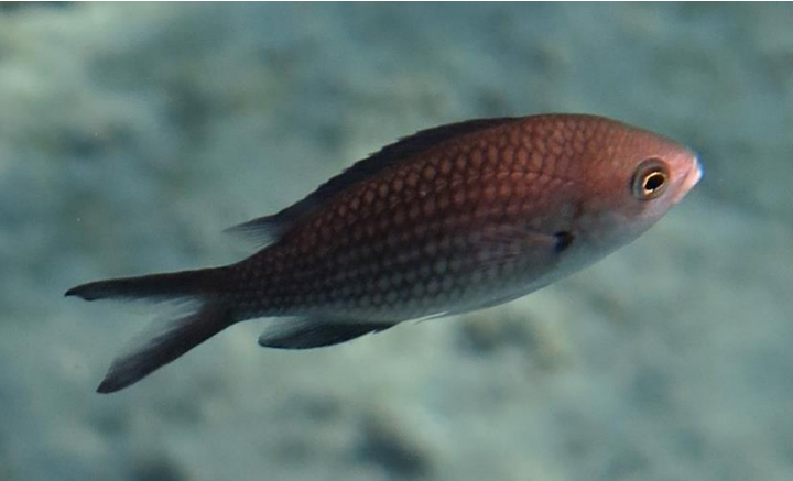
Chromis chromis Damselfish