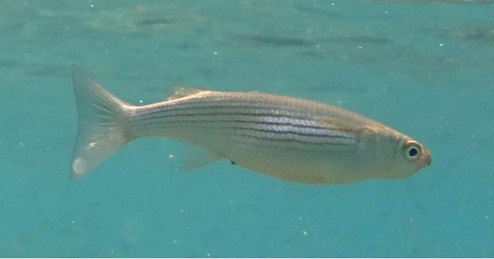
Odealechilus labeo Boxlip mullet