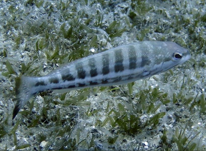
Serranus cabrilla Comber