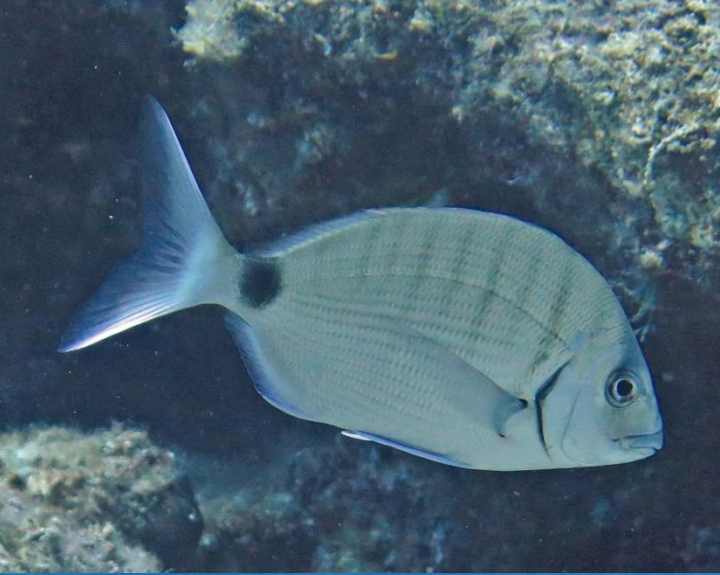
Diplodus sargus sargus White seabream