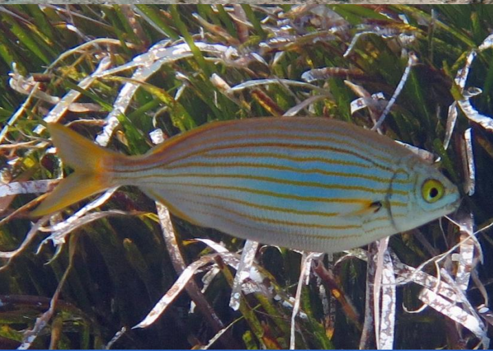
Sarpa salpa Salema