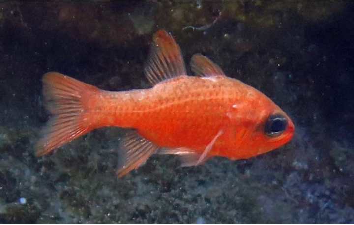
Apogon imberbis Cardinal fish