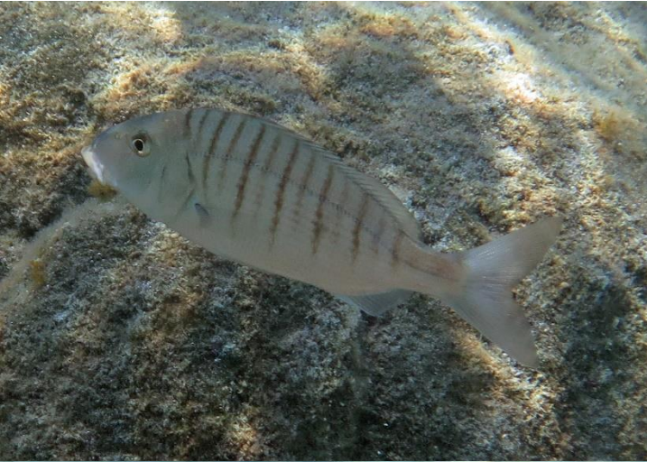
Lithognathus mormyrus Sand steenbras