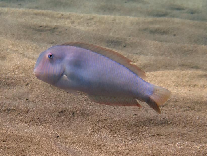
Xyrichtys novacula Pearly razorfish