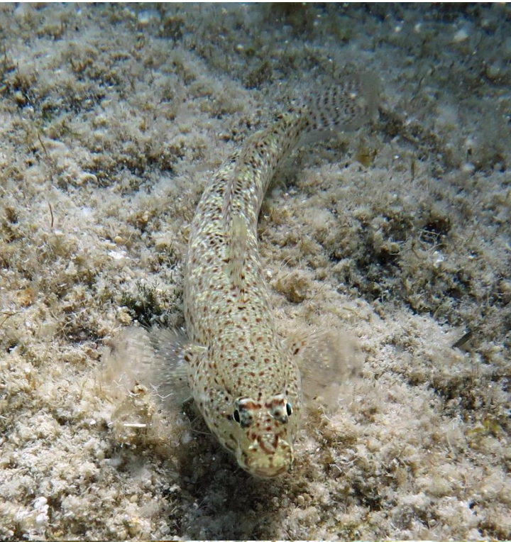
Gobius bucchichi Bucchich's goby