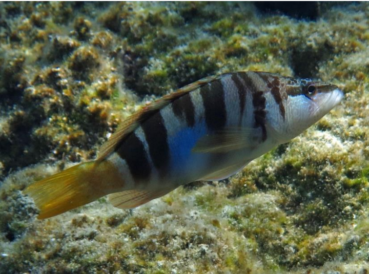
Serranus scriba Painted comber