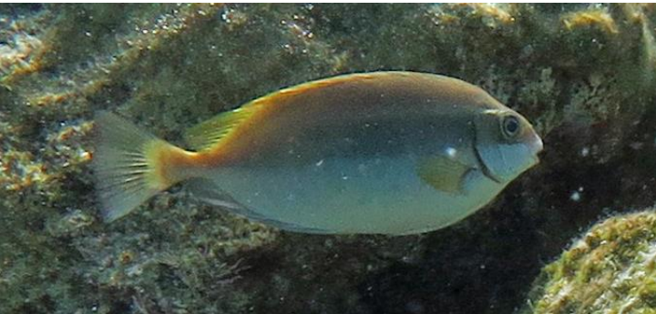
Siganus luridus Dusky spinefoot