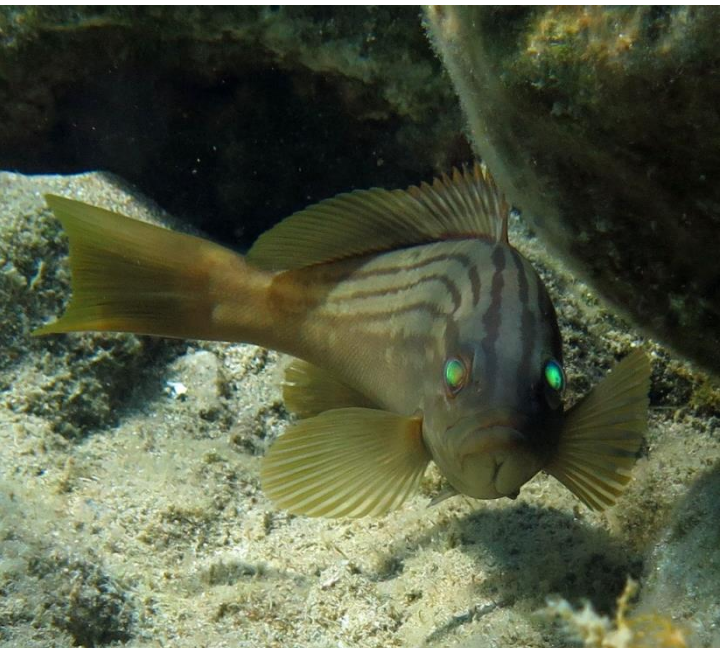
Epinephelus costae Goldblotch grouper