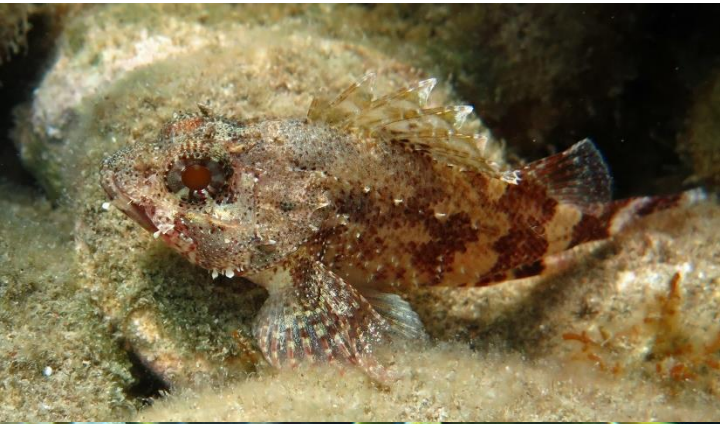
Scorpaena maderensis Madeira rockfish