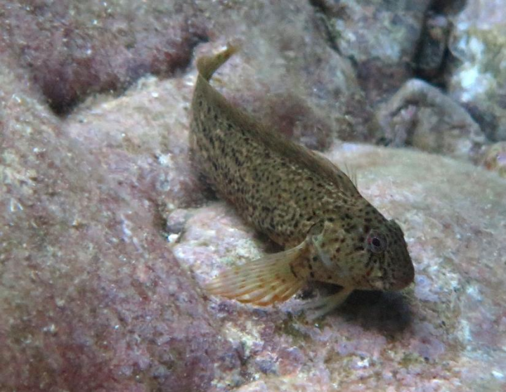
Parablennius sanguinolentus Rusty blenny