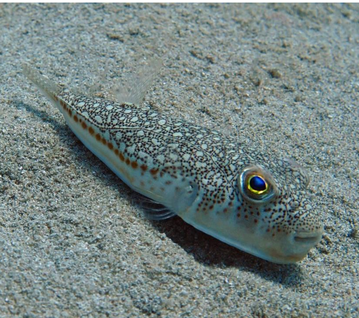
Torquigener flavimaculosus Yellowspotted puffer