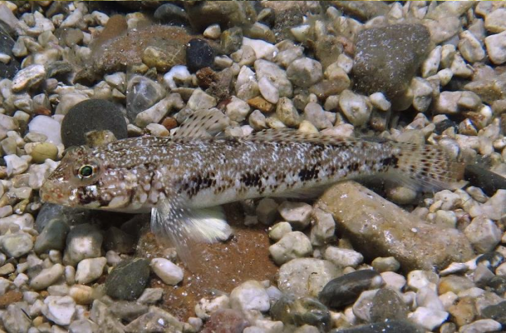
Gobius geniporus Slender goby