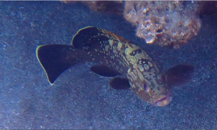
Epinephelus marginatus Dusky grouper