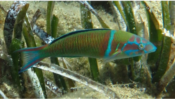
Thalassoma pavo Ornate wrasse