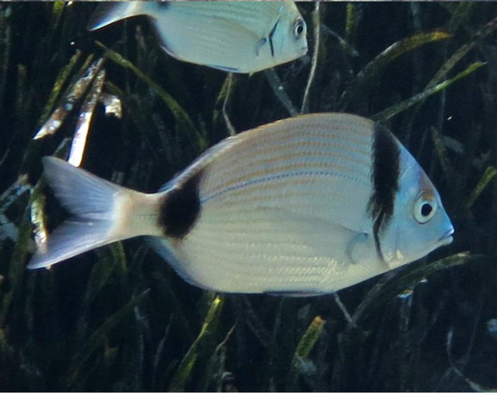
Diplodus vulgaris Common two-banded seabream