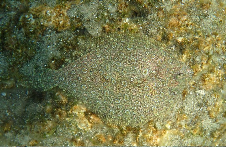
Bothus podas Wide-eyed flounder