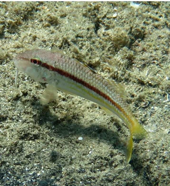
Mullus surmuletus Surmullet