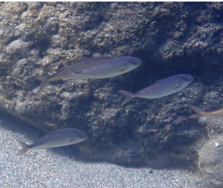
Seriola dumerili Greater amberjack