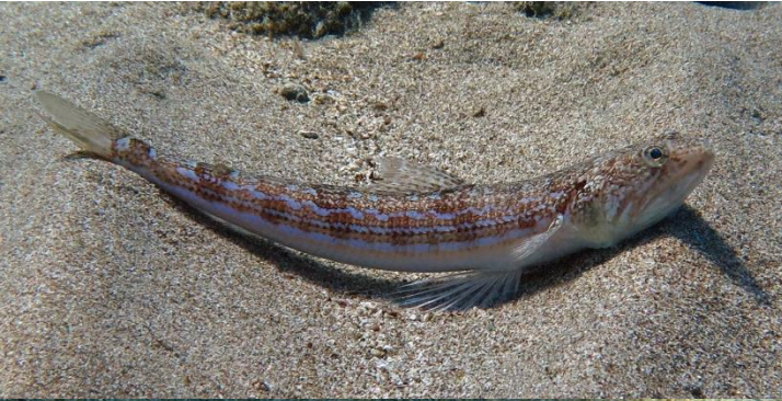
Synodus saurus Atlantic lizardfish