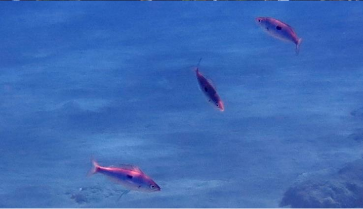
Spicara maena Blotched picarel