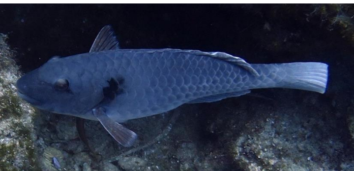
Sparisoma cretense Parrotfish Male

Female (left corner) and juvenile (below)