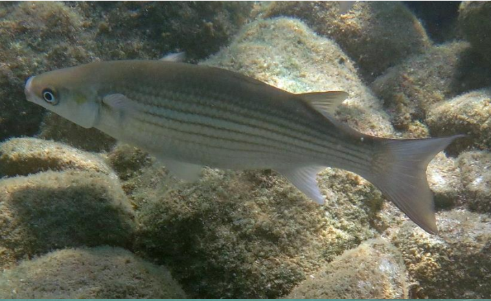
Liza aurata Golden grey mullet