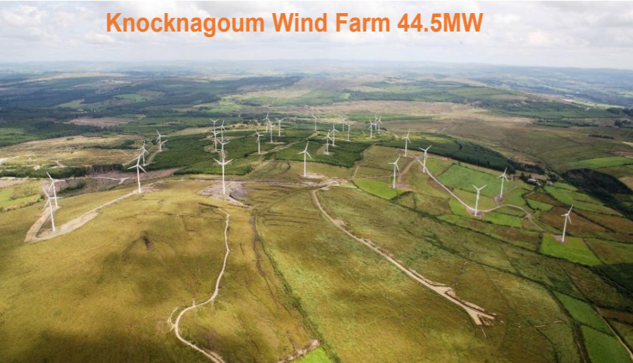
Knocknagoum Wind Farm 44.5MW