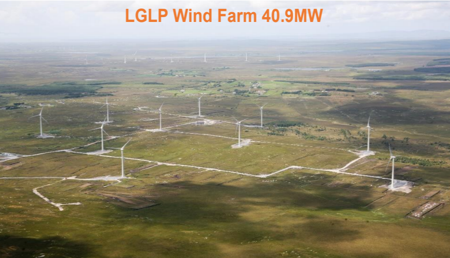
LGLP Wind Farm 40.9MW

Ireland imported 66% of its energy requirement in 2017, one of the highest ratios in Europe. The more of its own energy Ireland can produce, the less vulnerable it would be to foreign policy and conflict interrupting gas, oil and electricity supply lines. There is an opportunity to continue developing a strong indigenous wind industry, that will take advantage of Ireland's excellent wind resource, reducing our import dependency.