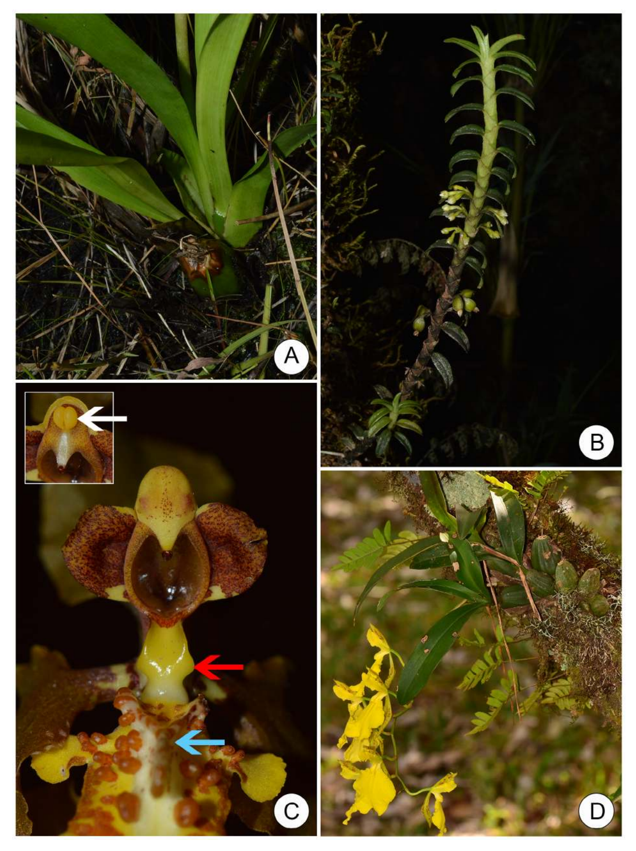
Figure 1. Habits, growth types and morphological features of the Oncidiinae. A. The terrestrial Gomesa hydrophila , adapted to wetlands; B. Monopodial growth and distichous leaves in an unidentified species of Fernandezia ; C. Detail of pollinia (white arrow), tabula infrastigmatica (red arrow) and the callus (light blue arrow) in flower of Gomesa imperatoris-maximiliani ; D. Epiphytism, uninodal pseudobulbs and sympodial growth in the "oncidioid" orchid Gomesa concolor .