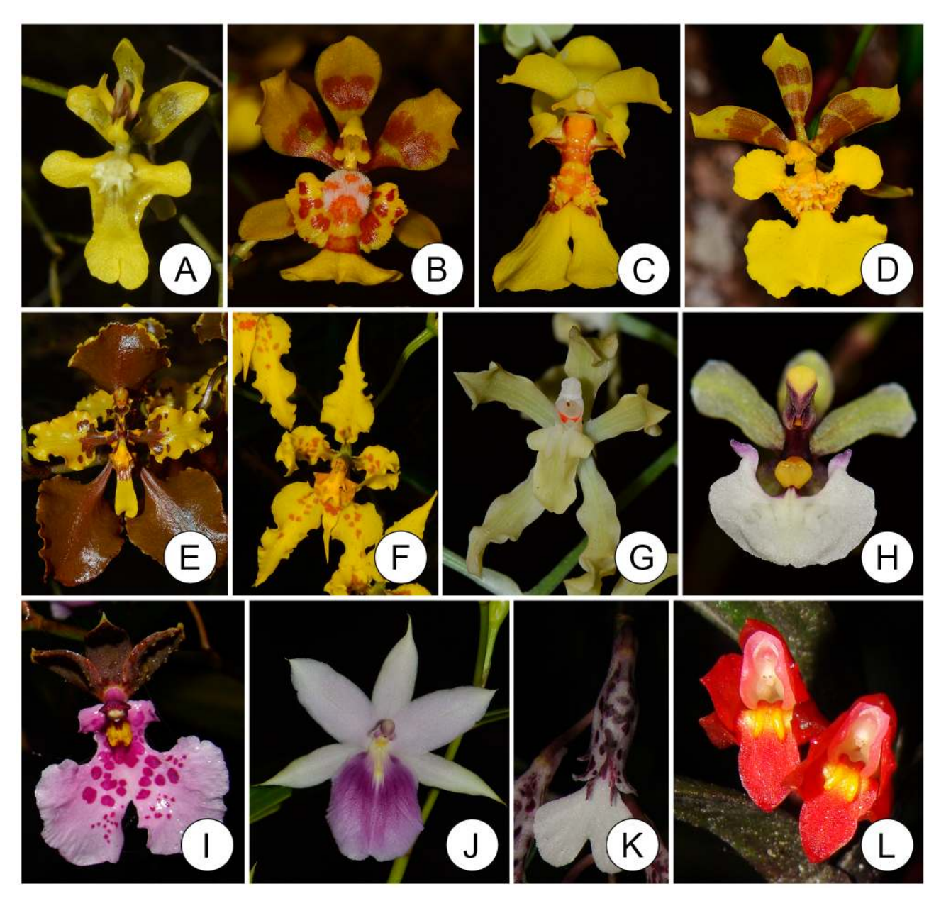
Figure 2. Diversity of flowers within Oncidiinae. Note the representativeness of yellow/brown flowers ( A-F ), corresponding to the "oncidioid" orchids. A. Oncidium ornithorrhynchum; B. Grandiphyllum divaricatum; C. Lockhartia lunifera; D. Gomesa longipes; E. Cyrtochilum tetracopis; F. Cyrtochilum auropurpureum; G. Gomesa crispa; H. Gomesa radicans; I. Caucaea sp.; J. Miltonia regnellii; K. Rodriguezia decora; L. Fernandezia sp.