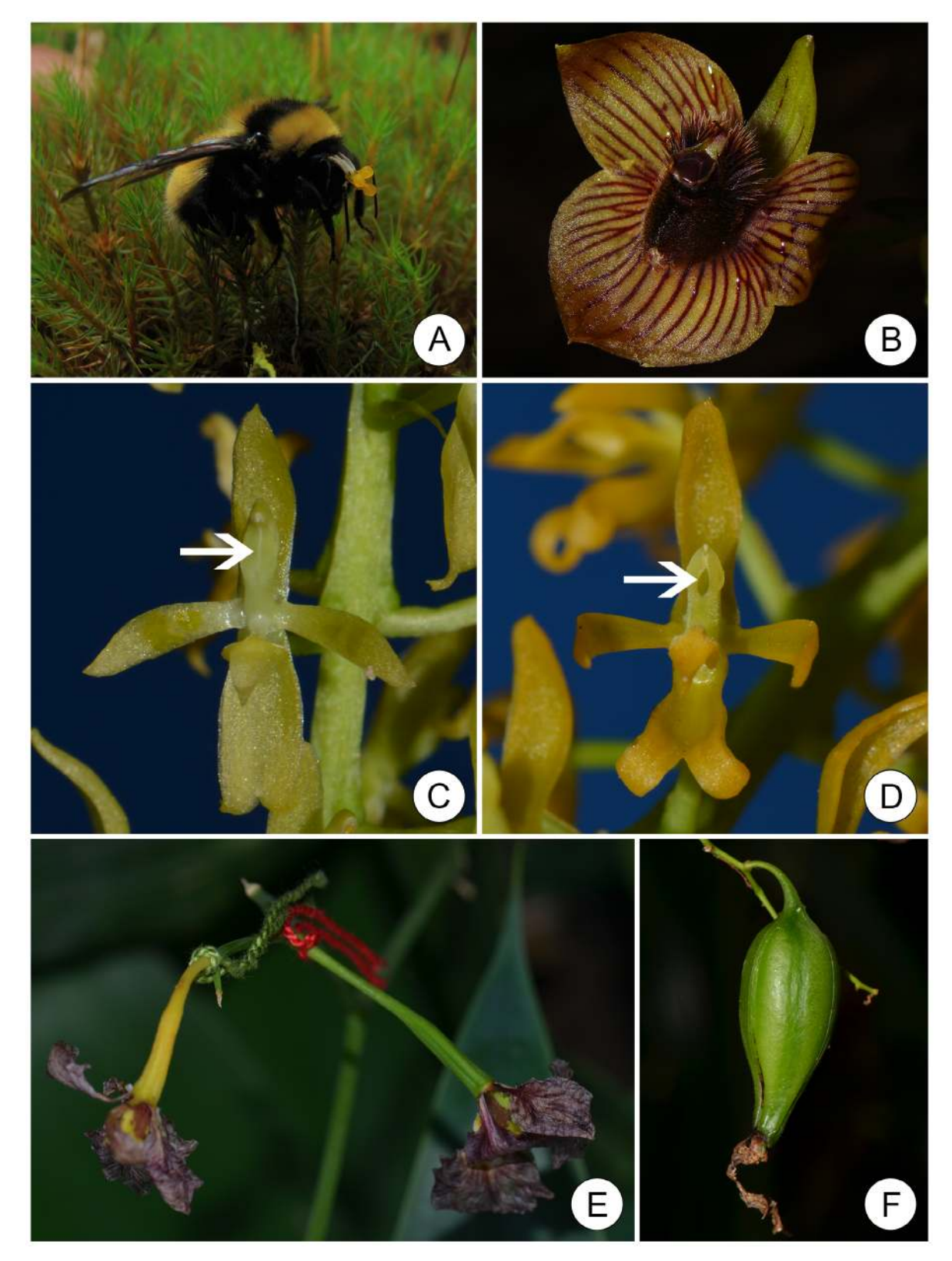
Figure 4. Deceptive pollination strategies and aspects of the breeding systems in Oncidiinae orchids. A. Pollinaria of an unidentified species of Oncidium attached to Bombus rubicundus , a putative case of deception of resources; B. Flower of Telipogon ortizii , a putative case of sexually deceptive species; C-D. Protandry in Notylia cf. hemitricha ; C. Male function, when the stigmatic cavity is closed (arrow) and unable to receive pollen loads; D. Female function, when the column walls open and expose the stigmatic cavity (arrow), allowing its pollination; E. Development of fruits by self-pollination (green mark) and cross-pollination (red mark) in Gomesa imperatoris-maximiliani . Note its tendency to self-incompatibility, since fruits formed by selfing are aborted; F. Well-developed fruit of Gomesa flexuosa .