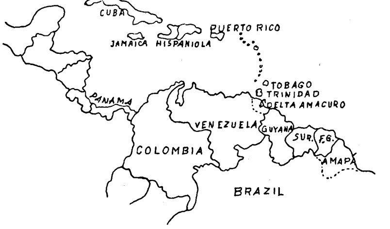
FIG. 1. Map of Suriname. FIG. 2. Map of northern South America and adjacent regions.