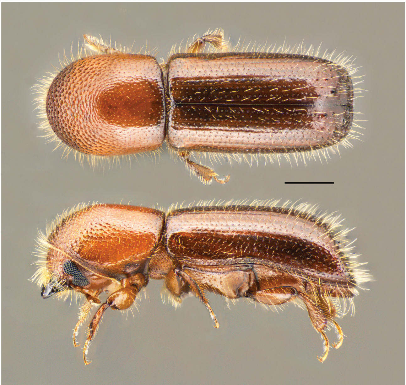
FIGURE 1. Dorsal and lateral habitus of Xyleborus monographus . Scale bar represents 0.5 mm.

As with all xyleborine ambrosia beetles, X. monographus exhibits sib-mating, with haploid and wing-less males (Kirkendall 1993). Schedl (1964) reports a sex ratio of 8.5:1 females to males. Other species of xyleborines have been reported to have ratios similar to this or more females to males (Smith & Hulcr 2015), and additional studies may show a more female biased sex ratio for this species as well.