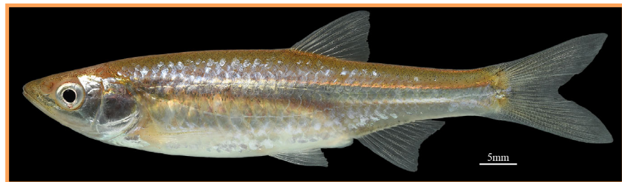
Sharpnose Shiner Notropis oxyrhynchus, endemic to Texas, is a prairie stream cyprinid belonging to the pelagic broadcast-spawning reproductive guild. This specimen was collected from the Brazos River in Seymour, Baylor Co., TX.