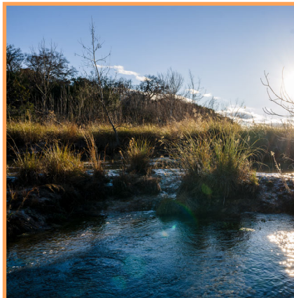
Kerr Wildlife Management Area.