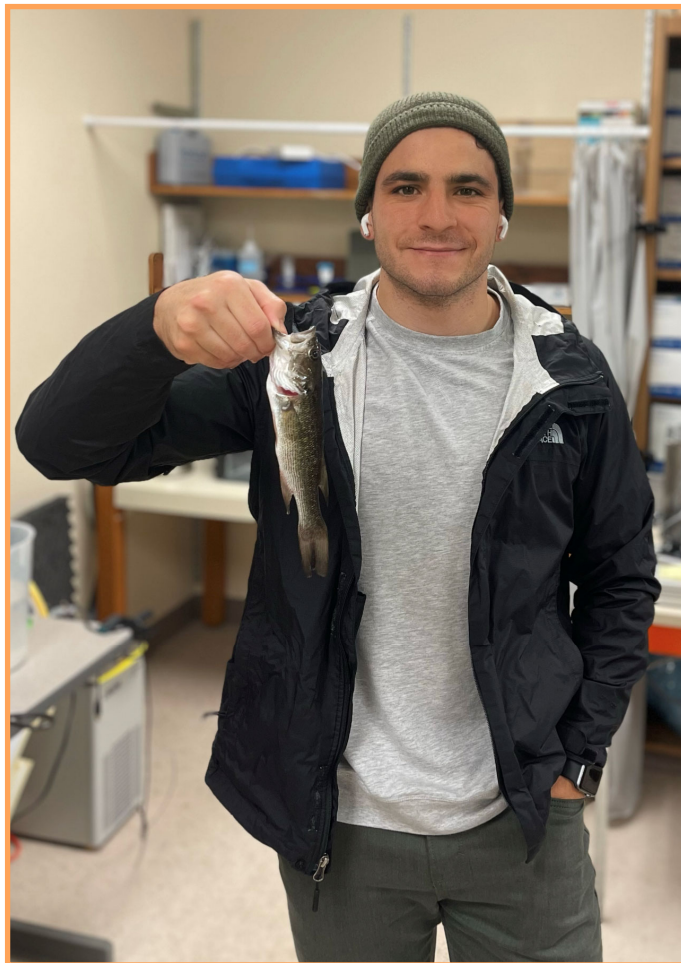
Cameron Emadi with Guadalupe bass.