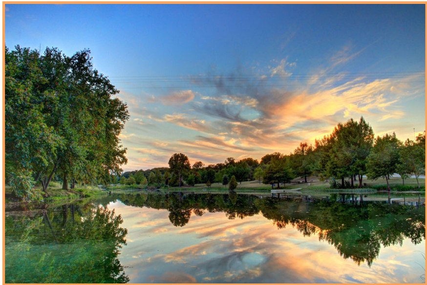
North Fork Guadalupe River at Mo-Ranch.

THE DEADLINE FOR MEETING REGISTRATION IS JANUARY 21, 2021.