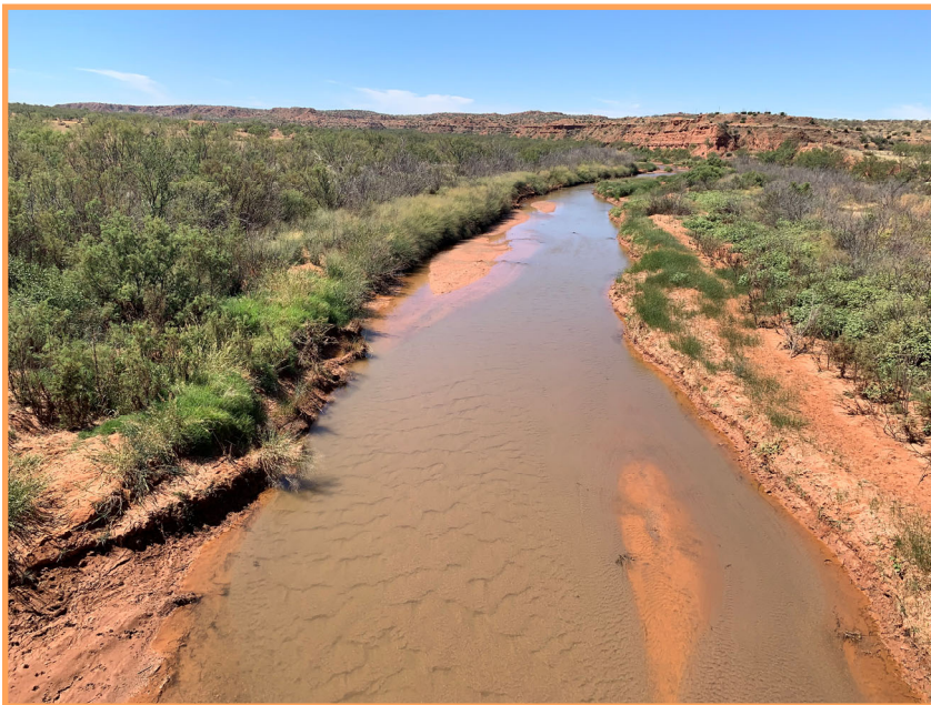
Double Mountain Fork Brazos River. Hwy 70 N. of Rotan, Fisher Co., Texas.

In addition, we hope to develop a new model for across-employer, across-location, and across-disciplinary synthesis that can be transferred to other systems and locations. This model will promote high quality science, facilitate excellent monitoring data collection, aid decision-making, and guide future research and management activities.