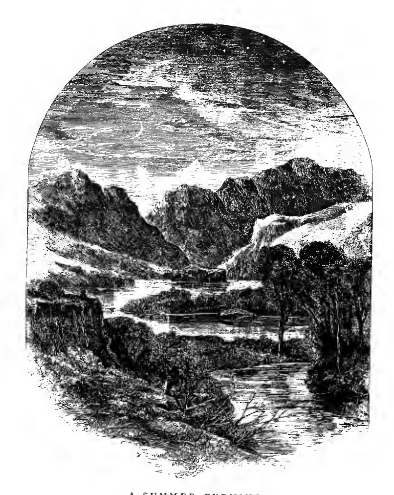
A SUMMER EVENING.

"Long had I watched the glory moving on O'er the still radiance of the lake below."